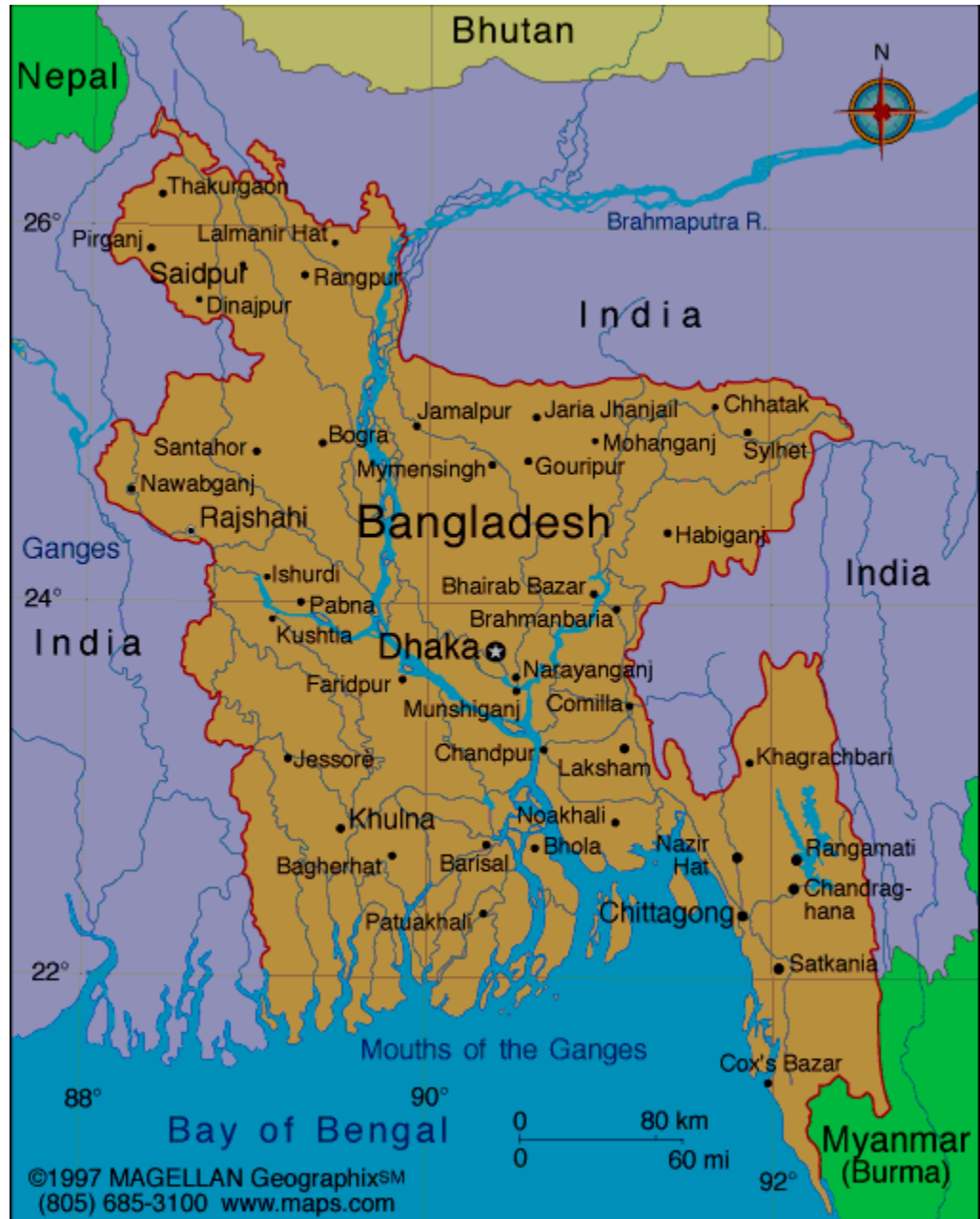
Figure 1.1 The map of Bangladesh.