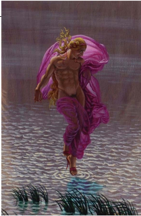
Figure 17. Miss Chief Eagle Testickle Kent Monkman. Trappers of Men (detail), 2006 Acrylic on canvas, 213.36 x 365.76 cm Mo... eal