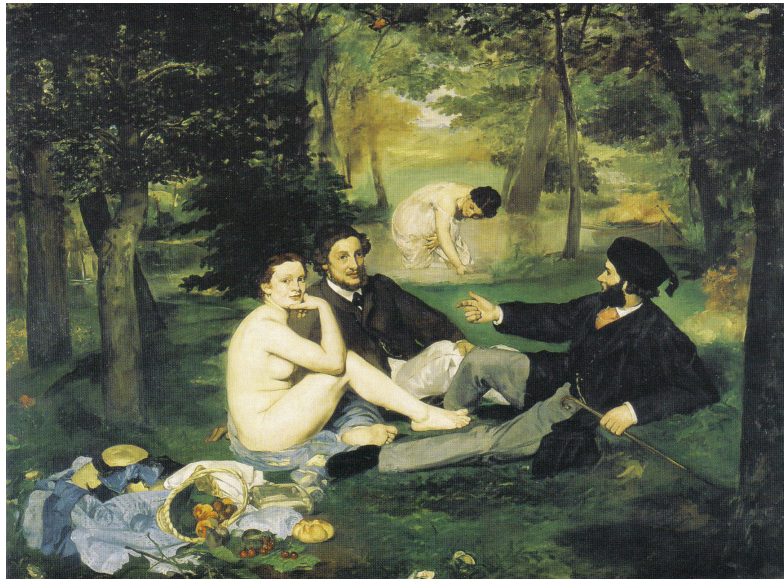
Figure 8. Edouard Manet, Le Déjeuner sur l'herbe , 1863 Oil on canvas, 213 x 269 cm Musée d'Orsay, Paris