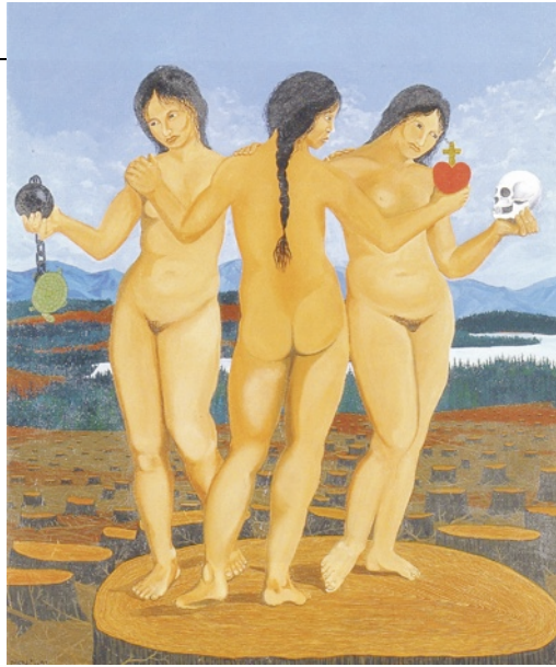
Figure 9. Jim Logan, The Three Environmentalists , 1993