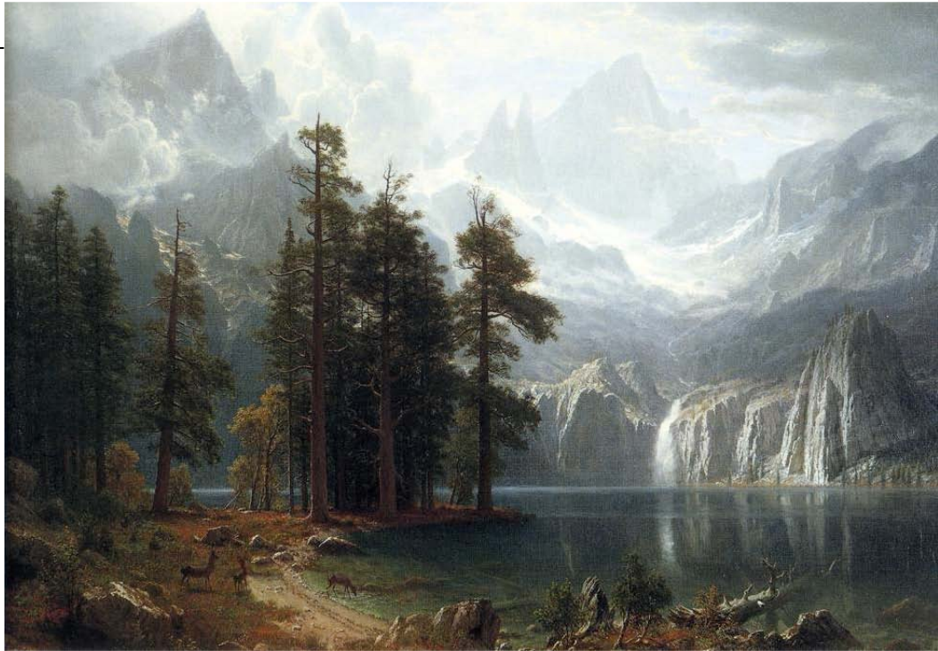
Figure 13. Albert Bierstadt, Sierra Nevada , 1871-1873