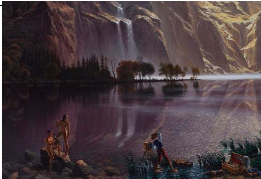
Figure 15. Edward Curtis with two First Nations models. Kent Monkman. Trappers of Men (detail), 2006 Acrylic on canvas, 213.36 x 365.76 cm Montreal Museum of Fine Arts, Montreal