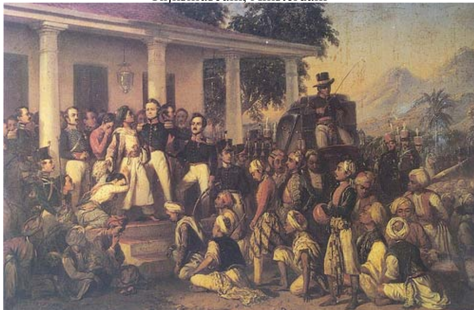
Figure 4. Raden Saleh, The Arrest of Diponegoro , 1857 Oil on canvas, 112 x 179 cm Museum Istana, Jakarta.