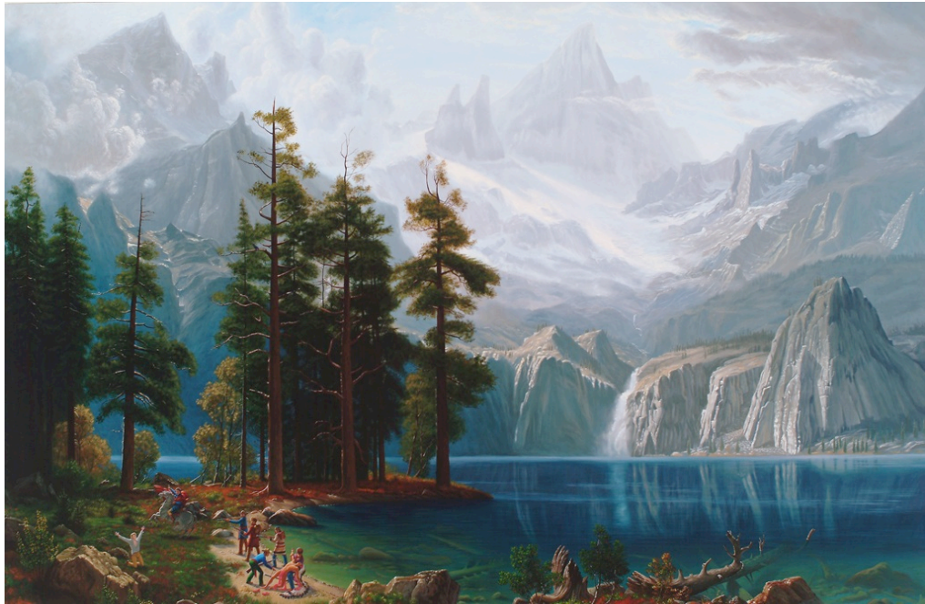
Figure 12. The Fourth of March , 2004 Acrylic on canvas, 182.9 x 274.3