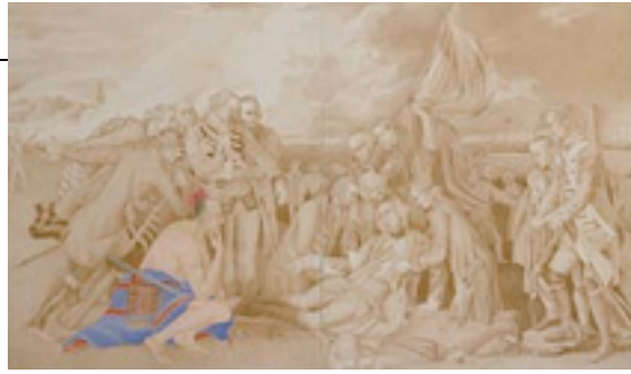
Figure 5. Robert Houle, Kanata (detail), 1992 Acrylic and conté crayon on canvas, 228.7 x 732 cm National Gallery of Canada, Ottawa