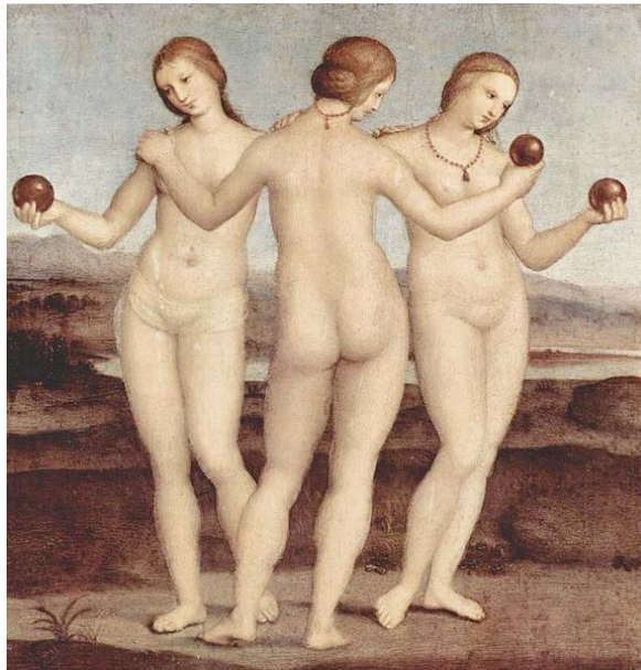
Figure 10. Raphael, The Three Graces , 1504-1505 Oil on panel, 17 x 17 cm Musée Condé, Chantilly