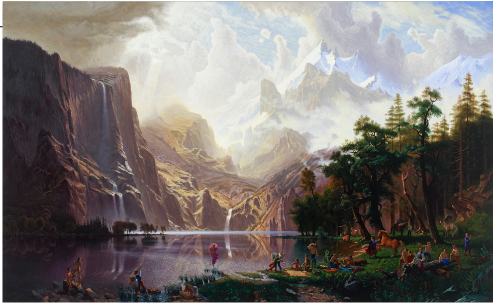
Figure 11. Miss Chief Eagle Testickle, (Kent Monkman), Trappers of Men , 2006 Acrylic on canvas, 213.36 x 365.76 cm