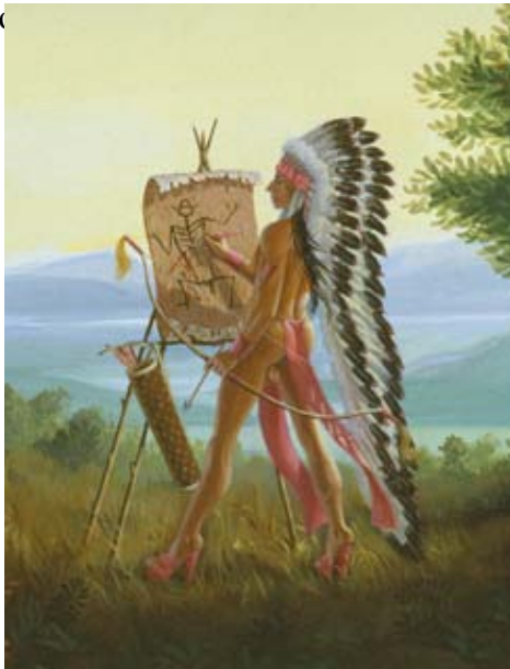
Figure 18. Miss Chief Eagle Testickle Kent Monkman. Artist as Model (detail), 2003 Acrylic on canvas, 50.8 cm x 61 cm