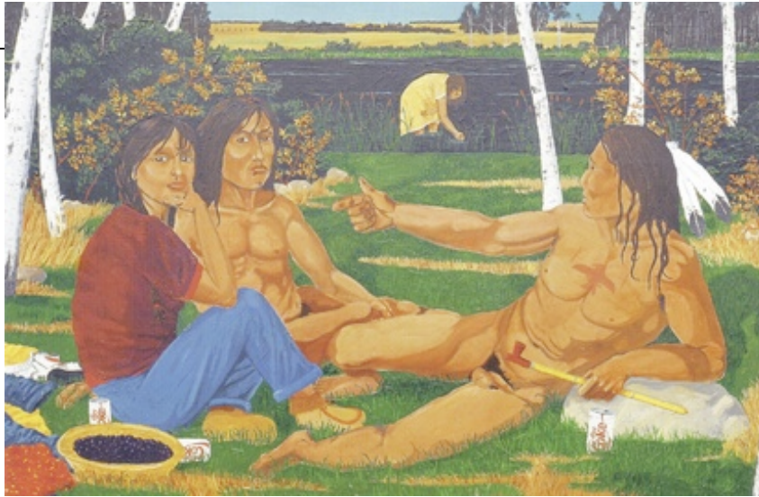
Figure 7. Jim Logan The Diners Club (No Reservation Required) , 1992 Acrylic on canvas, 89 x 135 cm