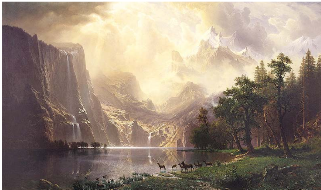
Figure 14. Albert Bierstadt. Among the Sierra Nevada , 1868 Oil on canvas, 183 x 305 cm Smithsonian American Art Museum, Washington DC.