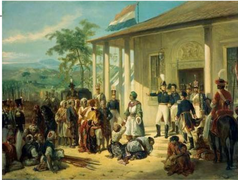
Figure 3. Nicolaas Pieneman, Subjugations of Diponegoro . 1830 Oil on canvas, 77 x 100 cm Rijksmuseum, Amsterdam