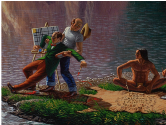
Figure 16. Piet Mondrian, Jackson Pollock, and Lone Dog. Kent Monkman. Trappers of Men (detail), 2006 Acrylic on canvas, 213.36 x 365.76 cm Montreal Museum of Fine Arts, Montreal