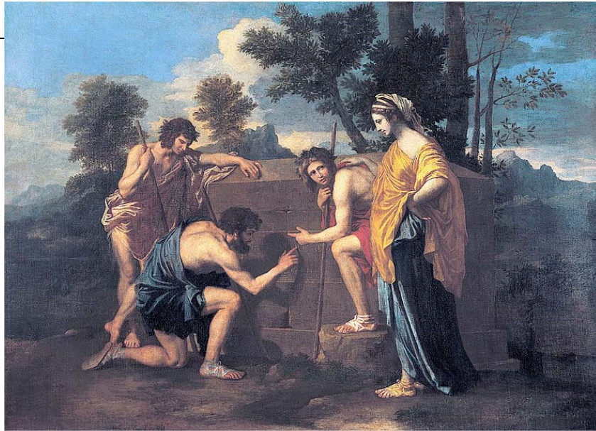
Figure 1. Nicolas Poussin, Et in Arcadia Ego , 1637-1638 Oil on Canvas 87 × 120 cm (34.3 × 47.2 in)