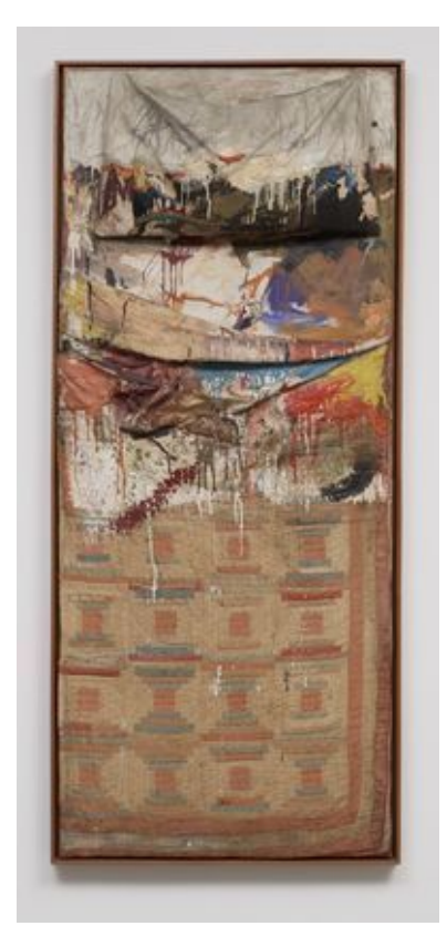
Figure 18. Robert Rauschenberg, Bed , mixed media, 1955, Oil and pencil on pillow, quilt, and sheet on wood supports, 6' 3 1/4 x 31 1/2 x 8 inches, Gift of Leo Castelli in honor of Alfred H. Barr, Jr.