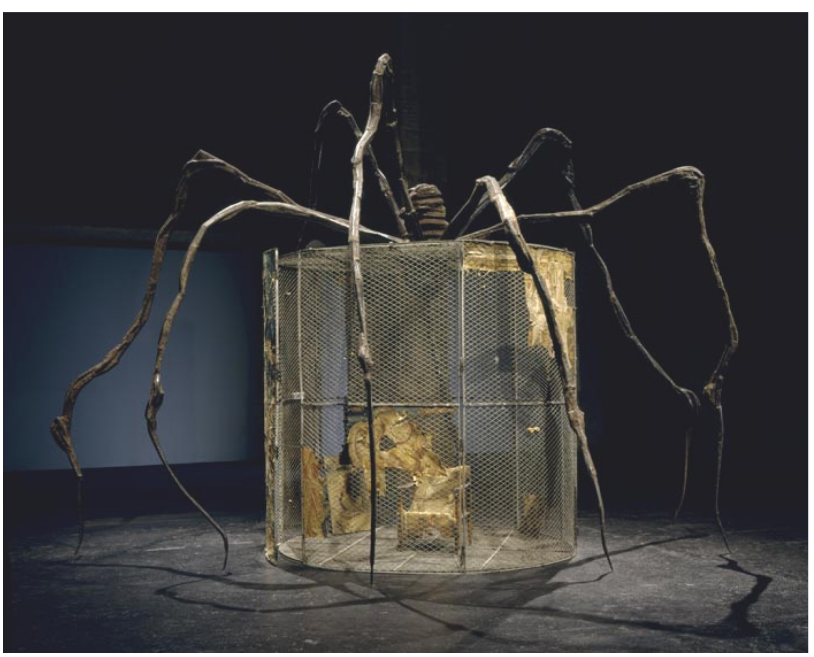
Figure 27. Louise Bourgeois, Spider , mixed media, 1997, Steel, tapestry, wood, glass, fabric, rubber, silver, gold and bone, Private collection, image courtesy Rafael Lobato and Cheim & Read, New York.