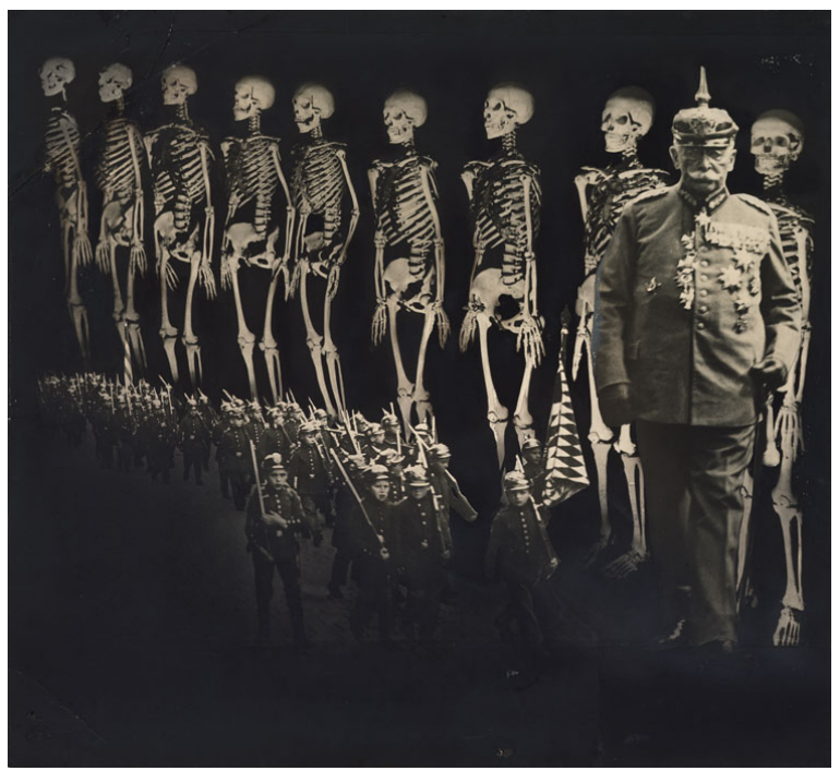
Figure 17. John Heartfield (1891–1968), Fathers and Sons , 1924 gelatin silver print of photomontage, 14.8 x 15.9 inches, Akademie der Künste, Berlin, Kunstsammlung, image courtesy National Gallery of Art, Washington, DC.