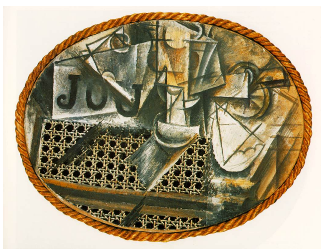
Figure 16. Picasso, "Still Life with Cane Chair", collage mixed media, 1907, 27 x 35 inches, image courtesy Musée National Picasso Paris.