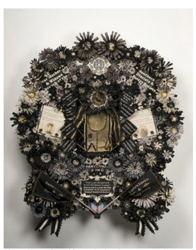
Figure 25. Dario Robleto, The Southern Diarists Society , Mixed media; Homemade paper (pulp made from brides' letters to soldiers from various wars, ink retrieved from letters, cotton), colored paper, fabric and thread from soldiers' uniforms from various wars, ribbons, lace, cartes de visite, antique buttons, excavated shrapnel and melted bullet lead from various battlefields. 2006, 45 x 37 x 6 inches, image courtesy Ansen Seale.