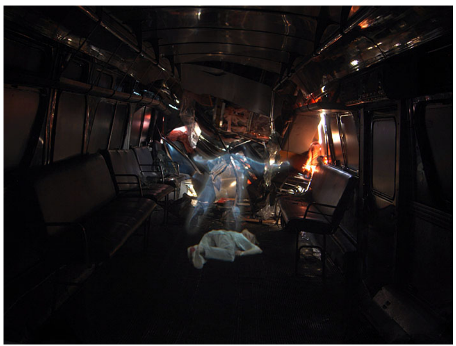
Figure 14. Carlos and Jason Sanchez Between Life and Death , 2006, view of holographic projection in crashed bus interior.