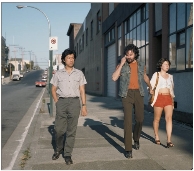
Figure 12. Jeff Wall, Mimic , Cinematographic photograph, 1982, Transparency in lightbox, 78 x 90 inches, image courtesy of the Ydessa Hendeles Art Foundation, Toronto.