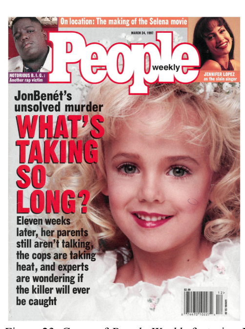
Figure 23. Cover of People Weekly featuring JonBenét Ramsey, Archived March 24, 1997.

Blanton Museum of Art, Purchase through the generosity of The Brown Foundation, the Michener Acquisitions Fund, and the Blanton Contemporary Circle, 2004.