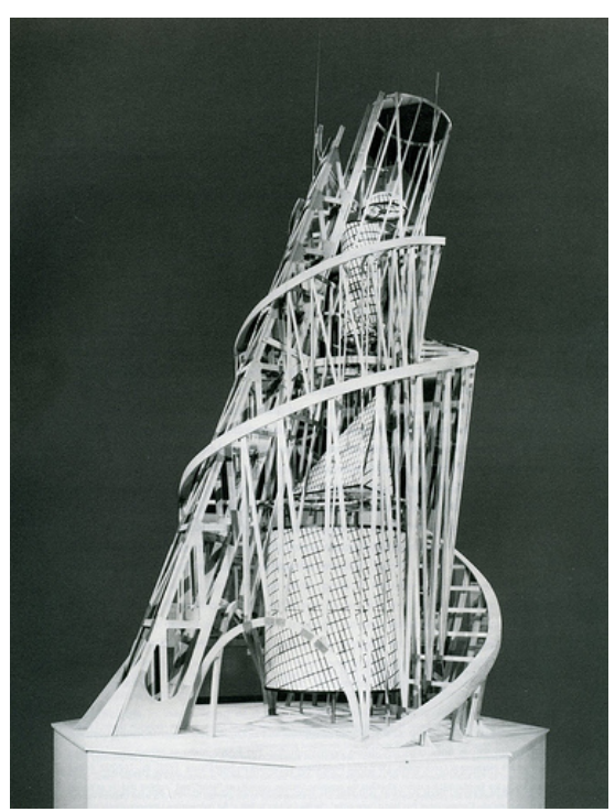
Figure 26. Vladimir Tatlin, Model for the Monument to the Third International , 1919-20, (original lost) authorized reproduction by Ulf Linde 1979, Paris, Musée National d'Art Moderne, image courtesy Centre Georges Pompidou.