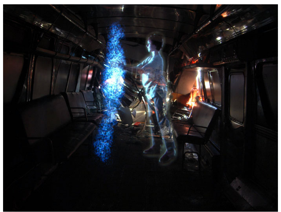
Figure 15. Carlos and Jason Sanchez Between Life and Death, 2006, view of holographic projection in crashed bus interior.