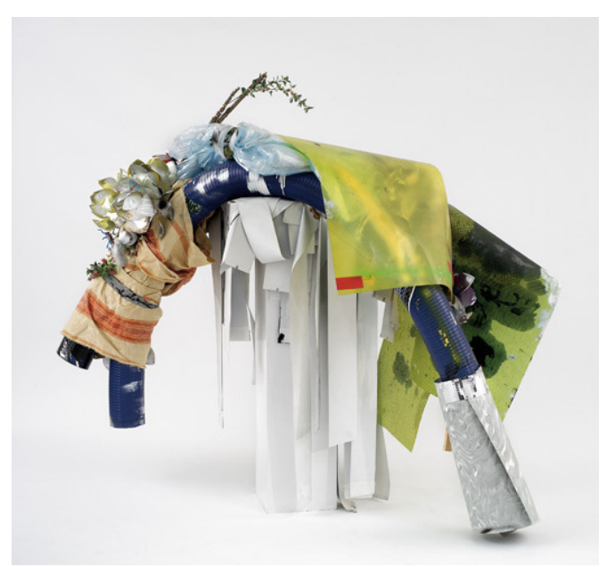
Figure 20. Isa Genzken, Elefant (detail), 2006, Wood, plastic tubes, plastic foils, vertical blinds, plastic toys, artificial flowers, fabric, bubble wrap, lacquer, and spray paint, 78 <sup>3</sup>/<sub>4</sub> x 86 <sup>1</sup>/<sub>2</sub> x 39 3/8 inches, Collection Marie and Peter Shaw, image courtesy neugerreimschneider, Berlin; Daniel Buchholz, Cologne; David Zwirner, New York.