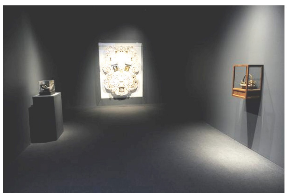
Figure 13. Dario Robleto, Exhibition view featuring No One Has a Monopoly Over Sorrow (right) encased in glass and mounted on wall, photograph courtesy Andy Cross, The Denver Post.