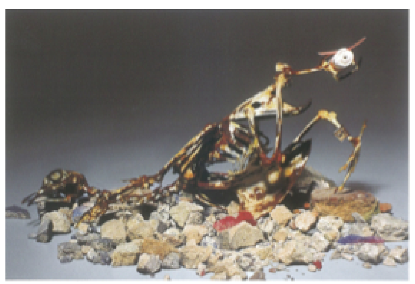
Figure 6. Dario Robleto, War Pigeon With a Message (Love Survives the Death of Cells) , Mixed media; Pigeon skeleton, WWII-era pigeon I.D. Tag, homemade paper (pulp made from human ribcage bone dust and a Civil War-era letter that a Union soldier's wife wrote to a Confederate General pleading for the release of her P.O.W. husband), WWI bullet, ribbon, rose petals, rust, dirt, rubble from the Berlin Wall. 2002, 8 x 11 x 5 ½ inches, collection of Garret Siegel, Arlington, Vermont, image courtesy of the artist.