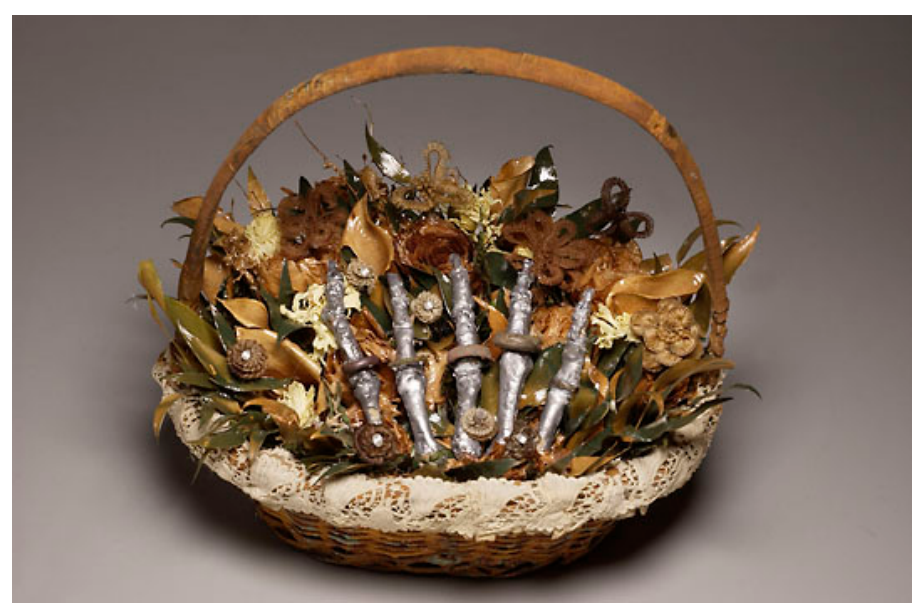
Figure 1. Dario Robleto, No One Has a Monopoly Over Sorrow , mixed media, 2007, Men's wedding ring finger bones coated in melted bullet lead from various American wars, men's wedding bands excavated from American battlefields, melted shrapnel, wax-dipped preserved bridal bouquets of roses and white calla lilies from various eras, dried chrysanthemums, male hair flowers braided by a Civil War widow, fragments from a mourning dress, cold cast brass, bronze, zinc, silver, rust, mahogany, glass. 11 x 10 x 9 inches, Collection of Julie and John Thronton, Austin, Texas, image courtesy of the artist.