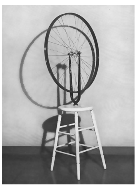
Figure 19. Marcel Duchamp, Bicycle Wheel , 1913, Reproduction of 1913 original, diameter 25.5 inches, mounted on a stool, 23.7 inches high, Private collection, image courtesy MarcelDuchamp.net.