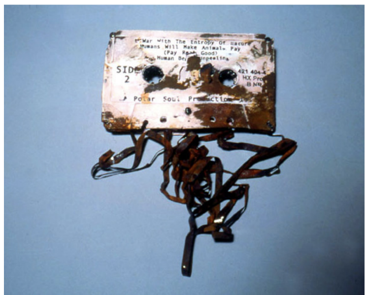
Figure 5. Dario Robleto, At War with the Entropy of Nature/Ghosts Don't Always Want to Come Back, Mixed media: Cassette; Carved bone and bone dust from every bone in the body, trinitite, metal screws, rust, typeset. Audiotape; An original composition of military drum marches, various weapon fire, and soldiers' voices from battlefields of various wars made from E.V.P. recordings (electronic voice phenomena: voices and sounds of the dead or past, detected through magnetic audiotape). 2002, 2 ½ x 3 ¾ x 5/8 inches, Collection of Julie Kinzelman and Christopher Tribble, image courtesy of the artist.