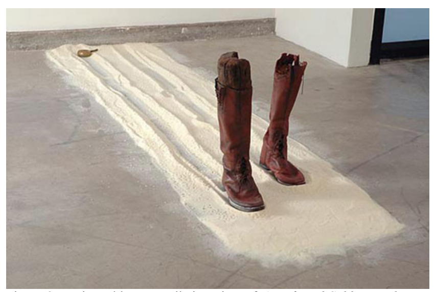
Figure 8. Dario Robleto, Installation view of A Defeated Soldier Wishes to Walk his Daughter Down the Wedding Aisle , mixed media, 2004, Cast of a hand-carved wooden and iron leg that a wounded Civil War soldier constructed for himself made from melted vinyl records of The Shirelles' "Soldier Boy" and femur bone dust, fitted inside a pair of WWI military cavalry boots made from melted vinyl records Skeeter Davis's "The End of the World," oil can filled with homemade tincture (gun oil, rose oil, bacteria cultured from the grooves of Negro prison songs and prison choir records, wormwood, goldenrod, aloe juice, resurrection plant, Apothecary's rose and bugleweed), brass, rust, dirt from various battlefields, ballistic gelatin, white rose petals, white rice. 21 x 20 x 80 inches, Los Angeles County Museum of Art, purchased with funds provided by Tina Petra, Ken Wong, and Gibson Dunn, image courtesy of the artist.