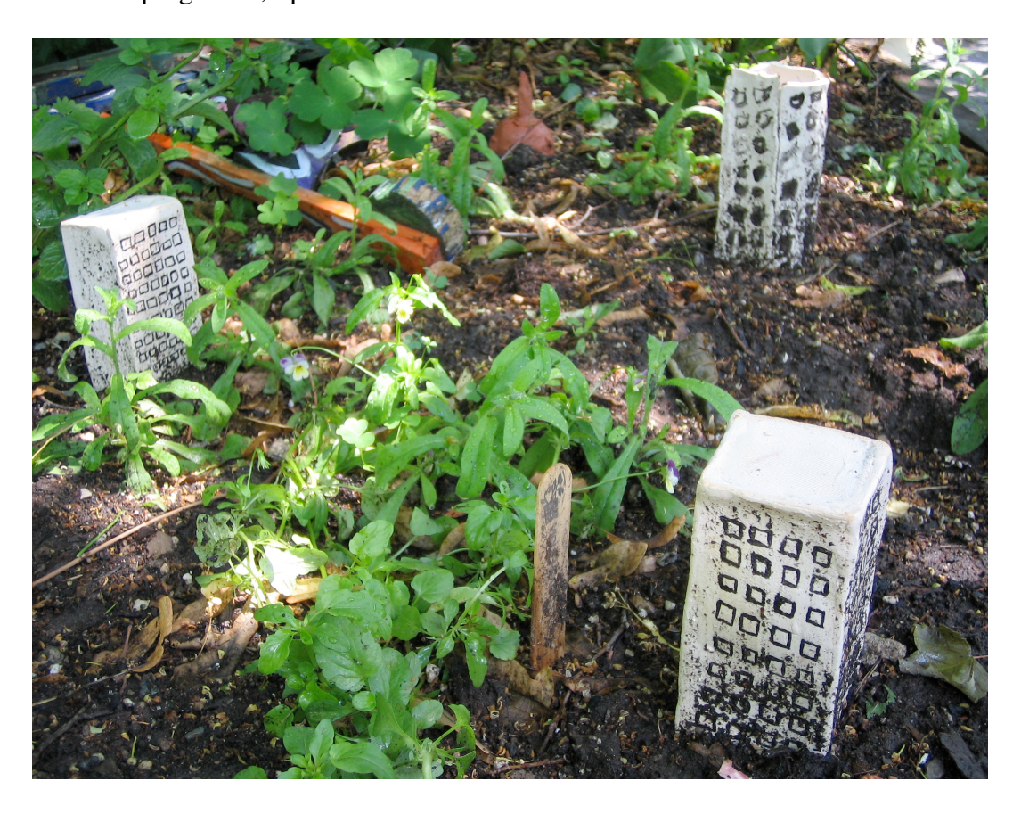
Figure 10 Condo garden at Cosmic Bird Feeder

After eleven years, in 2007, the two sites merged, and the cosmic legacy of the Bird Feeder came to an end. Situated on the old Hugh MacMillan site, the institution became Bloorview Kids Rehab, a new garden was carved out and Cosmic Bird Feeder was folded back into its progenitor, Spiral Garden.