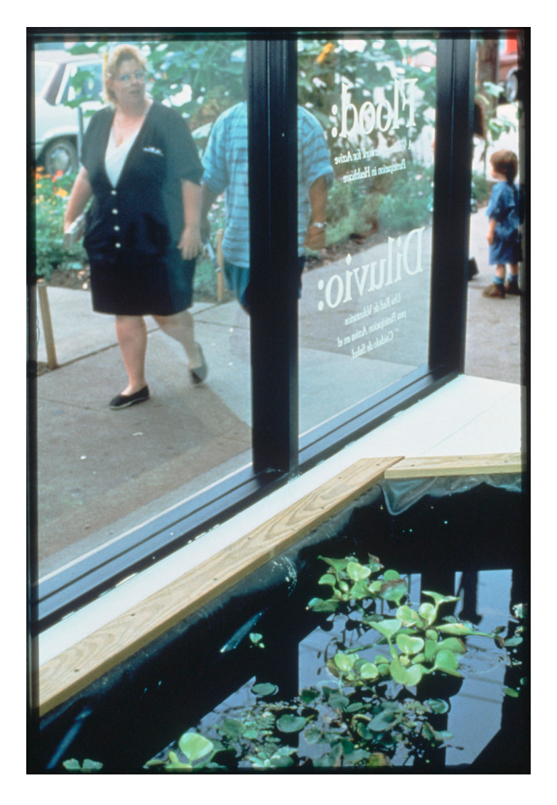
Figure 8 Intrigued passers-by

these conditions it is often much easier to fall back on pre-established patterns of behaviour, modes of interaction, and ways of working. In order to begin to imagine and create spaces of difference, time needs to be made for them, time that is not scheduled, time that allows for growth, planting and re-planting, outside of a pre-determined narrative. The advantage of this slower time, the insertion of heterogeneous time, is that it draws people together – someone needs to be present every day to care for the plants – and it allows for the project to develop laterally, making space for difference and the unpredictable.