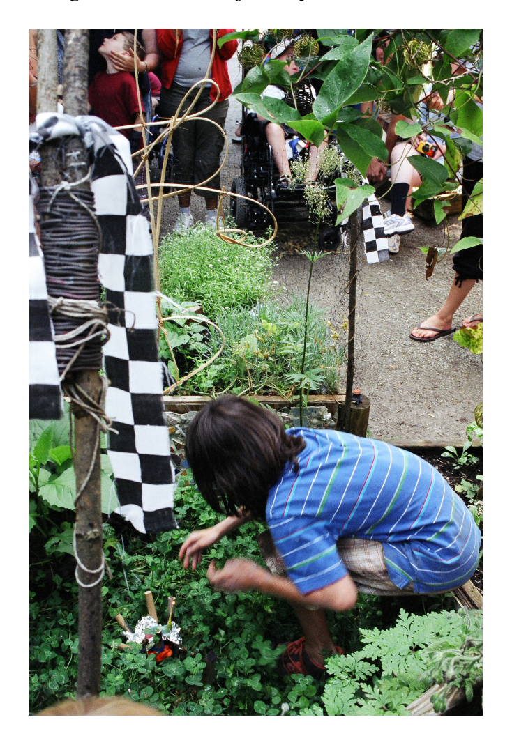
Figure 19 Child in ceremony saying goodbye to Cosmic Bird Feeder

is in the space of Spiral that love and unconditional hospitality can be used as modes of consistency for the resingularization of subjectivity.