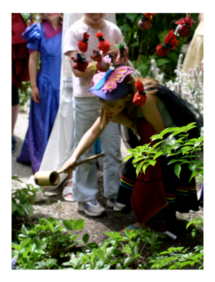
Figure 13 Ceremony to honour strawberries at Cosmic Bird Feeder