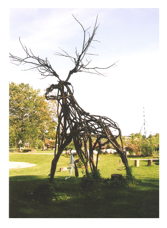
Figure 16 Tetra-uber-lope at Spiral Garden

perceptible; and the opportunity to encounter real differences in people's abilities, because there are adults to provide facilitation for the children who need it.