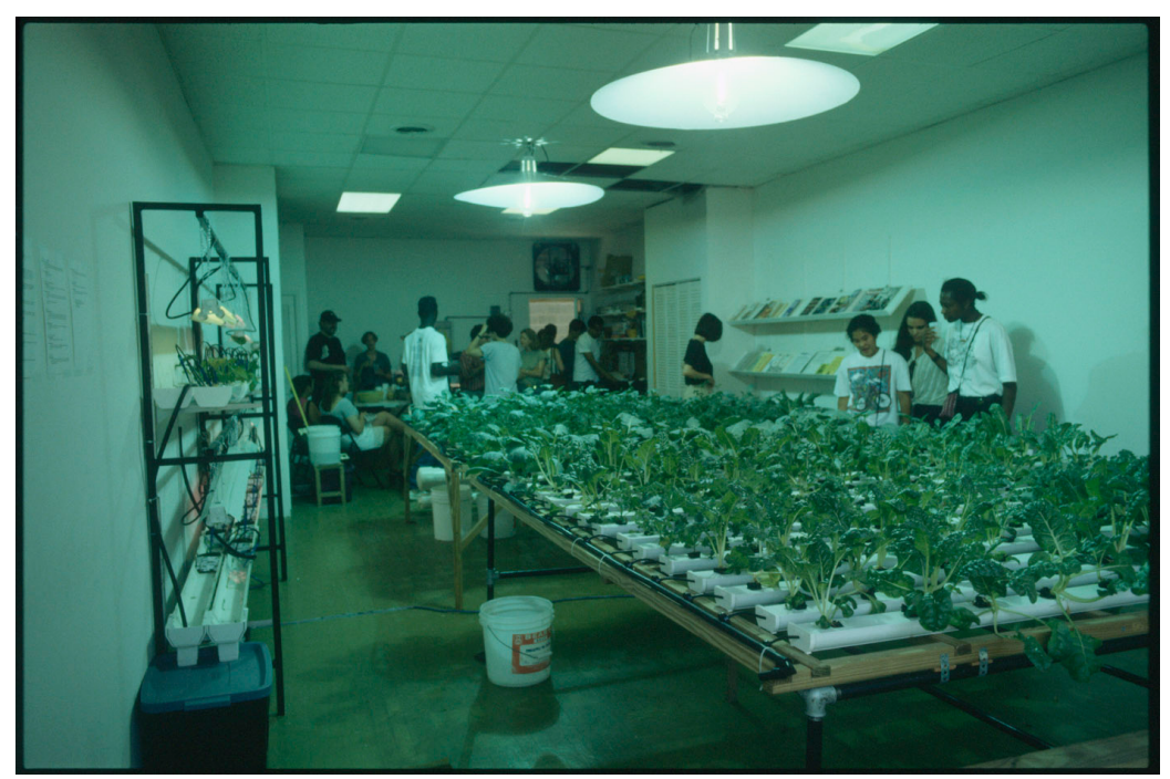
Figure 7 A day at Flood

the way in which it provided an impetus for further movement and further elaboration. This is most easily seen by they way plants were included in the expanded notion of collectivity proposed by the project, the way the plants, in a sense, produced the collective.