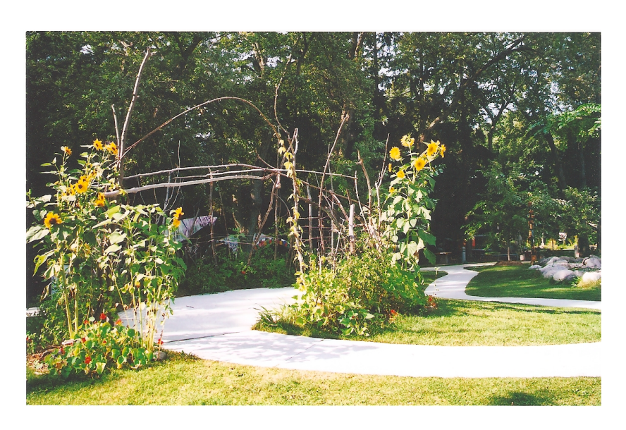
Figure 9 Photo of the new site of Spiral Garden, August 2009

it."<sup>70</sup> And stepping foot into Spiral Garden is like stepping foot into a parallel world, one inhabited by a full band of other-worldly creatures and people, each of the objects containing a story within them, or rather, multiple stories, stories written and rewritten, waiting to be written over again, held together through friendship as a structure for relation.