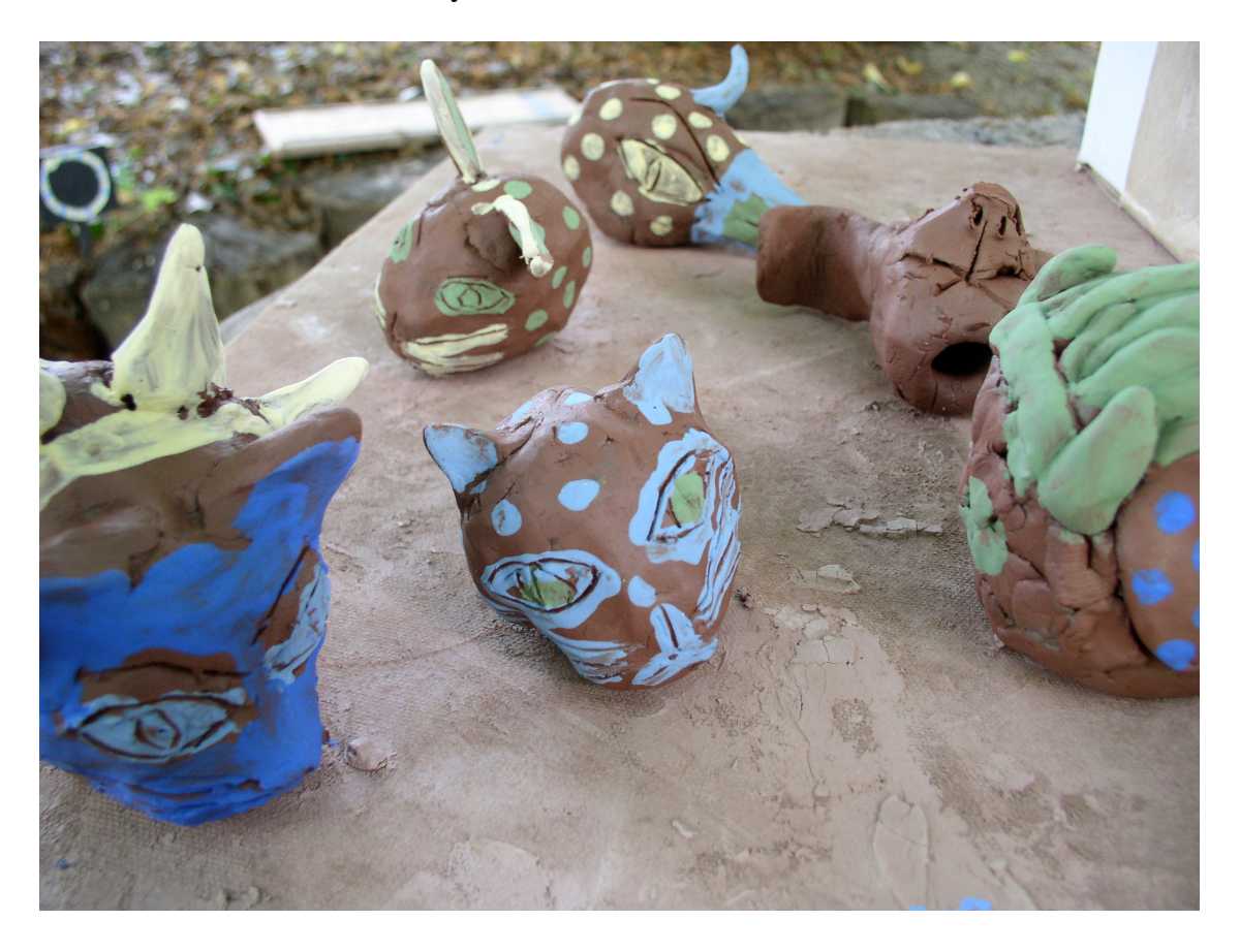
Figure 18 Puppet heads at Cosmic Birdfeeder

resentments and battles, power battles going on, everybody has to give up their power and I think their ego about their own practice."<sup>100</sup> Collaboration opens within the space of unconditional hospitality. In order to meet the other, in their difference, the self must defer, and in its place collaboration can flourish through relation. But this is not the same as repressing one's ego or giving over completely to the collective, but recognizing the in-between, more-than-one always relational character of what we call our 'selves.'