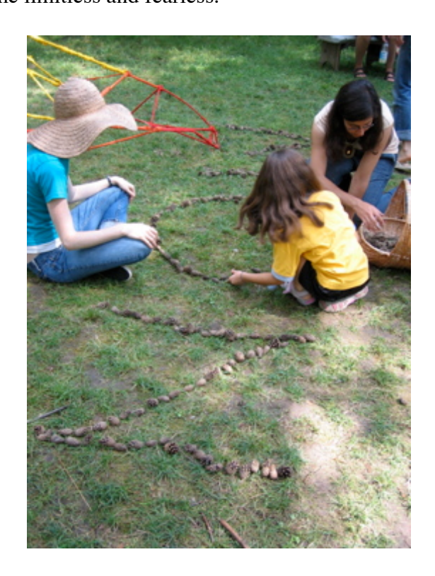
Figure 15 Counting down to now at Cosmic Bird Feeder

consistency...some stability."<sup>89</sup> It is through the passage of time together, over time, that consistency and stability are built, providing a framework from which the gardens and their activities can become limitless and fearless.