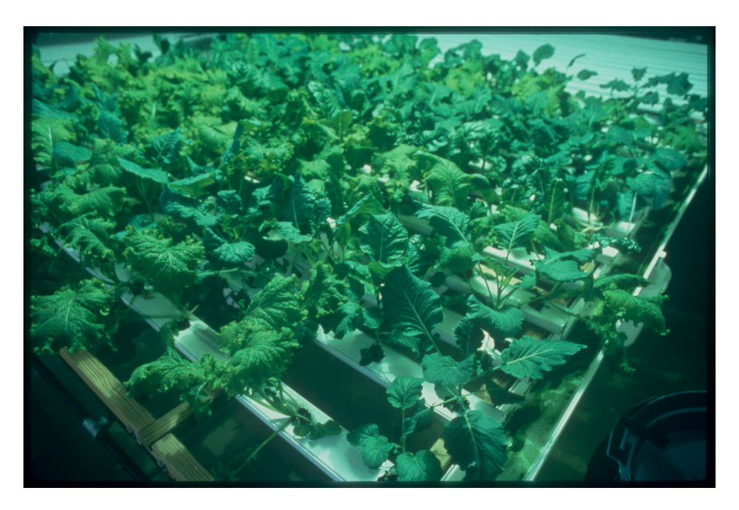
Figure 6 Hydroponic greens

collective art project, adopting "the essence of cooperatively catalyzed events [which] is to defy single narratives" (Holmes 2007, 275). It was the project's excessiveness, as an open-ended proposition, the fact of its being unfixable, that made it effective, as social intervention and as art. Palmer notes: "We could have tried to specify limited goals and outcomes in grant application style – so many school groups visited, so many video screenings, so many bags of greens delivered. But what we couldn't define or locate was Flood 's anomalous existence – not a school, not a clinic, not a store, not a factory and no one drew a salary" (Palmer 2004a, 136). Flood operated in excess of all these categories. It offered a way to think about relations differently because it could not be categorized. And its unclassifiable status made it more welcoming, both because it presented an object of curiosity, and because the project was not pre-determined, it left space for people to engage in multiple unforeseen ways. The plants, at the centre of the project, tied everything together.