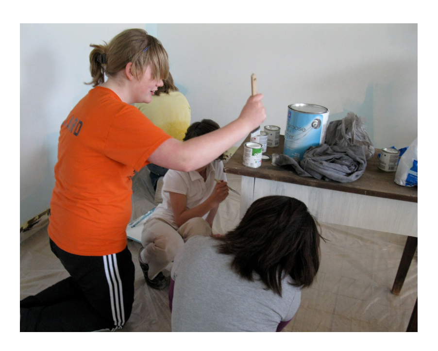
Figure 4 Youth paint tables and walls for the future teen center