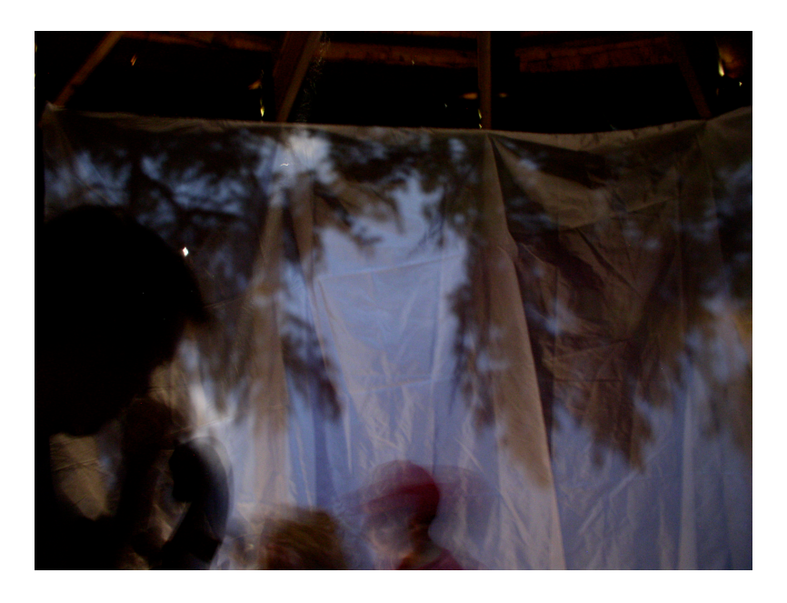
Figure 14 The world upside down and backwards: image from inside an adobe hut as camera obscura

Over at woodworking, I am asked to hang out with a child who is intently engaged in one activity: screwing. Endlessly screwing a screw into the woodworking table. Sometimes it goes in and sometimes it turns around and around without making a dent. When it goes in too far, he begins to screw it out. There is no point or goal to the movement. It is simply movement itself. There is a