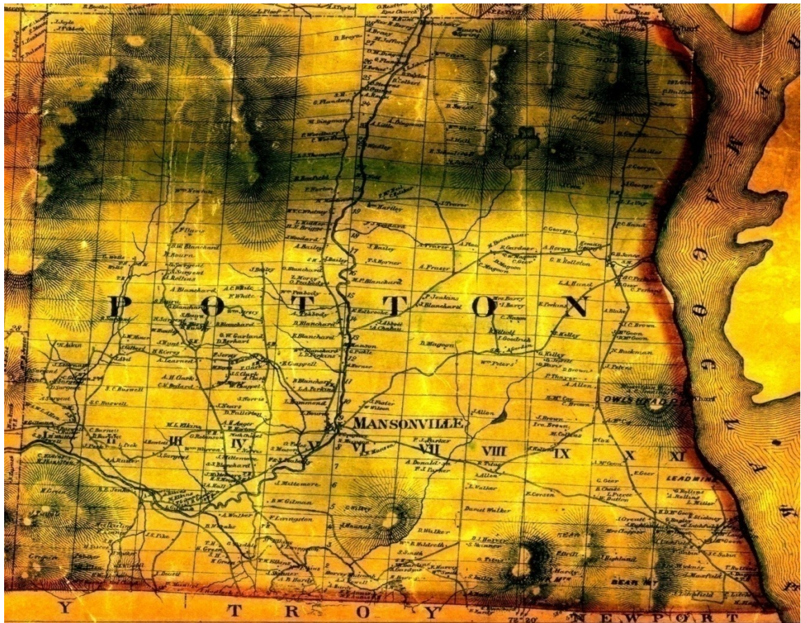
Figure 1. Map of Potton Township. 8

contours found on modern maps. 7 The mountains on eastern side of the township, Bear, Owl's Head and Sugar loaf, are 678 metres, 754 metres and 663 metres high respectively.