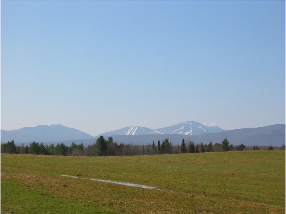
Figure 2. View of the Green Mountains from near Eliza's house.

on either side. Though not wide enough to be navigable, this river provided power for the mills that were built in the early decades of the nineteenth century by some of the first settlers in the location that later became Mansonville . 10