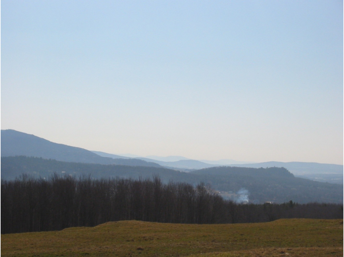
Figure 4. Looking down on Mansonville from near Eliza's house.