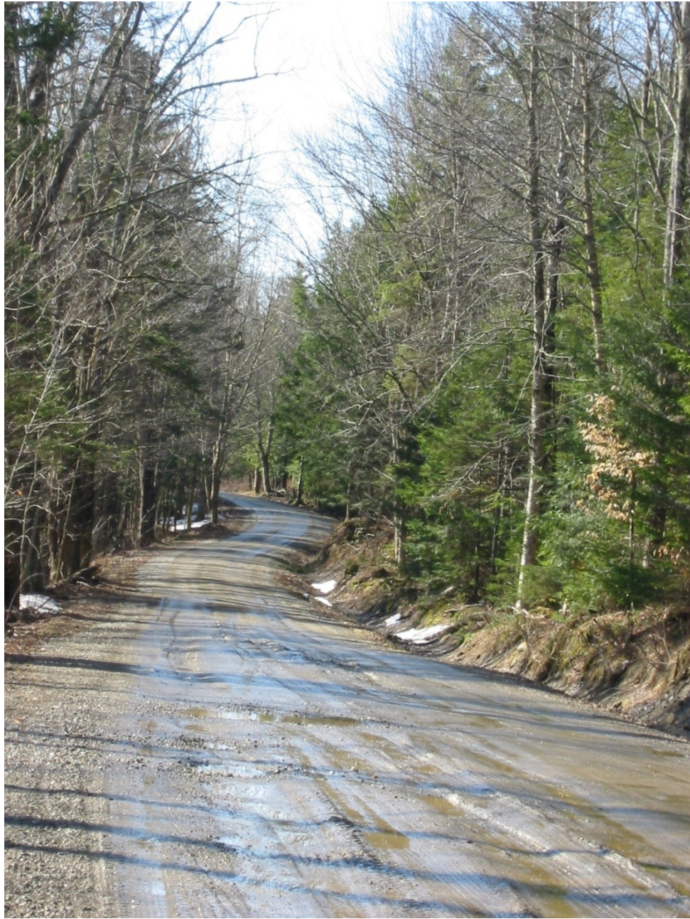
Figure 7. The road by Eliza's house, March, 2012.