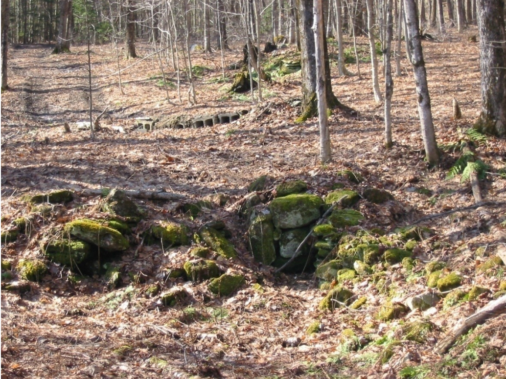
Figure 8. Remains of Eliza and Kneeland's house.