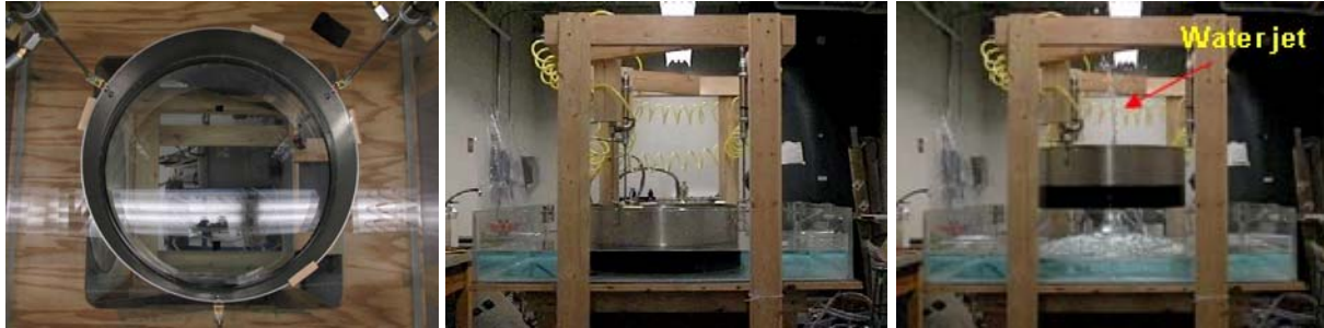
Fig. 1. Experimental setup; Left) Top view of the water table with the circular aluminum gate of radius R_o = 26 cm initially at a closed position; Middle) Side view of the water table (Dimension: 90 cm x 105 cm x 20 cm) with the gate initially at a closed position separated two volumes of water; Right) The formation of the central water jet after the extraction of the gate activated by the three pneumatic pistons.