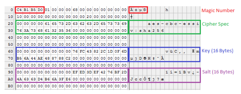
Figure 1: Android FDE footer (note that the cipher specification field is stored in clear text)