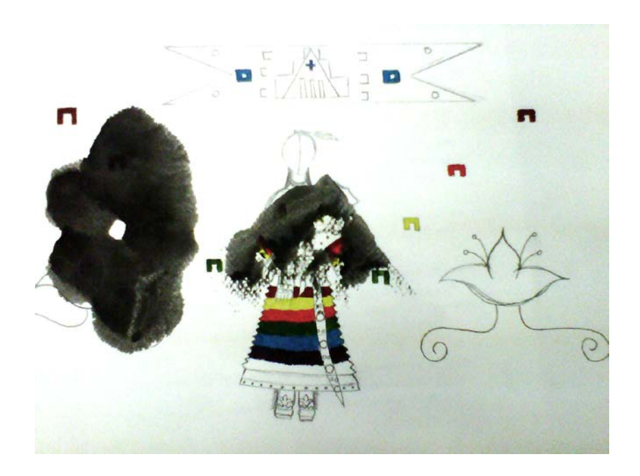
Figure 2. Traditional dancer.

I remember having that dream of that [geometric] design that was at the top of the paper so I wanted to include it in there ... I wanted this [picture] to kind of represent myself because my Indian name is "[ ___ ] Woman." So my animal, my grandpa said it was the horse, and if I was ever to bead something or make something for myself to always include something with a horse in it. And the flowers just ... represent the earth.