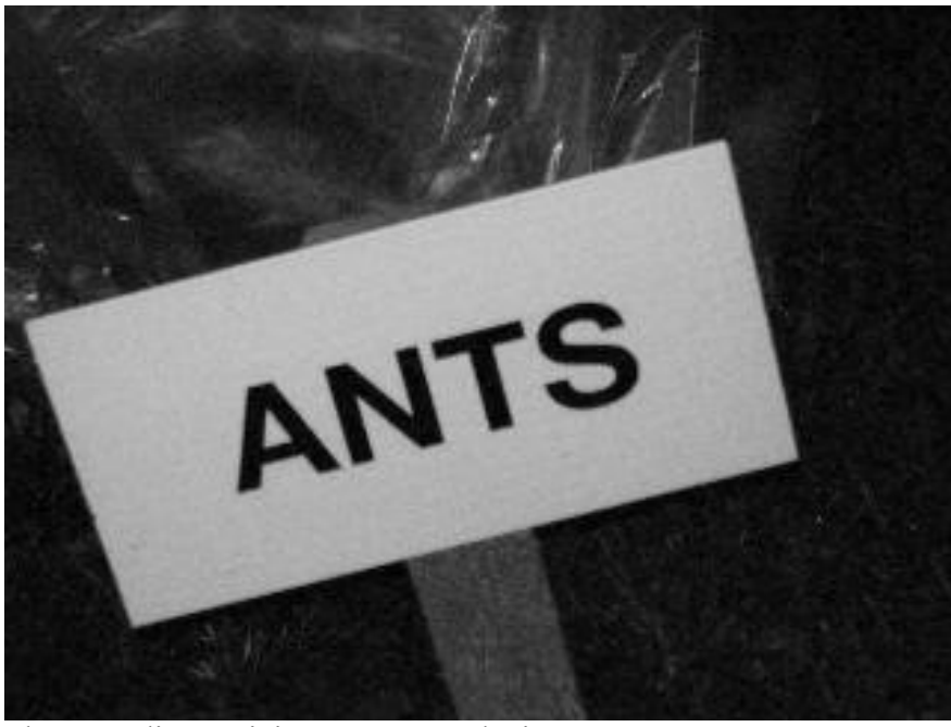
Detail of Fernandes' audio stations