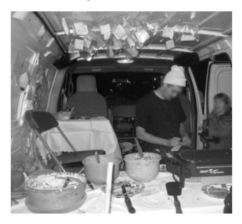
Photo credit: Participant Gail - Interior of Mobile Pancake Vehicle

Figure 13: "an exercise in giving myself and the stories we share" or "how I made you pancakes for your treasures", Noah Derek Logan. Mobile project in a van,.