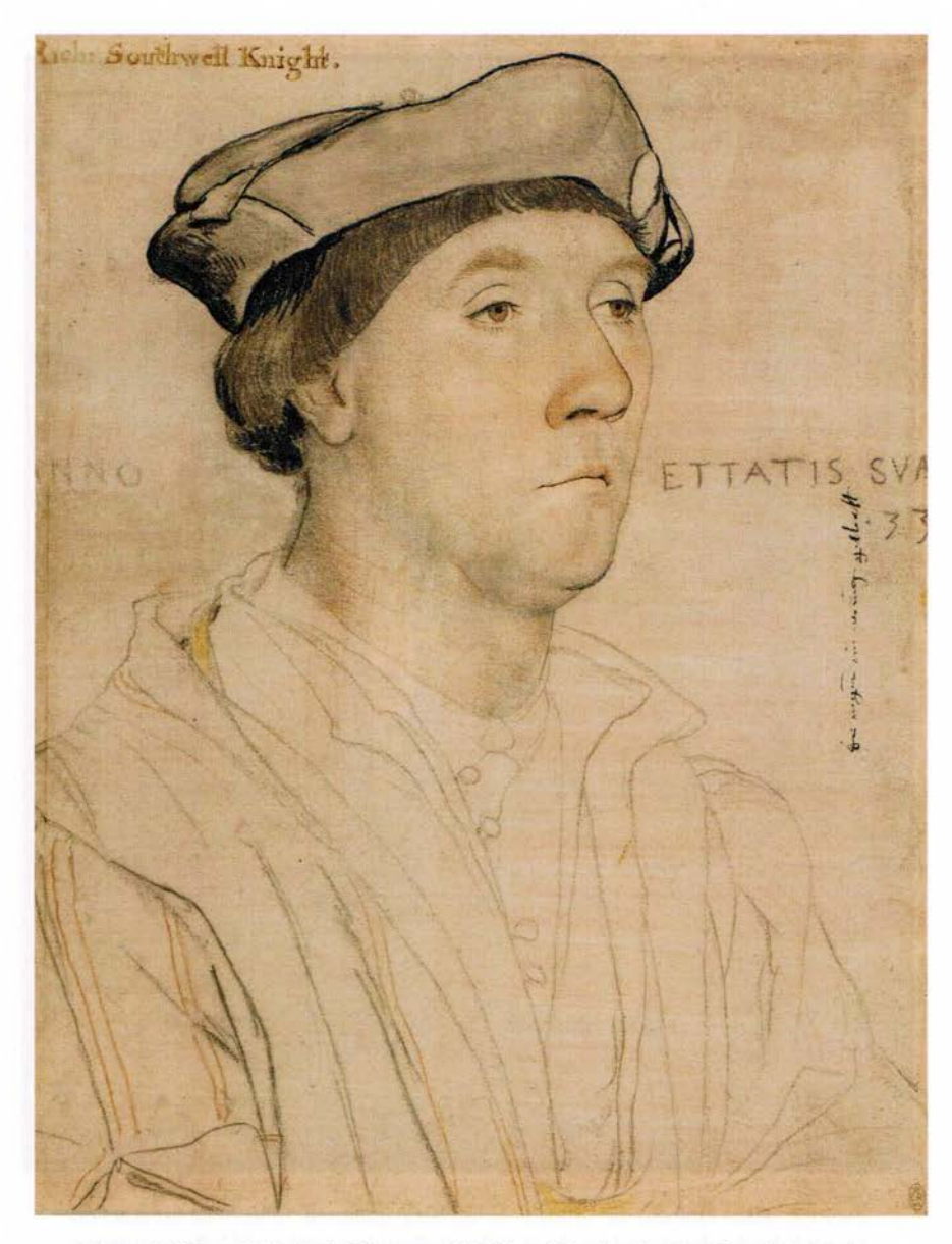
Figure 1. Hans Holbein the Younger, Sir Richard Southwell, 1536.