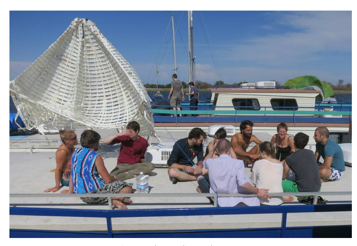
Figure 11.