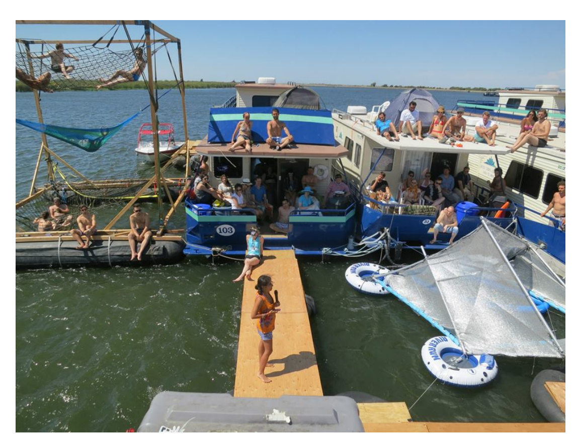
Figure 7. Memocracy speaker and audience.