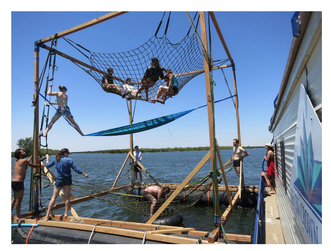
Figure 6. The cube ship, built and dismantled on site.