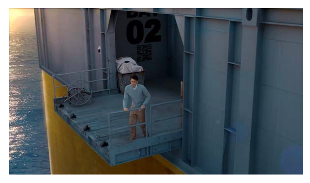
Figure 4. A character from the television series Silicon Valley (2014) castaway on a seastead.

Atkinson and Blandy suggest that the possibility to purchase a lifestyle without being weighed down with property and responsibility "exemplifies a new dimension of mobility which is accompanied by a different and complex relationship to the control of territory" (p.104). The pitch line of The World is "Travel the world without leaving home." For those who transcend political borders and financial regulations, there is less a need to own a particular fixed place since their home has become the globalized world. It is the ability to create or extract value from the world that bestows upon them a sense of ownership or of entitlement. This is illustrated in a passage in Atlas Shrugged where Dagny Taggart, the main protagonist, reflects on Hank Rearden, a successful businessman and her lover: