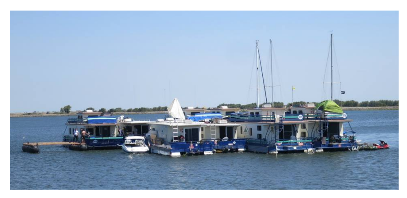
Figure 5. Arrival at Titan Island.

reading, a culinary contest, and a meditation platform, one of the most popular art work that year. Like at Burning Man, Ephemerisle participants create impressive art work.