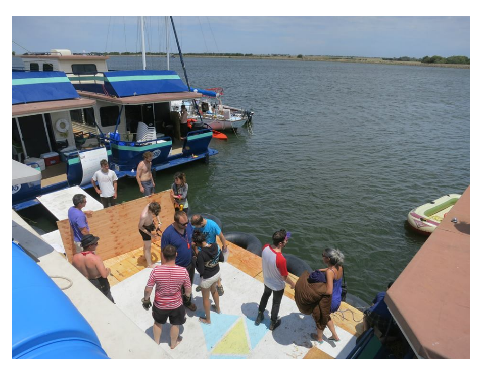
Figure 12.