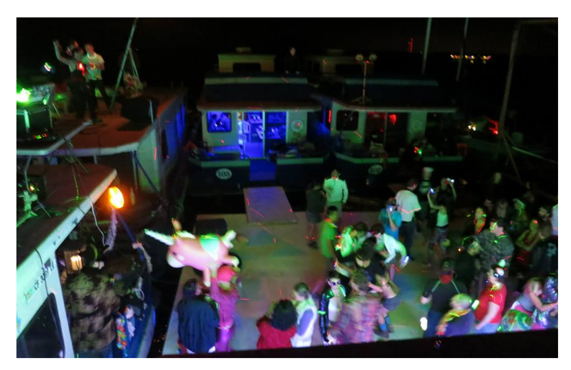
Figure 9.