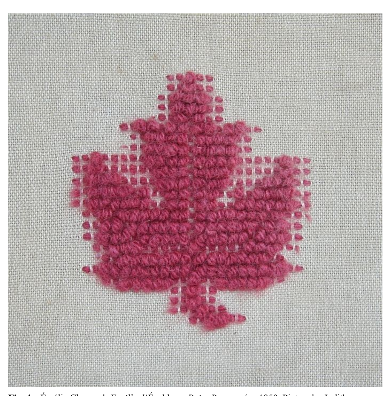
Fig. 4 – Émélie Chamard. Feuille d'Érable au Point Boutonné. c.1950. Picture by Judith Douville. Source : "Émélie Chamard, Femme D'avant-Garde." Musée de la Mémoire Vivante. Accessed July 5, 2018. http://www.virtualmuseum.ca/sgccms/histoires_de_chez_nouscommunity_memories/pm_v2.php?id=record_detail&fl=0&lg=English&ex=00000752&r d=201200#.