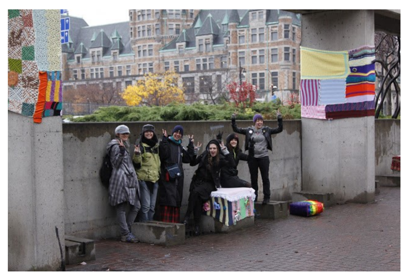
Fig. 9 – Les Ville-Laines surrounded by their yarnbombing intervention in the Agora of Viger Square. 2011. Picture by Eli Larin. Source: Tricot_pirate. "Square Viger: Mission Accomplie!" Les VILLE-LAINES, November 15, 2011. http://villelaines.blogspot.com/2011/11/square-viger-mission-accomplie.html.