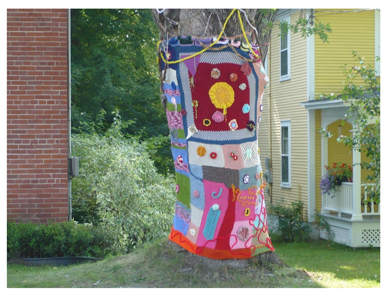
Fig. 6 – Yarnbombing in Frelighsburg for the Festiv'Art. 2012.