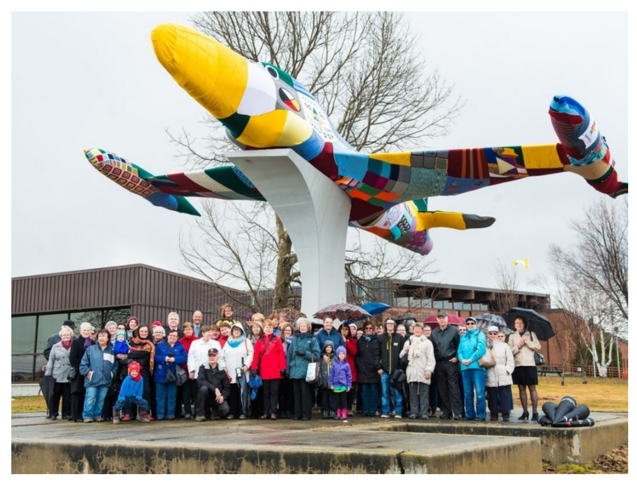
Fig. 7 – Yarnbombing by the Cercle de Fermières in Val-d'Or. 2015.