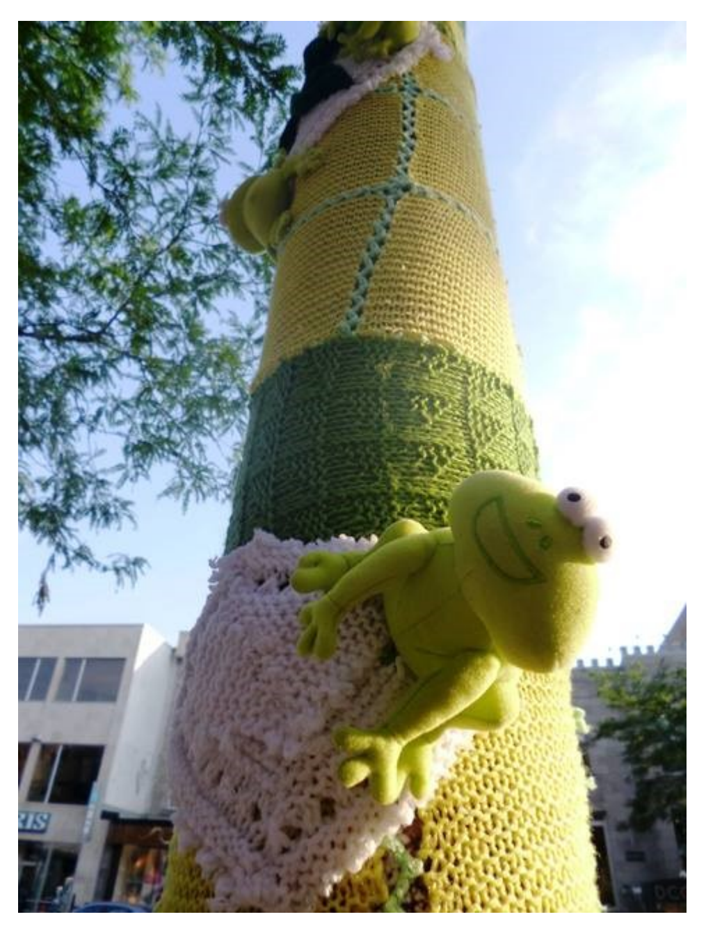
Fig. 10 – One of the 50 lampposts intervened on by Les Ville-Laines for SDC Pignons rue Saint-Denis. 2013.