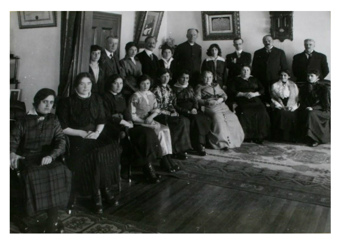
Fig. 1 – Picture of one of the first Cercles, in Roberval. 1915.