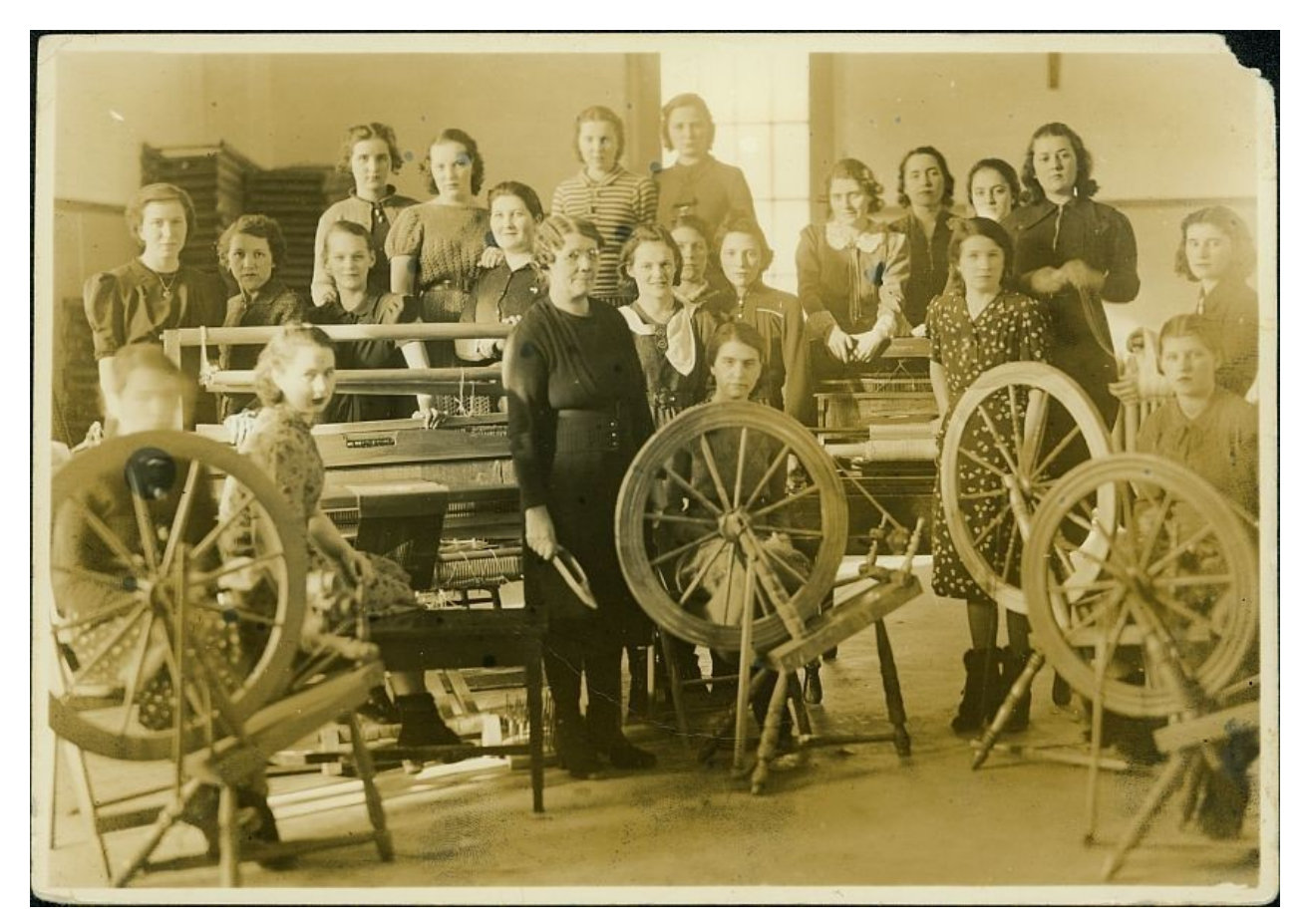
Fig. 3 – Cours de Filage à Kénogami. c.1937. Picture by Studio L. Charpentier. Source: "Émélie Chamard, Femme D'avant-Garde." Musée de la Mémoire Vivante. Accessed July 30, 2018. http://www.virtualmuseum.ca/sgc-cms/histoires_de_chez_nouscommunity_memories/pm_v2.php?id=record_detail&fl=0&lg=English&ex=00000752&r d=201241#.