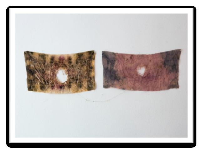
Figure 1 You Are My Best Friend