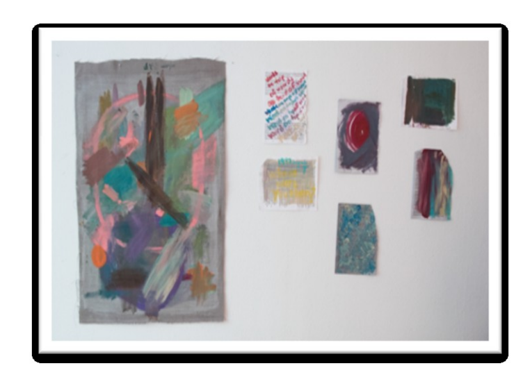
Figure 2 Where Were You?

The first response seen in Figure 1 , titled "You Are My Best Friend," shows an overarching feeling of longing, fragility, pain, love, tenderness and a yearning to connect. The work highlighted the separation and the yearning for closeness, demonstrated through the use of the fragile thread connecting the two images. This response work unfolded slowly, from choosing the fabric to steaming the natural plant matter and dyes into it, then allowing the bleach to eat away at each fabric simultaneously. This work highlights the negative state of arousal which Bowlby's (1982) discussed as a state of arousal which the child experience due to the separation (Levy & Orlans, 2014).