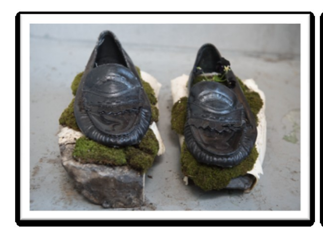
Figure 6 Synthesized Response Art

These works therefore served the purpose of concluding the research while also serving as a personal means to celebrate his life and acknowledge his passing. These emotions were most clearly identified in Figure 6 . The piece showcased the shoes as symbols for his soul, hence why they were suspended in a location that had been visited to commemorate his death. There are theories concerning bereavement, one of which entails fluctuating between "orientation to the loss" and a "restoration of contact with a changed world" (Weiskittle & Gramling, 2018, p. 10). Though I recognized that his passing would be present in the work, I underestimated all the elements which needed to be grieved, and the art brought me back to engage in a more in-depth manner with the grief.