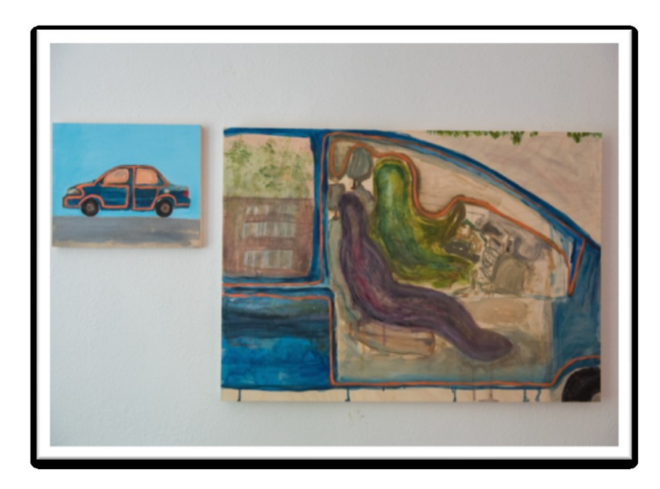
Figure 5 You and Me

The final response work, titled "You and Me," represents the car that I inherited upon my father's death. This was commemorated in two paintings, providing a vision of shared space and the relationship. This work showcased beauty within the messiness, intimacy, grief, pride and protection. During the process of this response work, feelings of deep morning arose to the surface. While creating the paintings, I went through a process of putting a brush stroke on the canvas, wiping it away and then doing it over again. As if going through a process of doing and undoing, it symbolized a sense of working through the emotions or process.