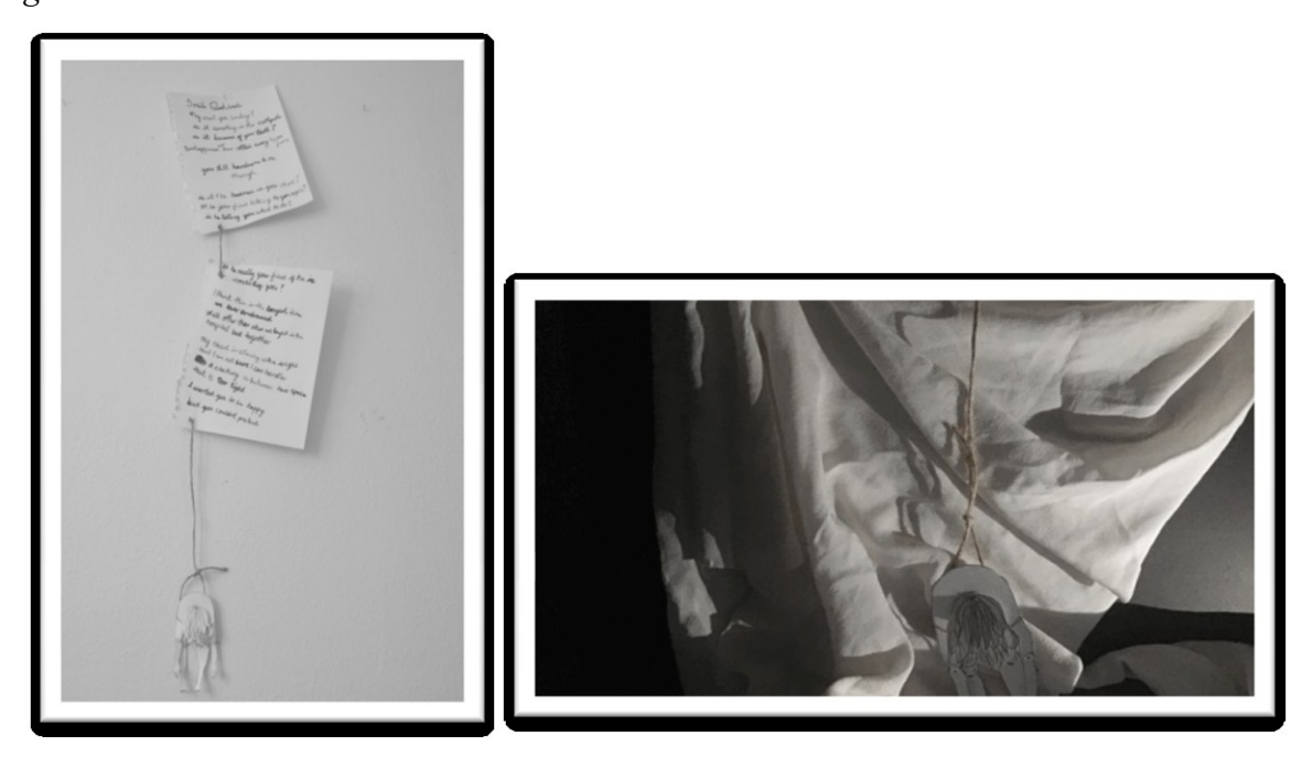
Figure 3 Weighted Smile

The third response, titled "Weighted Smile", begins with a poem showcasing feelings of uncertainty, questioning, caring and concern. However, the stop motion and the three-dimensional figure in the artwork elicits feelings of powerlessness and despair. This response work was the most challenging of all, as I needed more time to emotionally process my feelings before moving forward. This provided an internal point of contention, as I struggled as a re-