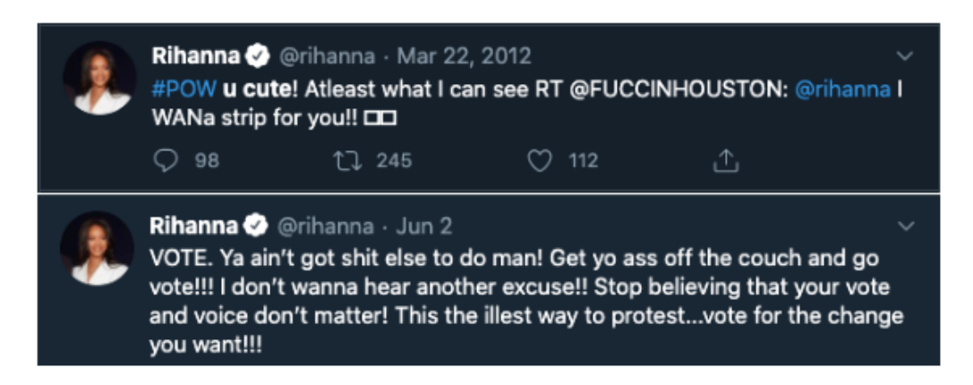
Figure 5. Examples of Rihanna's speaking style on Twitter.

The discursive presentation strategy presented relies heavily on the strong brand voice. The brand voice mirroring Rihanna's voice online is largely due to her own embodiment of source of authority bridging. As previously stated, her positioning as both a sex symbol and champion of inclusivity was important for the brand's efforts to bridge both the Bombshell and the Body Positive ideo-typical brands. Rihanna herself covers the bridge between celebrity and activist. By