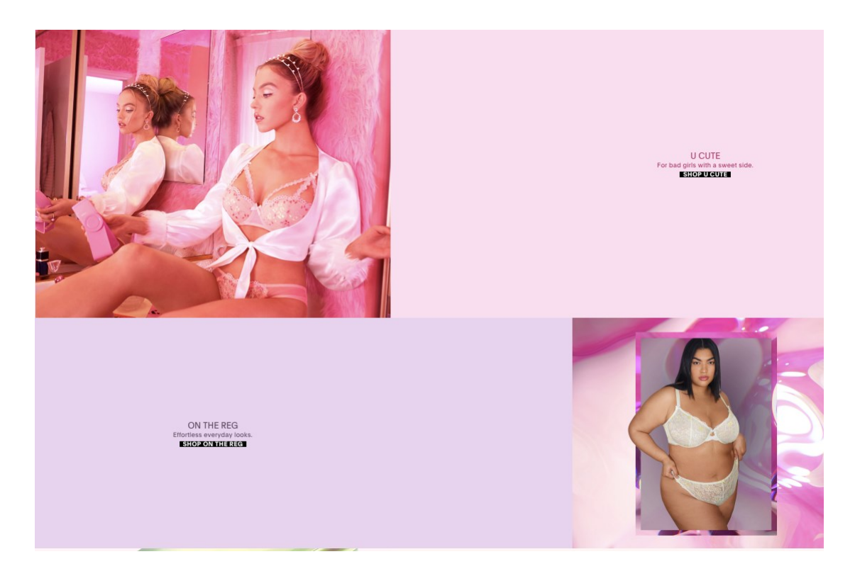
Figure 4. Personas listed on the Savage X Fenty website.