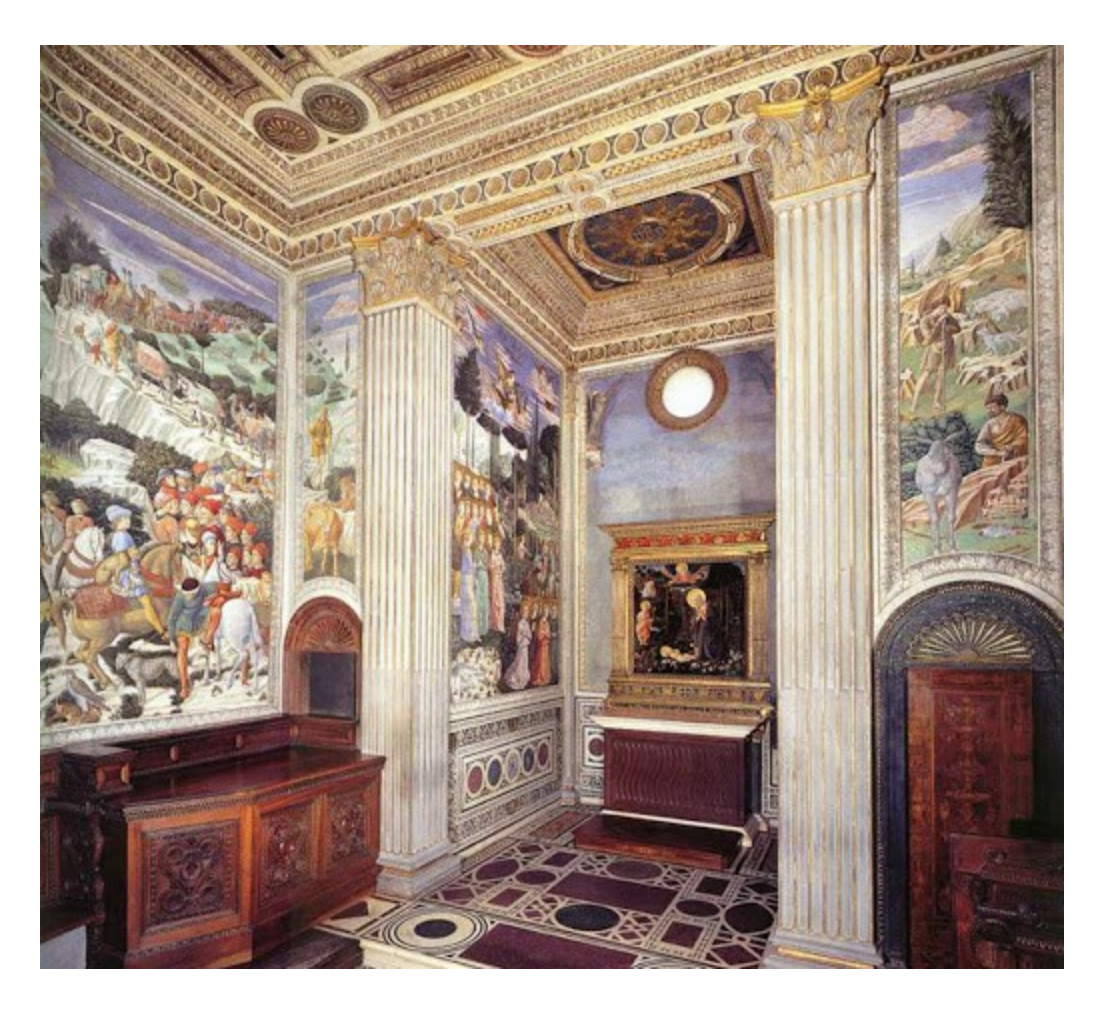
4 Michelozzo di Bartolomeo, chapel with frescoes by Benozzo Gozzoli, Palazzo Medici Riccardi, Florence