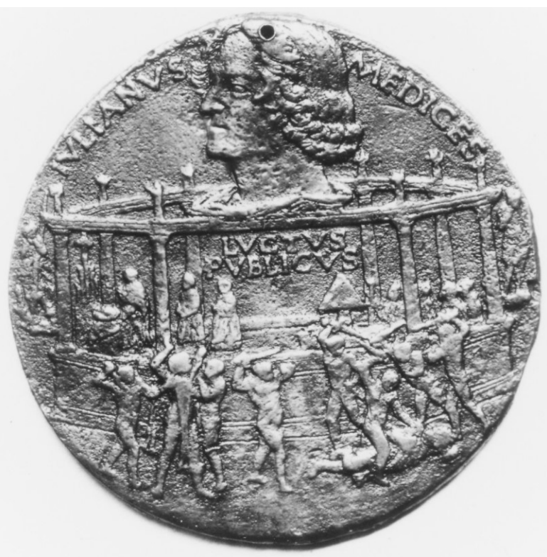
1 Bertoldo di Giovanni, To Commemorate the Pazzi Conspiracy, 1478 (Pazzi Conspiracy Medals ), Diameter: 2 1/2 in. (6.4 cm), Bronze, 1478; Florence, Italy, The Metropolitan Museum of Art, New York