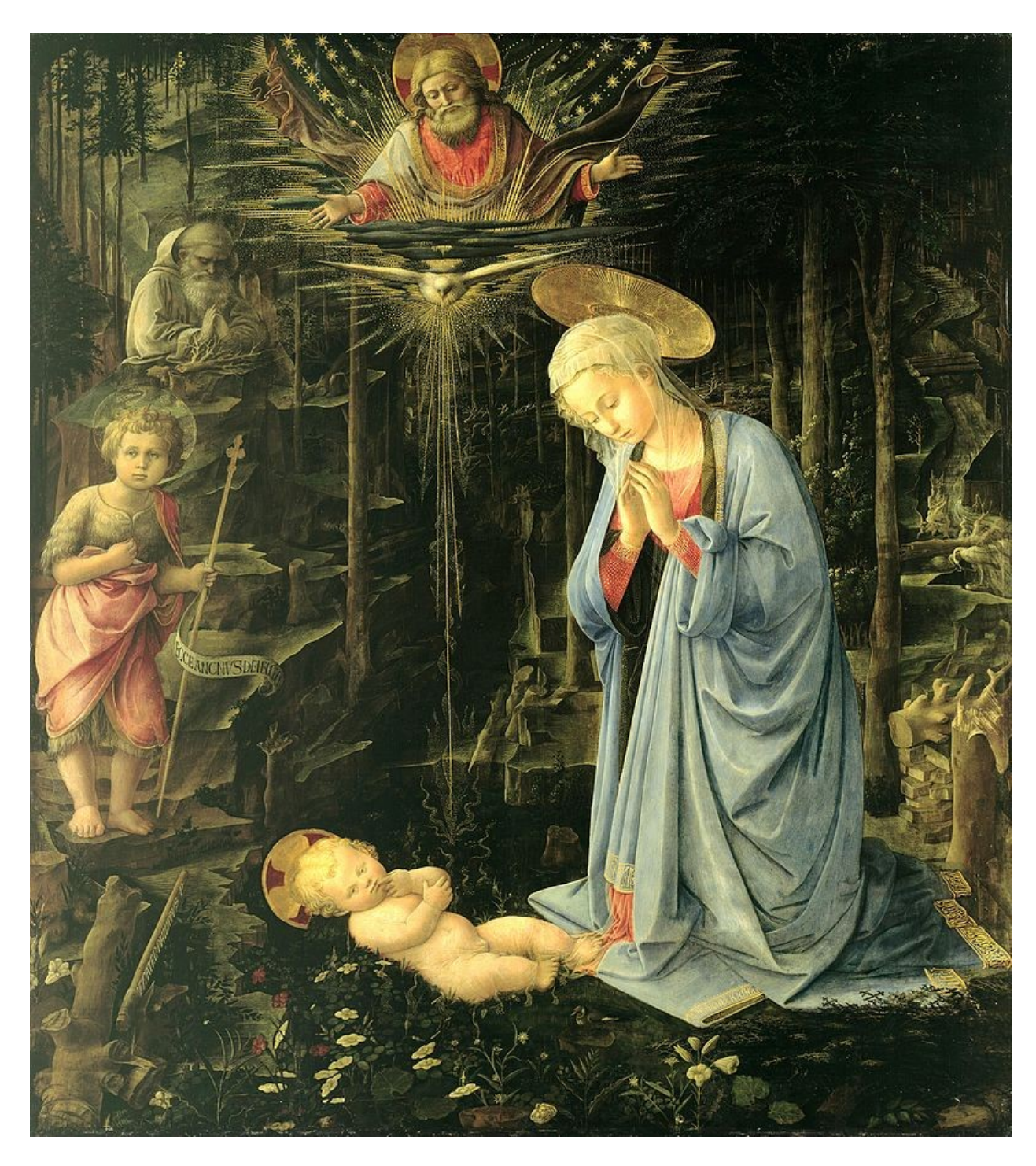
Fra Filippo Lippi, The Virgin Adoring the Christ Child in the Wilderness with Saints John the Baptist and Romuald (Palazzo Medici Adoration ), 129.5 x 118 cm, egg tempera with oil glazes and gold on poplar, c. 1457, Gemaldegalerie, Staatliche Museen, Berlin