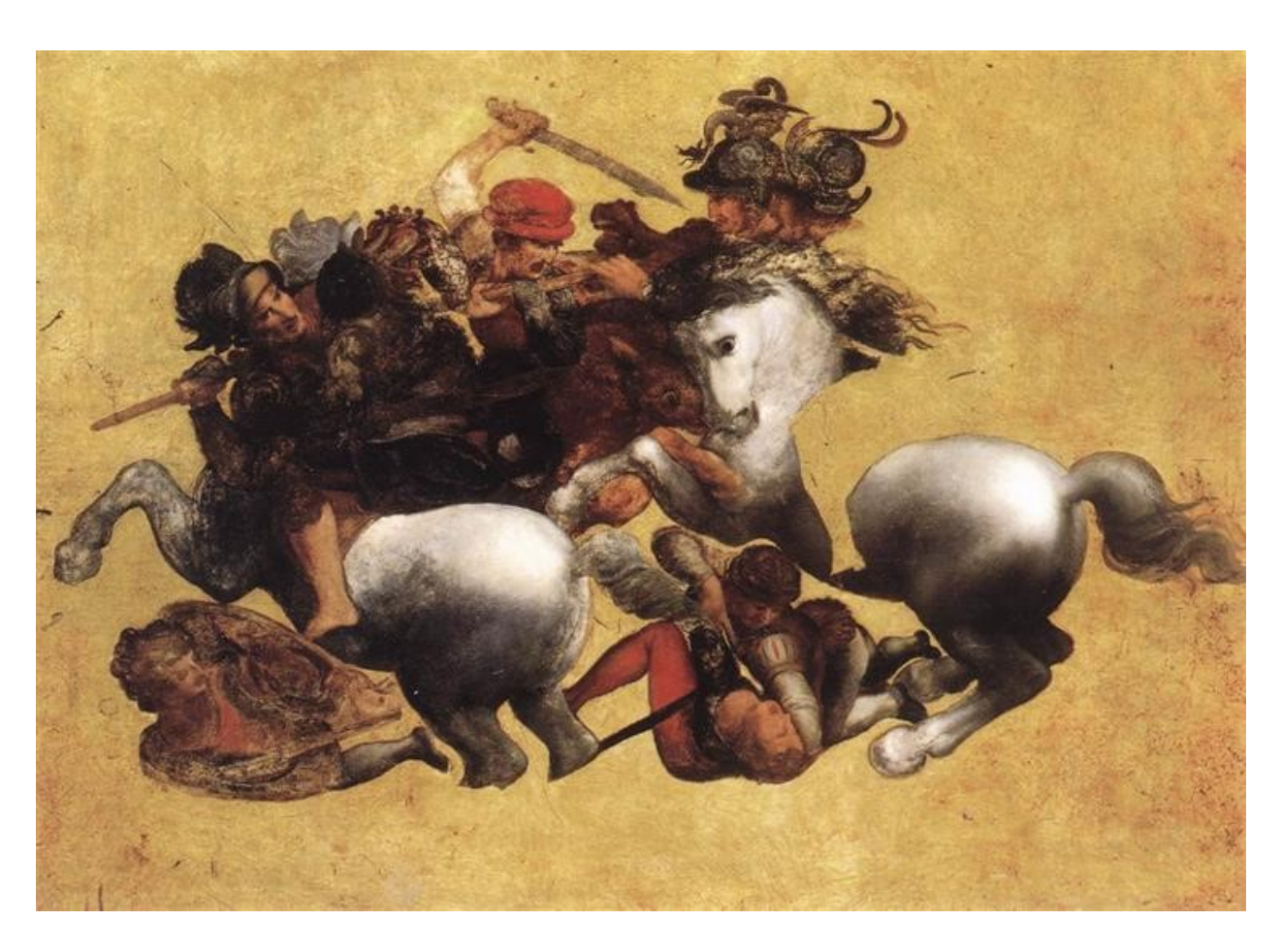
3 Leonardo Da Vinci, Lotta per lo stendardo (from the Battle of Anghiari ), 85 x 115 cm, oil, panel, c.1503 - c.1505; Florence, Italy, Uffizi Gallery, Florence, Italy