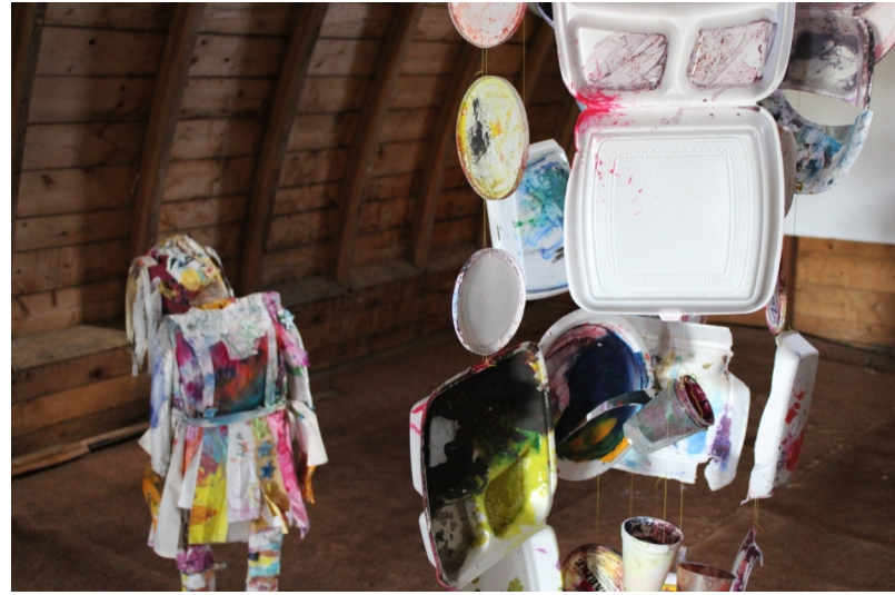
Picture, Plastic, Perfect Installation views 2020