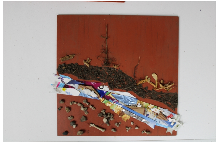
Geological Cross-section I Post-consumer debris, cardboard, Stryfoam, cardboard, tin foil, dirt, plants, rocks on tile 12 x 12" 2019 (left: detail)