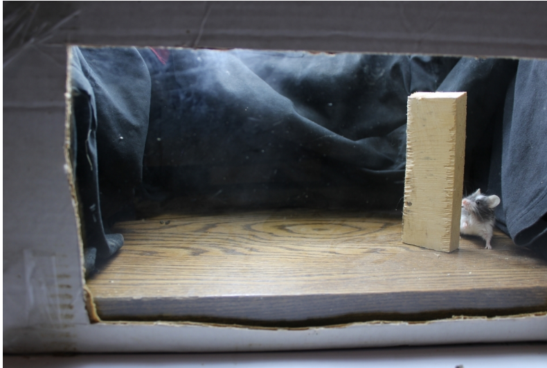
Mouse Performance (Robert Morris revisited), Still from video, 2020