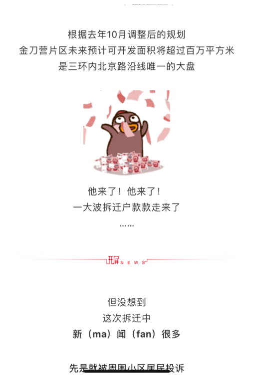
Figure 3. 7 A screenshot of a piece of WeChat news from The Kaiping News .

top topics on social media ( The Kaiping News ), and about adopting a softer tone than the party newspaper ( The Yunnan Daily ). All these strategies and techniques eventually gave birth to a particular style of WeChat news that differed from the traditional newspaper style. In an effort to appeal to internet users, editors added internet-specific elements (expressions, memes, emoji, etc.) to news reports. However, soft stories are more likely to adopt this style.