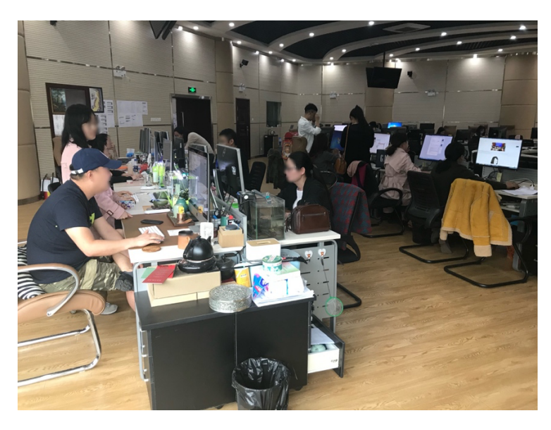
Figure 3.6 The online team of The Yunnan Daily . 27

The morning-shift editors had finished their work and were about to leave.