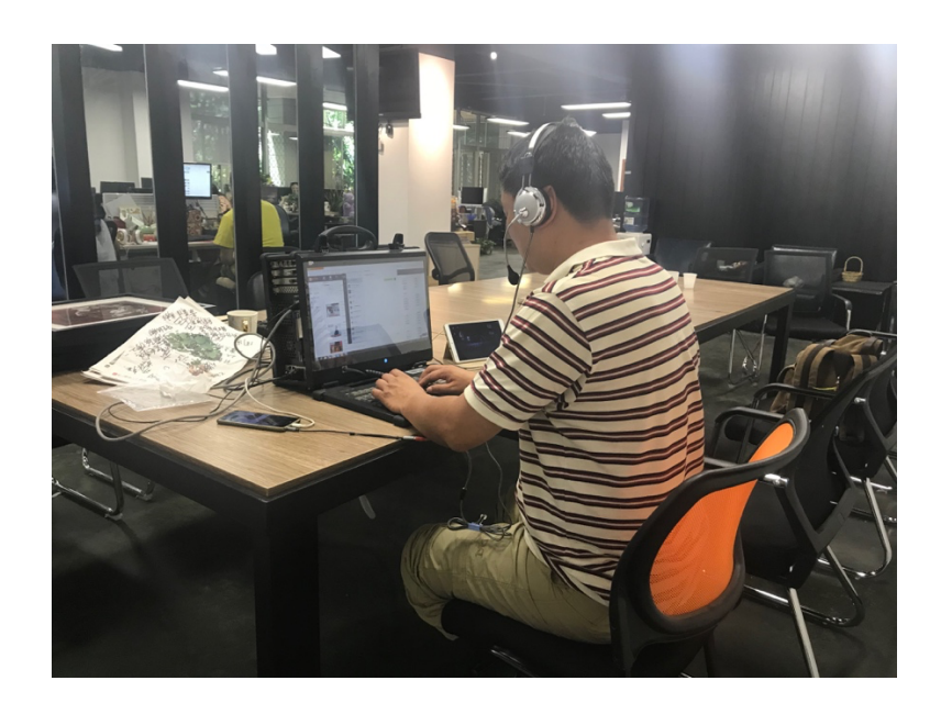
Figure 4.11 A journalist coordinates with his team on site during a live stream.

This photo shows a video journalist at The Kaiping News coordinating with his team during a live stream. In the absence of a permanent workstation, he sets up all the necessary equipment at the conference table of the newsroom. The black box behind the screen is the key equipment needed to receive the signal and transmit it online. He is using the laptop to control transmission, while communicating with his team over the phone and monitoring the live broadcast on his iPad.