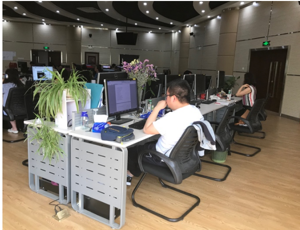
Figure 3.4 The main office of the newsroom on the first floor