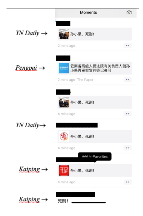
Figure 3.1 WeChat posts by journalists from three newsrooms about a breaking event.