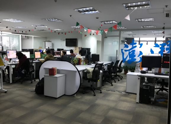
Figure 3.2 Visual Center – Pengpai