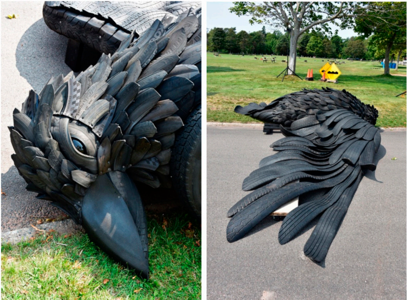
Figure 5. Where the Rubber Hits the Road, 2018, Gerard Beaulieu, in Charlottetown, PEI, Canada (Source: http://www.watchforwildlife.ca/blog/roadkilledcrows-gbeaulieusactivistart-bywandabaxter?fbclid=IwAR3NAjH1BMY625U3js3Z00JchjEmjo14slr7HQIXXwMbelGZMtDXk1Hd218 , accessed on 10 November 2020).

Canada, is by Gerard Beaulieu. This 2018 eco-art installation was placed halfway between the road and a public park and depicts a dead crow. It is intended to educate passers-by of the impact of collisions between wildlife and vehicles. Much literature surrounding roadkill has focused on human deaths [50]. However, more recently, research has started to be dedicated to the loss of biodiversity from roadkill [51]. Beaulieu's work is concerned with the latter, placing a very large sculpture of a dead wild crow on the road.