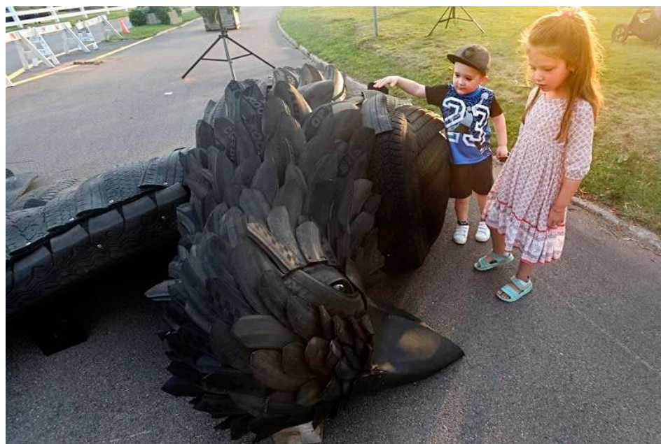
Figure 6. Where the Rubber Hits the Road, 2018, Gerard Beaulieu, in Charlottetown, PEI, Canada (Source: http://www.watchforwildlife.ca/blog/roadkilledcrows-gbeaulieusactivistart-bywandabaxter?fbclid=IwAR3NAjH1BMY625U3js3Z00JchjEmjo14sIr7HQIXXwMbelGZMtDXk1Hd218 , accessed on 10 November 2020).

The intended eco-lesson is clear—the large crow on the road aims to explain that roadkill is a result of the pervasive human habit of car use. This eco-installation is didactic, as it not only has a moralizing connotation but is delivered in an extremely simple and clear manner. Breaking the work down into didactic components, an unmistakable teacher-subject-student trilogy appears (Figure 6): (1) the teacher delivering the eco-lesson is the actual eco-art installation; (2) the subject that is being taught is the eco-lesson about roadkill, clearly conveyed through the form of the sculpture; and (3) the student is characterized by the spectators observing the work's materiality, scale, weight, and darkness.