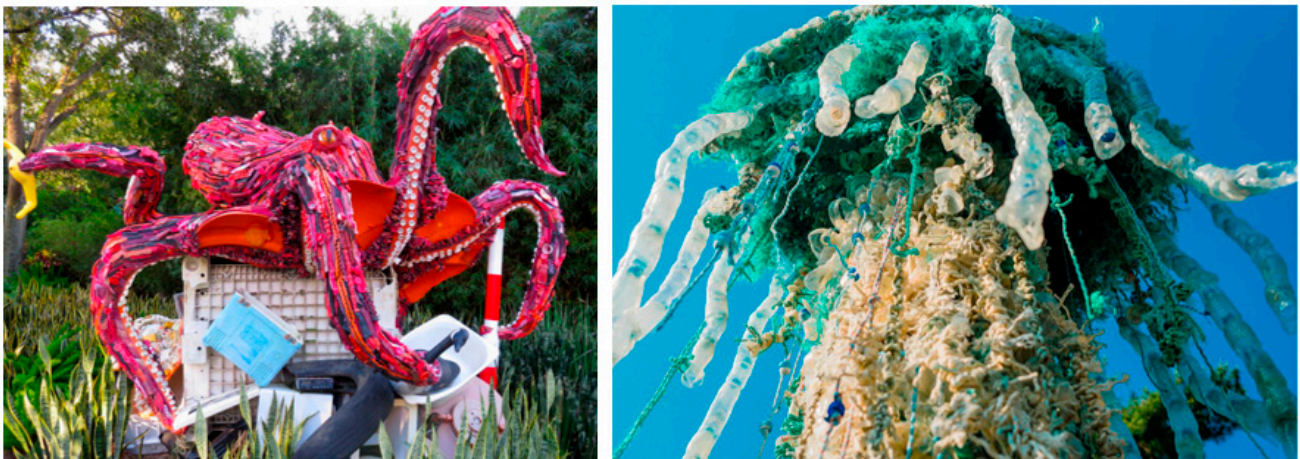
Figure 1. 2 of the 17 Sculptures exhibited outside the Smithsonian's National Zoo in Washington, DC by Angela Pozzi (2016).

"I walked onto this one beach and I was just shocked. There was a rack line of plastics going away as far as the eye could see. I was absolutely horrified. I saw people along the shoreline picking up agates and shells with their little buckets, and I thought, I have to figure out how to get those people to pick up this stuff. And I have to get them to see. Because we can't not see it—this is bad. So I decided to only use garbage from the beach as my medium." (Taken from URL: https://oceanic.global/angela-pozzi-of-washed-ashore/ 12 February 2021)