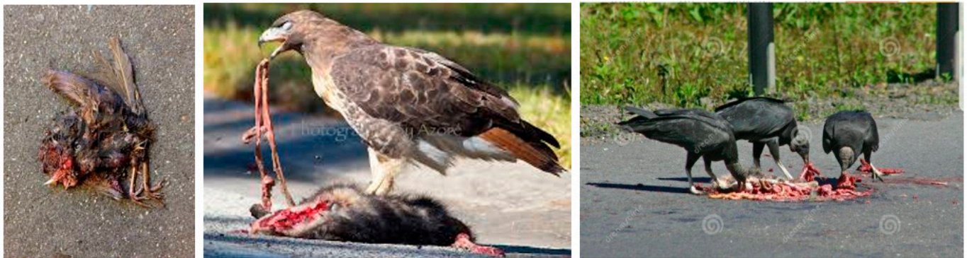
Figure 7. Roadkill and scavengers, one of the damaging consequences of driving—beyond the omnipresent ecological corridor devastation as a result of road infrastructure.

mitigated. It also highlights how nonhuman animals are affected by and need more from human infrastructures (Figure 7).