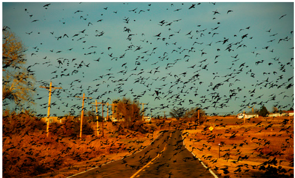
Figure 8. Who owns the road, (Source: https://howwedrive.com/2010/03/17/birding-while-driving/ , accessed on 15 November 2020).

Scholars, like Stephanie R. Fishel explore how social theory can think creatively about how nonhuman animals are impacted by and require more attention from infrastructures built for human mobility [53]. Anthropocentric environments that are principally designed to accelerate industrialized human beings and their goods are shared with other species. These human-designed spaces have fragmented these once-continuous landscapes and ecosystems into isolated patches of natural habitat, and animals must use them when coming out of the neighboring forests. Furthermore, birds are born to travel, with their migratory patterns crossing this world. How can these roads be shared? (Figure 8).