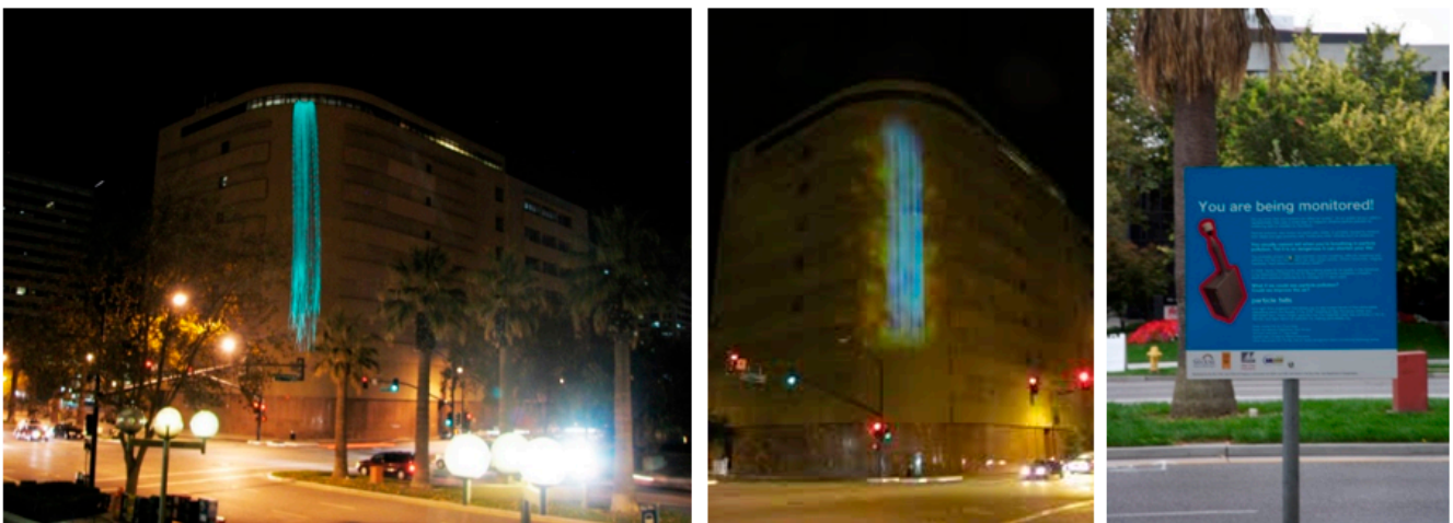
Figure 3. Left: Particle Falls provides a real-time visualization of particulate pollution in the San Fernando Corridor. Right: Billboard announcing the art installation. Work by Andrea Polli and Chuck Varga, San José, CA, USA, 2010.

Let us consider a second eco-art installation. Particle Falls , by Particle Works of California, was exhibited in 2010 in California (Figure 3). The work provides a real-time visualization of particulate pollution in the San Fernando Corridor. It includes a billboard that announces how the visualization must be read, a key part of the piece, since it allows for comprehension of changes in the projection. This, in combination with the data visualization of the projection, characterizes Particle Falls as a piece that aims to inform. Indeed, the work aims to raise awareness about air toxicity, making the quality of the air in its region visible to passers-by.