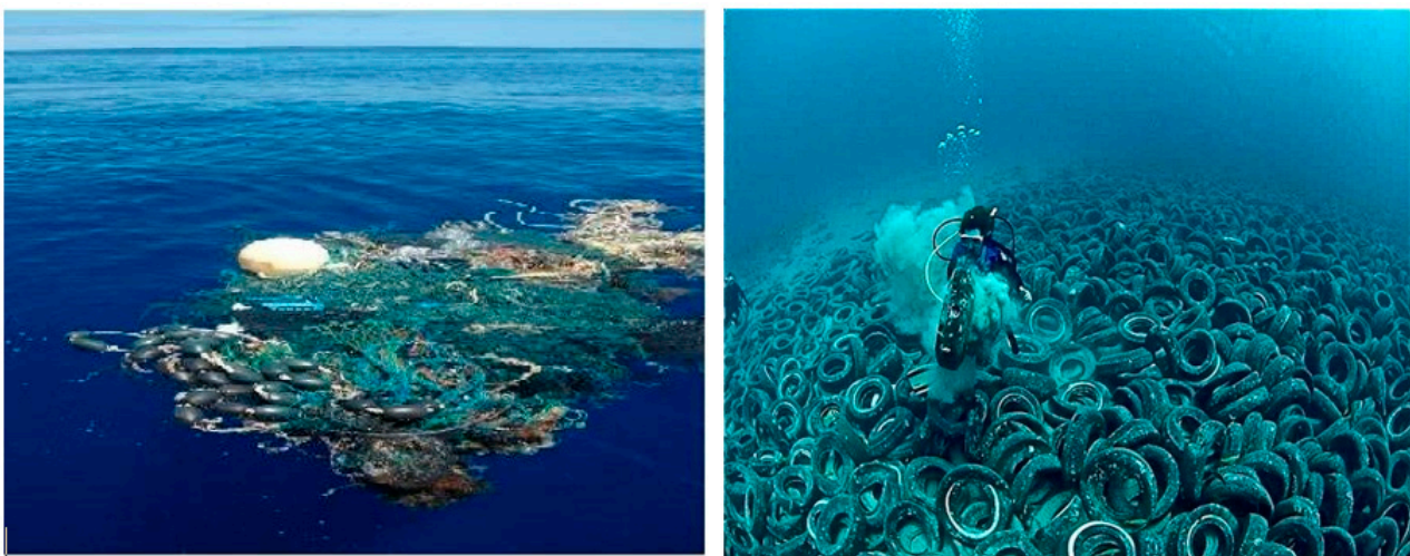
Figure 2. Left: 'Great Pacific Garbage Patch' is massive floating island of plastic, now 3 times the size of France (Source: https://abcnews.go.com/International/great-pacific-garbage-patch-massive-floating-island-plastic/story?id=53962147 accessed on 15 October 2020). Right: Pile of automobile tires sunk into the Pacific. Images from the creative commons.

Her analogical tropes, particularly biological, suggest meaning through familiar points of reference [43–45]. These analogies make obvious references and adopt a method of consensus and agreement for communicating an eco-lesson well known by the majority of viewers. The eco-lesson delivered is related to conspicuous consumption and is based on the notion of massive amounts of waste, particularly single-use plastics and the general debris of daily habits, even if much of this waste is an outcome of ecological production. Ecological production is a type of production practice that aims to adopt eco-efficiency measures in their design and construction process. They aim to reduce production impacts, but not consumption habits. This is a deep-seated problem, and one that occupies the imaginary of people around the world, especially since the discovery of large islands of single-use plastics polluting water systems and intoxicating fish, wildlife, and natural habitats (Figure 2). However, very few will ever have access to such ocean disasters. Pozzi's work is intended to rouse visions of this "invisible" devastation by concretizing these visions along the shore. It is however, not clear if it is successful in terms of changing consumption habits, production processes, or the ways in which waste is managed. It does however create communities of practice around ocean trash and collection [46,47], even if this will not solve ocean plastic's massively dispersed problem.