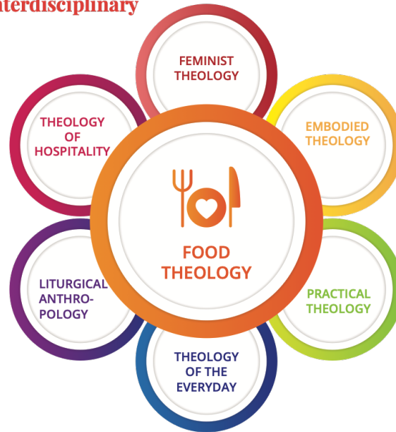
Figure 2 by Céline Singh