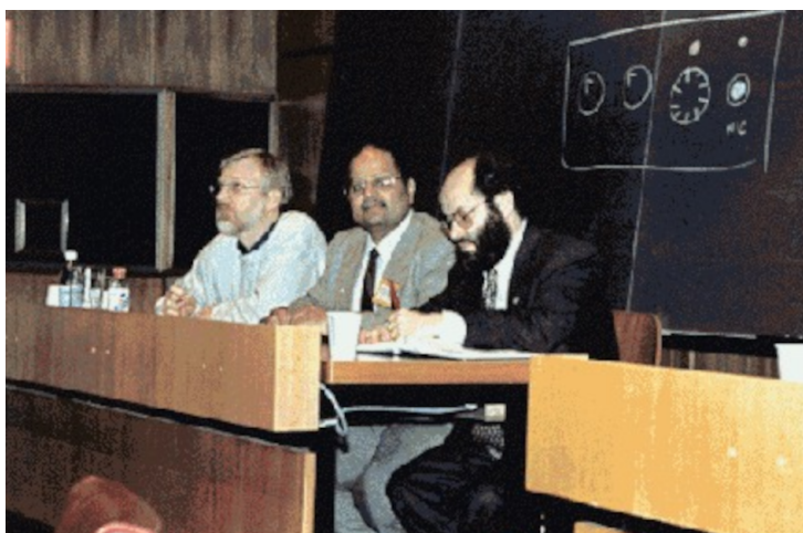
Figure 2: WWWI Navigation Workshop

As noted in [20] “even before the introduction of the web, the internet had made it possible for people to communicate via electronic mail (email)[69],[88] and on-line chat, allowed sharing of files[87] using anonymous file transfer protocol (FTP), news (Usenet News), remote access of computers (telnet), Gopher (a tool for accessing internet resources), Archie (a search engine for openly accessible internet files) and Veronica (search for gopher sites). These early systems afforded the opportunity of interconnecting people (who wanted to be connected), sharing resources without requiring anything in return and providing security and privacy; there was not yet any question of monetizing; the whole concept was to share without exploitation or expropriation of user data or content. However, these systems were not adopted widely: a key limitation of these early internet tools was the need to have some computing savvy; another challenge was the lack of an infrastructure to transfer the know-how to novices. This was also a limitation for the early web with the use of user unfriendly, text-based web browsers and a lack of training facility and easy to learn tools to build and maintain hypertext documents.