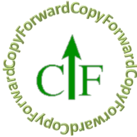
Figure 4: Copy Forward

The concept of CopyForward was put forward by the author to not let baron-entrepreneurs to exploit human knowledge for private gain. It depends on moral obligation with the hope that it will help the coming generations.