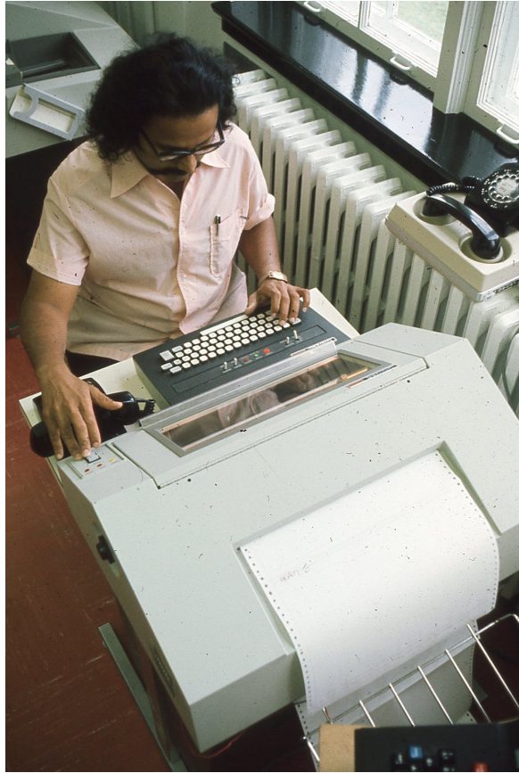
Figure 1: Remote computing

The author using an acoustic coupler to communicate with a remote main frame -early 1970s