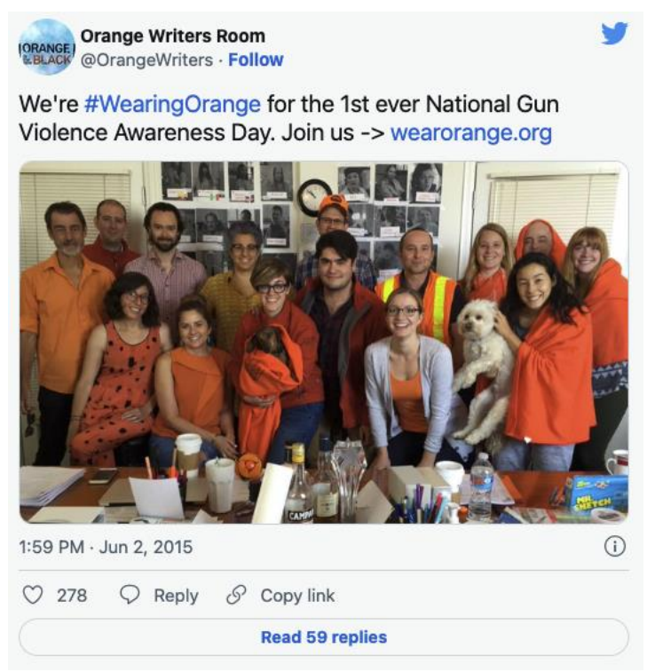
Figure 17. OITNB Draws Criticism for its Mostly White Writers' Room.

Because OITNB was already contractually obliged for a fifth, sixth, and seventh season before its Season Four debut, the series experienced a number of growing pains as it ploughed onward and attempted to adapt to viewer criticism, the shifting cultural moment, and to changes to the show's production and writers' room, which included the hiring of a new crop of "diverse"