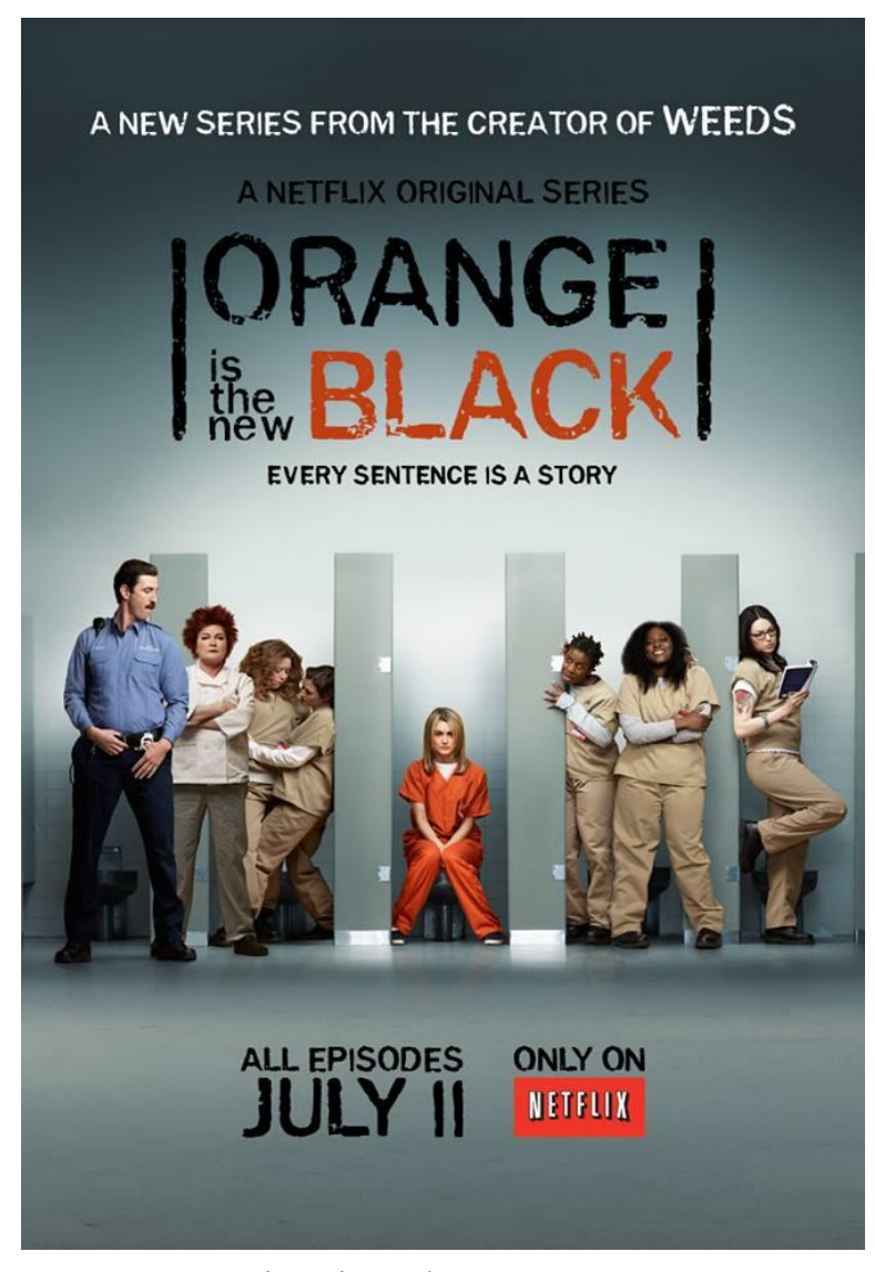
Figure 2. Centering Piper Chapman: OITNB 's Season One Promotional Poster.

comedy-drama by referencing Jenji Kohan's Weeds , <sup>49</sup> and by comically emphasizing Piper's solemn demeanor alongside the other inmates' playful expressions. The poster's tagline "Every