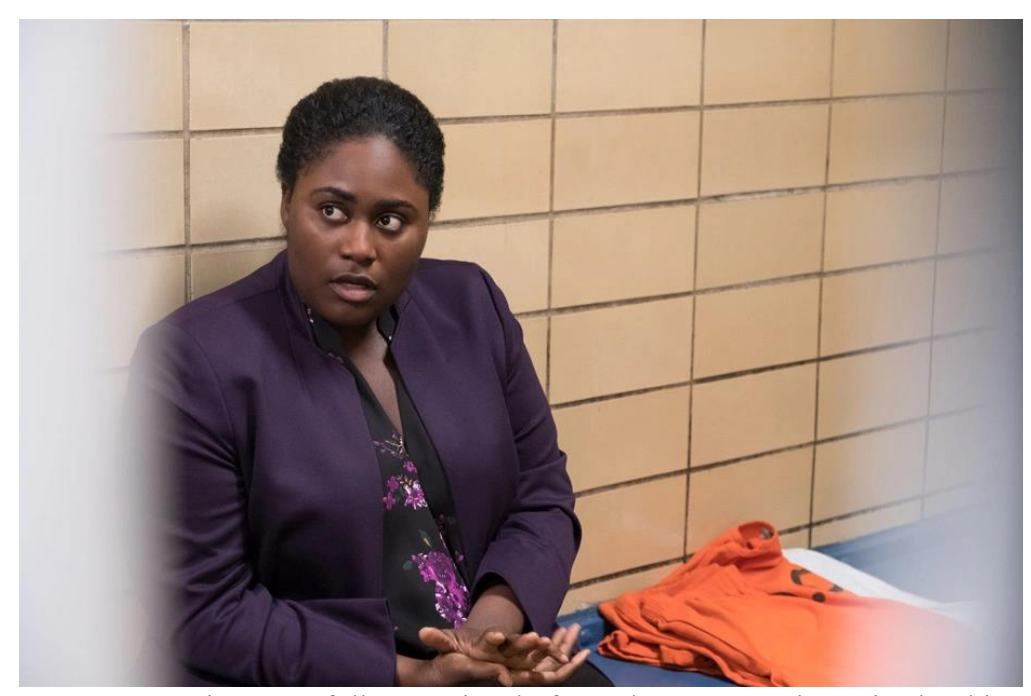
Figure 19. Taystee is Wrongfully Convicted of Murder: Season Six, Episode Thirteen "Be Free."