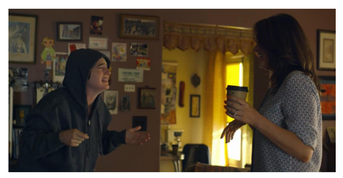
Figure 8. Ari and Sarah Mock Maura's Failed Performance of Femininity as an Ageing Transwoman: Season One, Episode Four "Moppa."