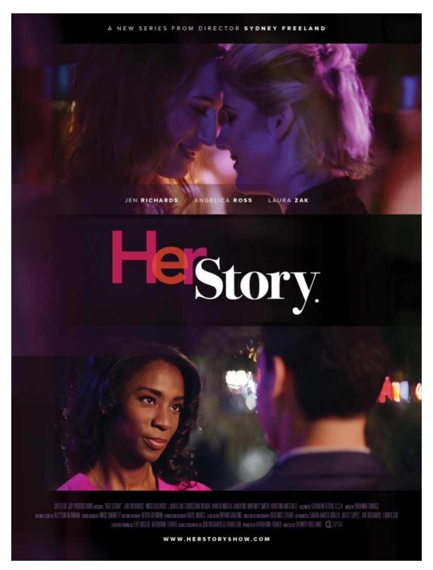
Figure 4. Centering Queer and Transgender Women: Her Story 's Season One Promotional Poster.

Her Story to be a different kind of show than either OITNB or Transparent , particularly given its emphasis on queer and/or transgender women who are written and played by queer and trans* entertainment professionals.