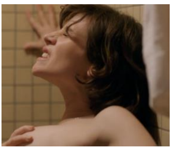
Figure 5. Adopting Piper's Eye-Line: Season One, Pilot Episode "I Wasn't Ready."