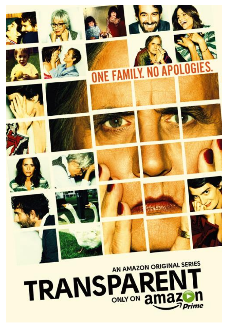
Figure 3. Networking Tambor's Celebrity & Star Power: Transparent 's Season One Promotional Poster.

family-drama with comedic elements. Given these denoted elements, viewers can expect the series to focus on Tambor's character's struggle with her transgender identity, and the impact it will have on her immediate family.