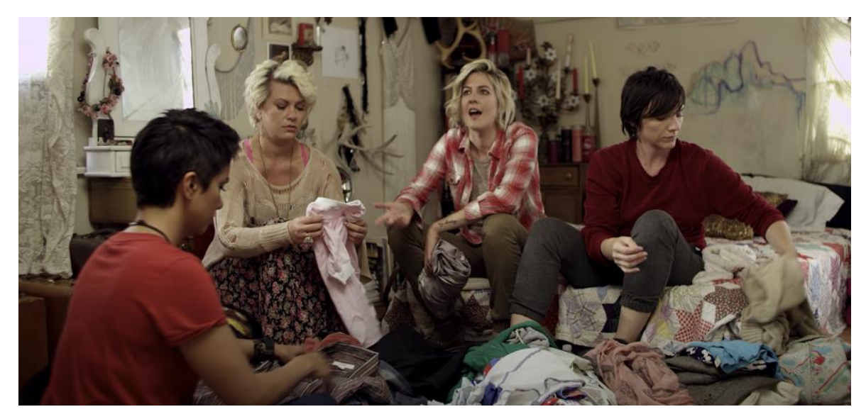
Figure 11. Allie and Her Friends Discuss Transgender Lesbians: Season One, Episode Two.

"less lesbian," to which Kat reassures her: "Last time I checked, 'lesbian' means loving women. So, what's the problem?" ( Her Story , "Episode Two").