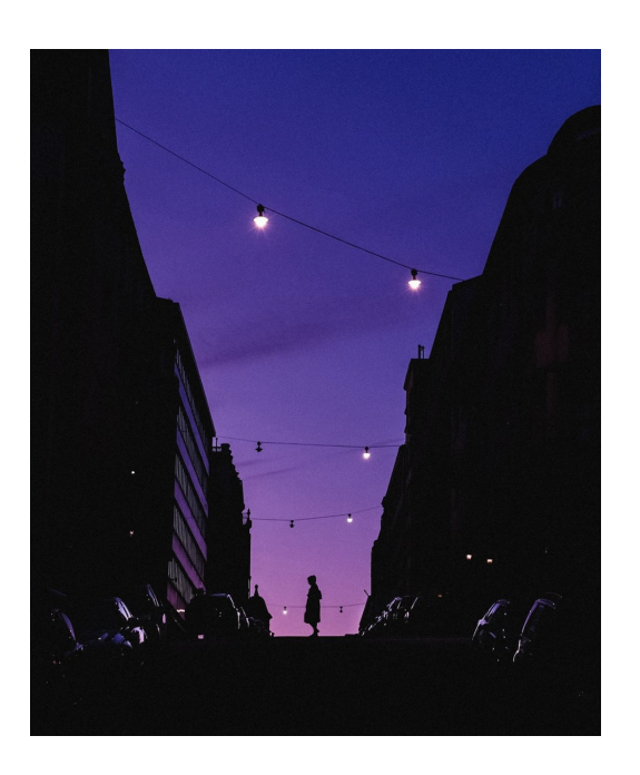
[Canon EOS 1100D with 24mm lens, ISO 100, shutter speed 1/160 and aperture f/6.3.

Reflections : To capture reflections, one should position themselves strategically near reflective surfaces such as windows, metal structures, mirrors, or bodies of water. A wide aperture creates softly blurred reflections, while narrower apertures, provide more details to be visible. For anonymity, it is advised to focus on the reflection panel for intentional blurring of the subject.