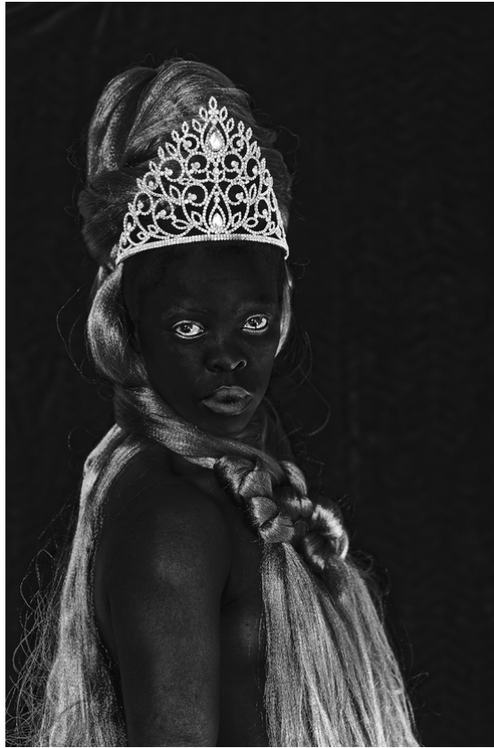
Figure 10: Zanele Muholi, Ntozabantu VI , Parktown, 2016. Silver gelatin print. Image and paper size: 80 x 53.5cm. Edition of 8 + 2AP.