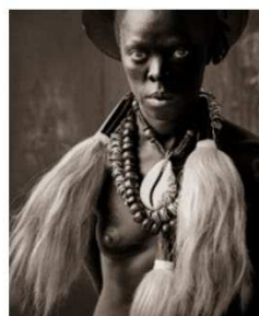
MalD in Harlem, African Market, 116 St, 2015