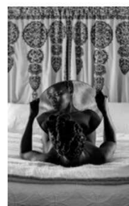
Bona, Charlottesville, 2015