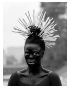
Ndivile II, Malmö, 2015