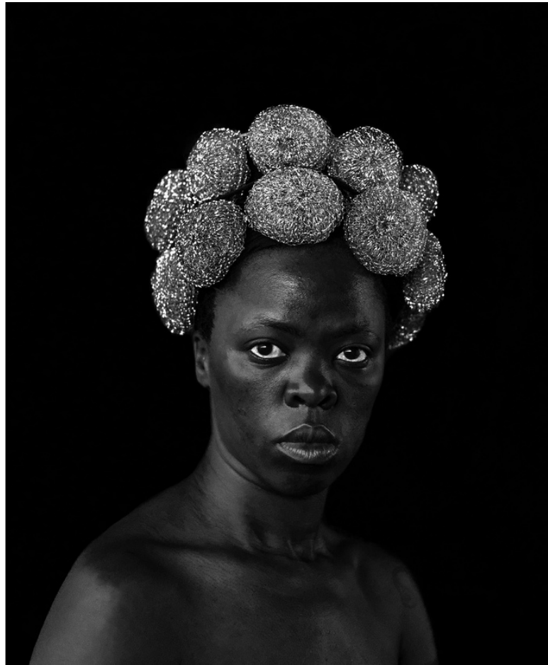
Figure 4: Zanele Muholi, Bester V Mayotte , 2015. Silver gelatin print. Image size: 50 x 41cm. Paper size: 60 x 51cm. Edition of 8 + 2 AP.