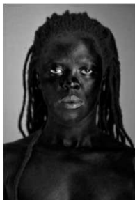
Mfana, London, 2014