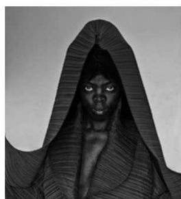
Thembeke II, London, 2014