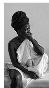
Vukani II, Paris, 2014