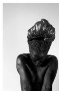
Thembitshe, Parktown, 2014