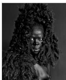
Somnyama IV, Oslo, 2015