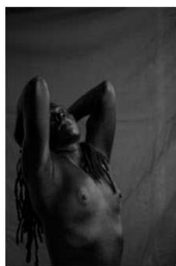
Somandla, Parktown, 2014