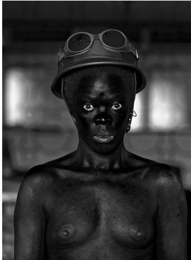
Figure 11: Zanele Muholi, Thulani II , Parktown, 2015. Silver gelatin print. Image and paper size: 50 x 36.2cm. Edition of 8 + 2AP.