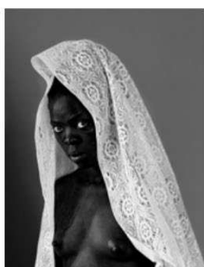
Thembeke I, New York Upstate, 2015