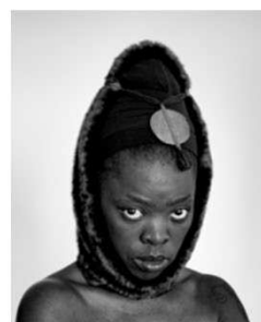
Ntombi II, Paris, 2014