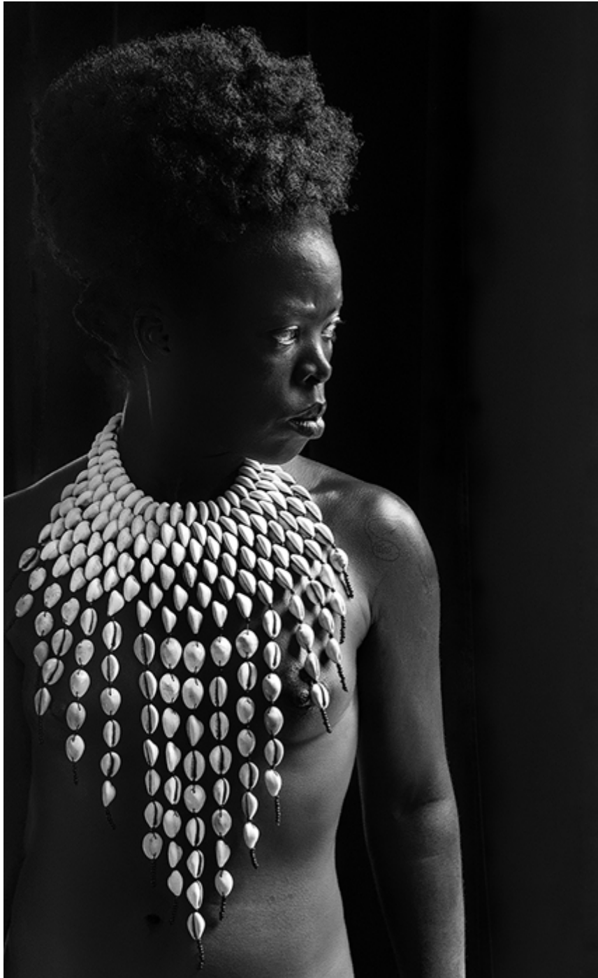
Figure 8: Zanele Muholi, Zodwa , Paris, 2014. Silver gelatin print. Image size: 80 x 48.8cm Paper size: 90 x 58.8cm. Edition of 8 + 2 AP