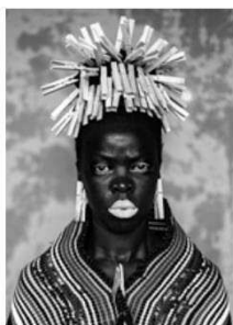
Bester I, Mayotte, 2015