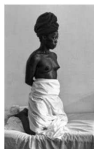
Vukani I, Paris, 2014