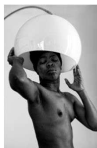
Inkanyiso I, Paris, 2014