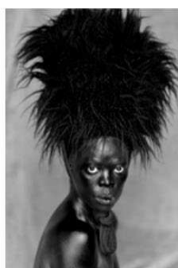
Somnyama I, Paris, 2014