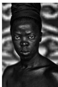
Ntomb'zane, Mayotte, 2015