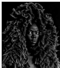
Somnyama Ngonyama II, Oslo, 2015