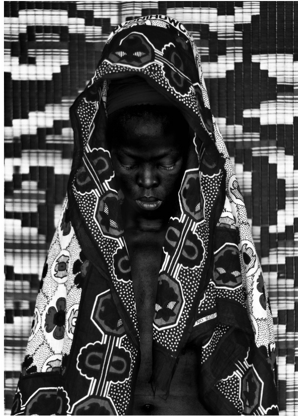
Figure 2: Zanele Muholi, Bester IV , Mayotte, 2015. Silver gelatin print. Image and paper size: 80 x 57.8cm. Edition of 8 + 2 AP. © Copyright 2025, STEVENSON. Image source: Stevenson Gallery, (Johannesburg, South Africa). Accessed February 2, 2025, https://www.stevenson.info/exhibition/1440/work/155