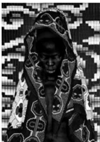
Bester IV, Mayotte, 2015