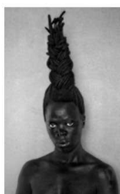
Zibuyile, Parktown, 2014