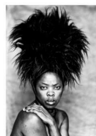
Bester II, Paris, 2014