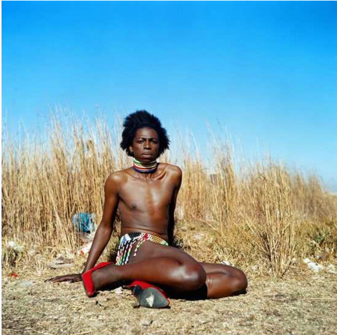
Figure 7: Zanele Muholi, Miss D'vine I , 2007. Lambda print. Image size: 76.5 x 76.5cm. Paper size: 86.5 x 86.5cm. Edition of 5 + 2AP.