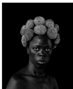
Bester V, Mayotte, 2015