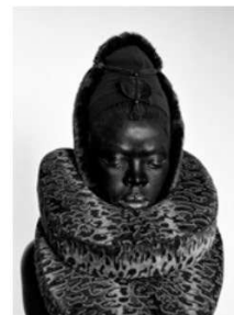
Somnyama III, Paris, 2014