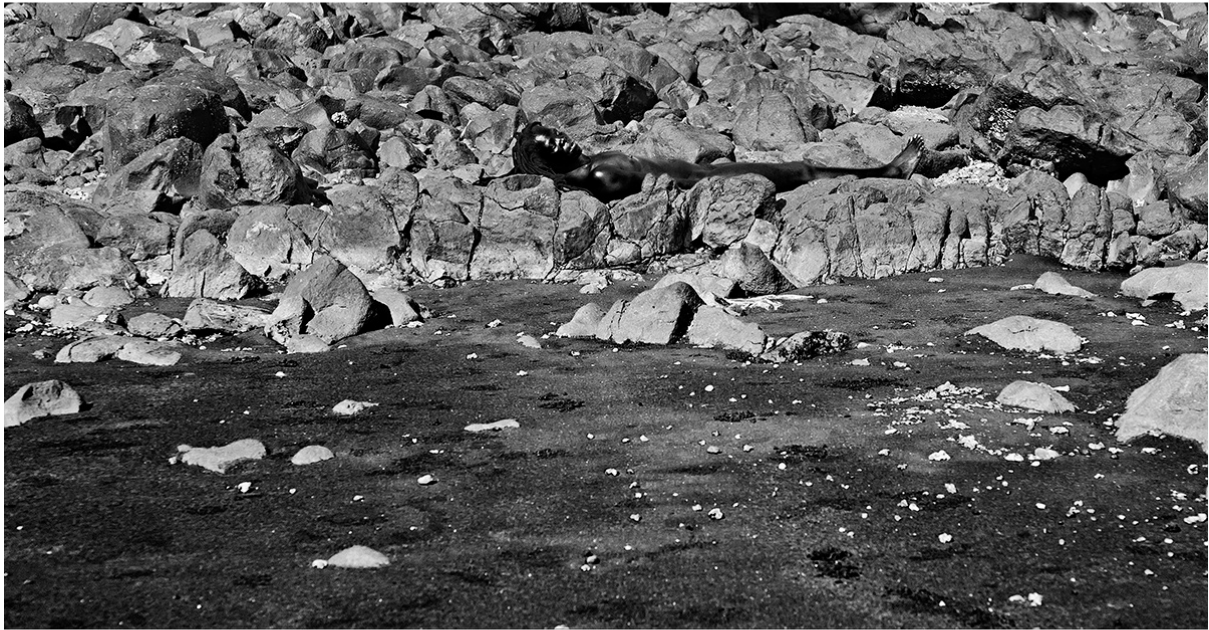
Figure 9: Zanele Muholi, Bhekisisa , Sakouli beach, Mayotte, 2016. Silver gelatin print. Image and paper size: 52 x 100cm. Edition of 8 + 2AP. © Copyright 2025, STEVENSON. Image source: Stevenson Gallery, (Johannesburg, South Africa). Accessed February 2, 2025, https://www.stevenson.info/exhibition/1440/work/25