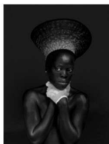
MalD I, Syracuse, 2015