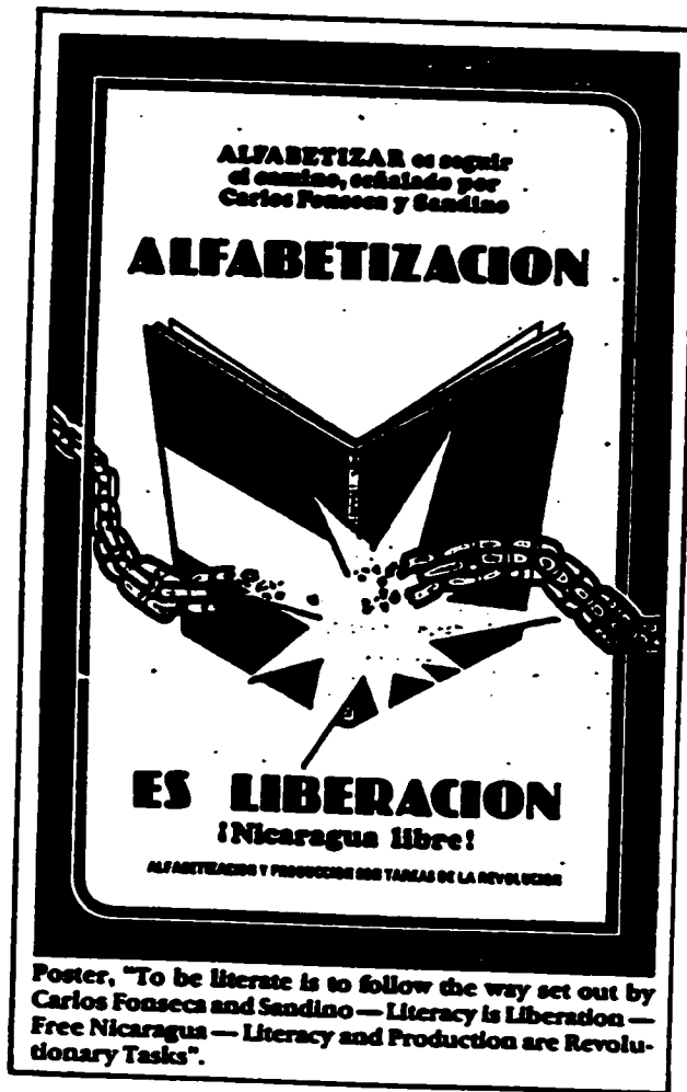
Figure # 7