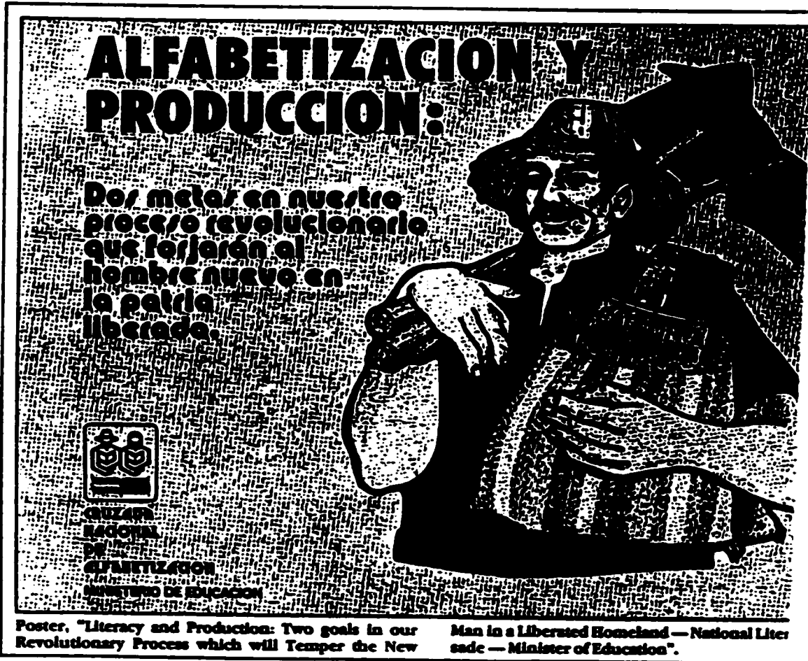
Figure # 6