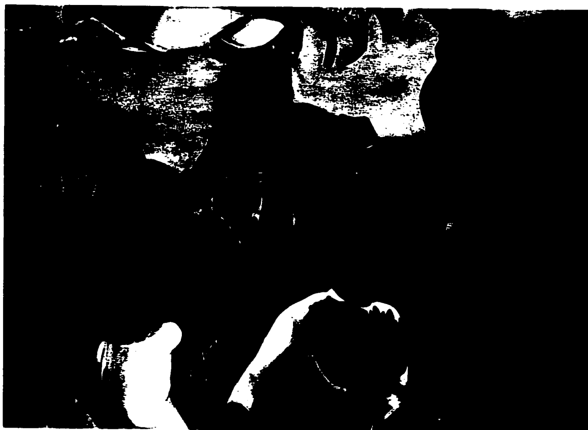
"The Birth of the New Man" By the Boanerges Cerrato Collective Figure 2