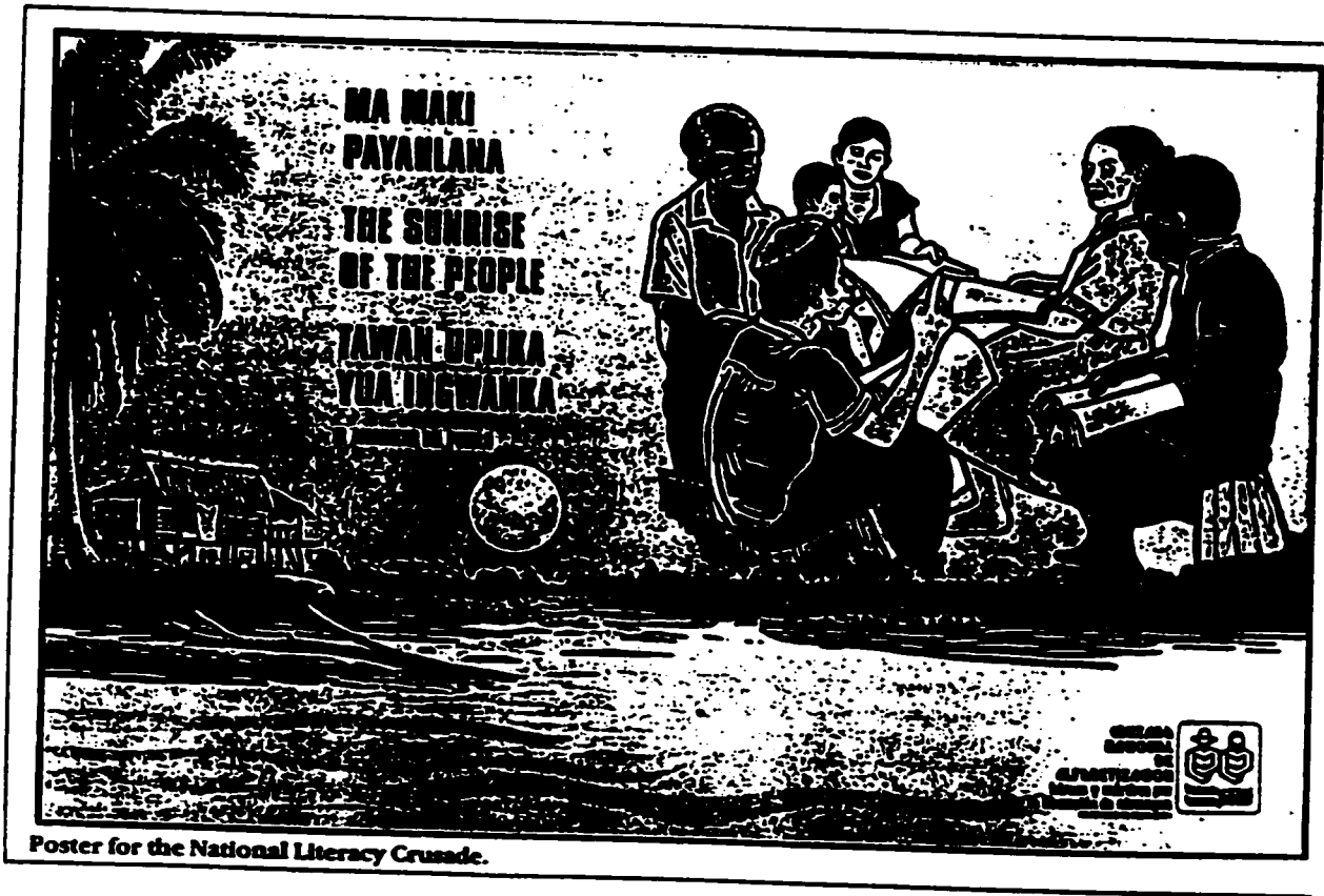
Figure # 10

Poster for the Literacy Campaign in Indigenous Languages In the Atlantic Coast Region, With Text in Miskitu, English And Sumu, and Smaller Text in Spanish Below