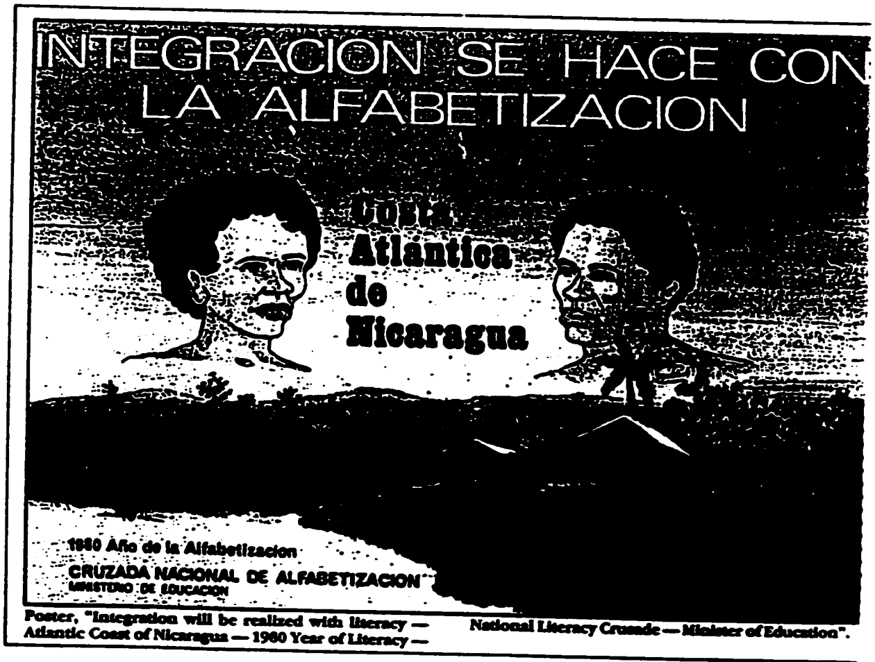
Figure # 9