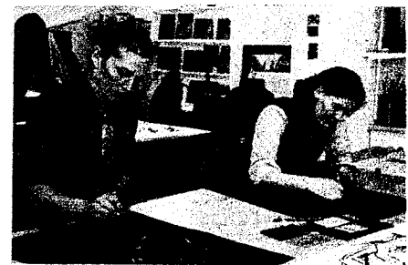
Figure 5 Students Working in the Classroom