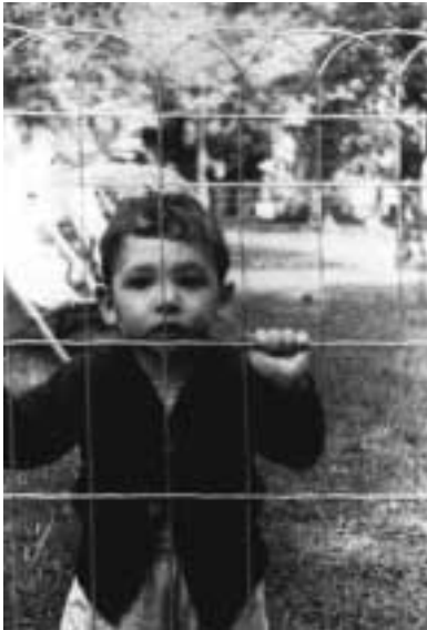
In the backyard of our house on the Jersey Shore. I'm about four years old.