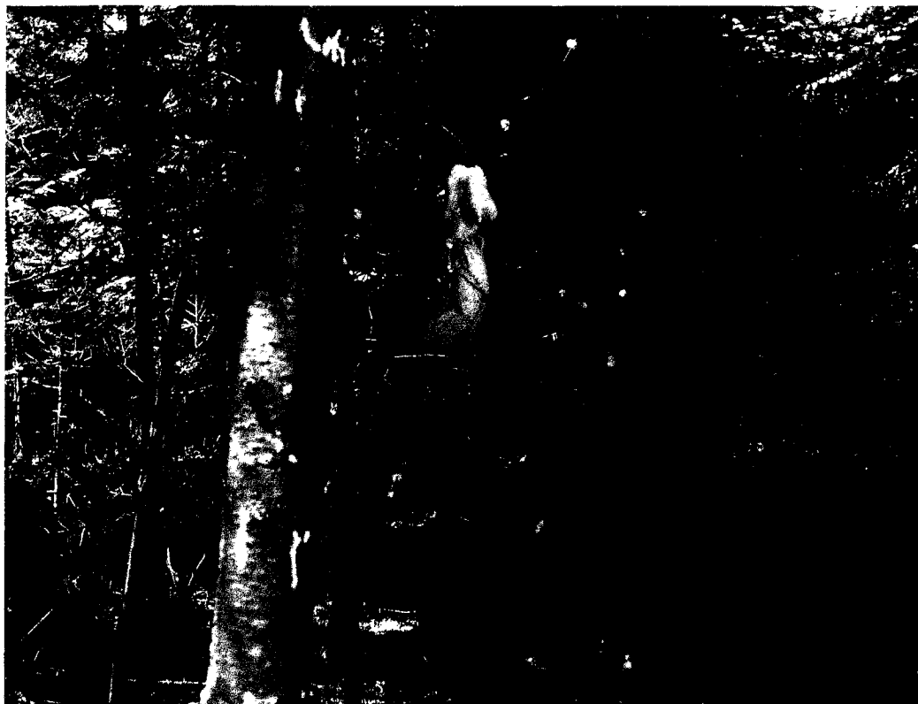
Figure 2: René Derouin, Installation temporaire avec poème de Gaston Miron, 2003