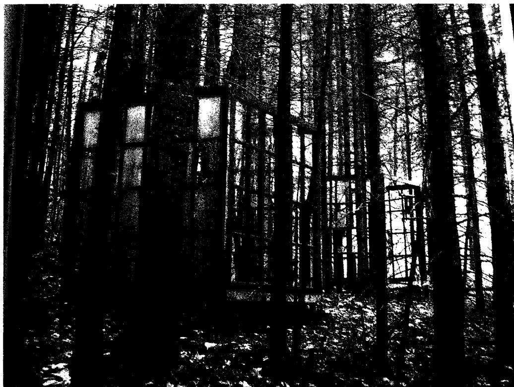
Figure 8 : Artist René Deroui and participants in front of H  l  ne Escobedo's (Mexico) La Cabane de Julie , (1996). In-situ installation with windows from the Angus Shops. Symposium Int  gration aux lieux par la Fondation Derouin.