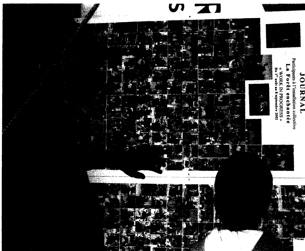
Figure 4 : The artist René Derouin showing some of the numerous visitors who make clay fish. These pieces were included in the collaborative work for the in-situ exhibition of La forêt enchantée exhibition during the Symposium of 2003.