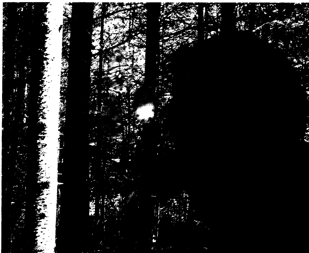
Figure 7: Detail of in situ work by Sonia Robertson, Tendre les regards , 2002