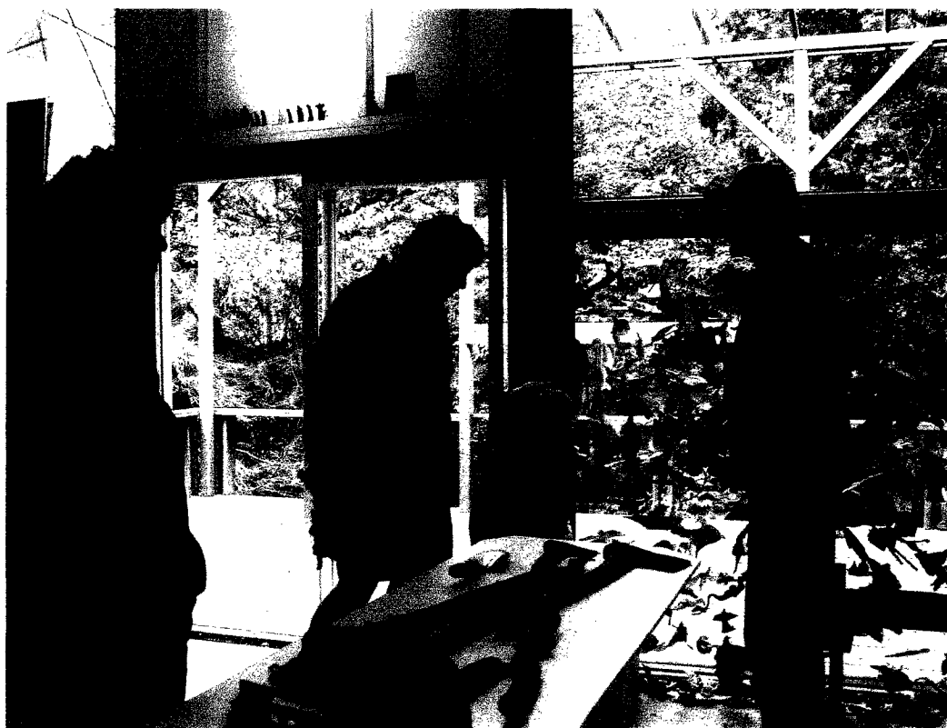
Figure 3: Clay birds created by visitors to the site, which became part of the collaborative installation on the site of the Symposium. Installation collective du public , 2003