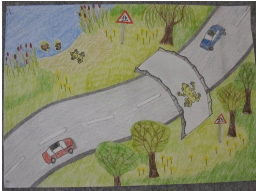
Fig. 2. Runner up of the "On Dangerous Roads" Competition organized by Varangy Akciócsoport Egyesület for the 2010 Infra-Eco Network of Europe Conference showing an overpass used by wildlife. An ongoing project in the Netherlands is studying the effectiveness of an overpass for amphibians, in combination with fences along the road. This overpass is equipped with a cascading series of small ponds fed with water pumped into the highest pond in the center of the overpass.

suitable habitat for small mammals. Only 2 of 13 species of small mammals were never captured near roads, and the remaining 11 species' numbers were either similar or more abundant near the road than further away.