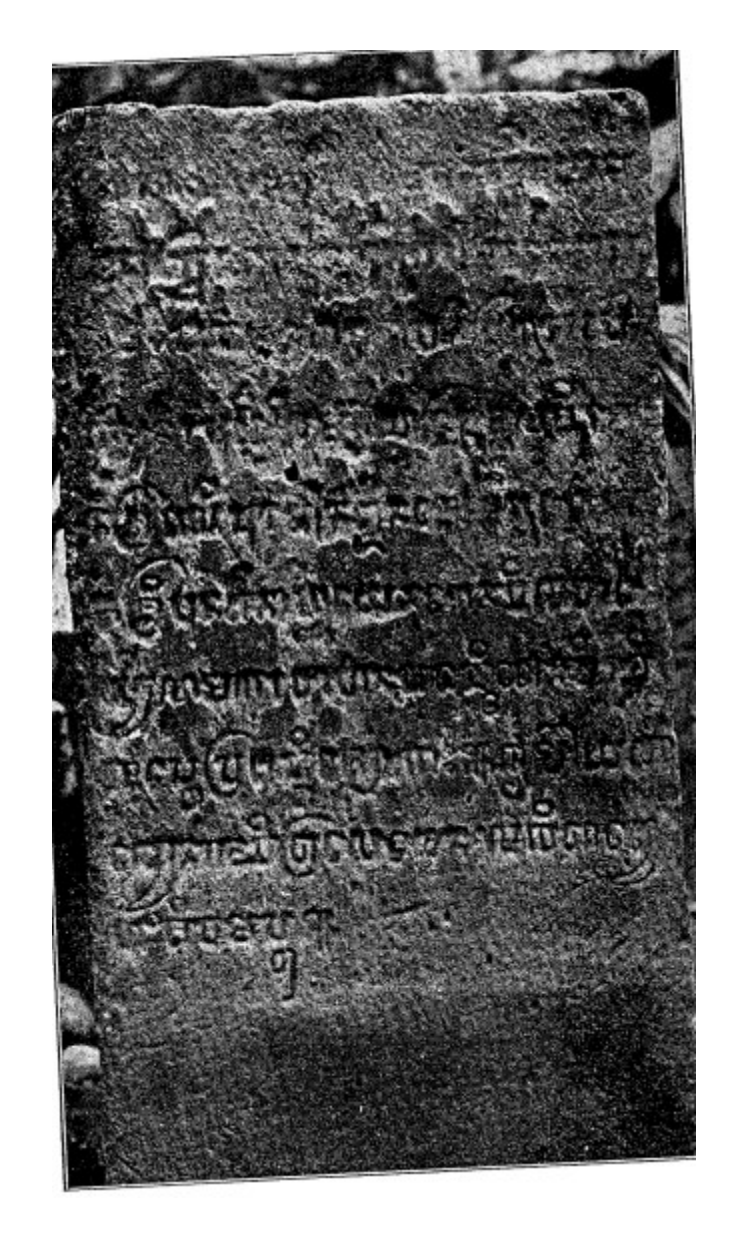
Side d of inscription S7m (Stutterheim 1929-30, fig. 104)