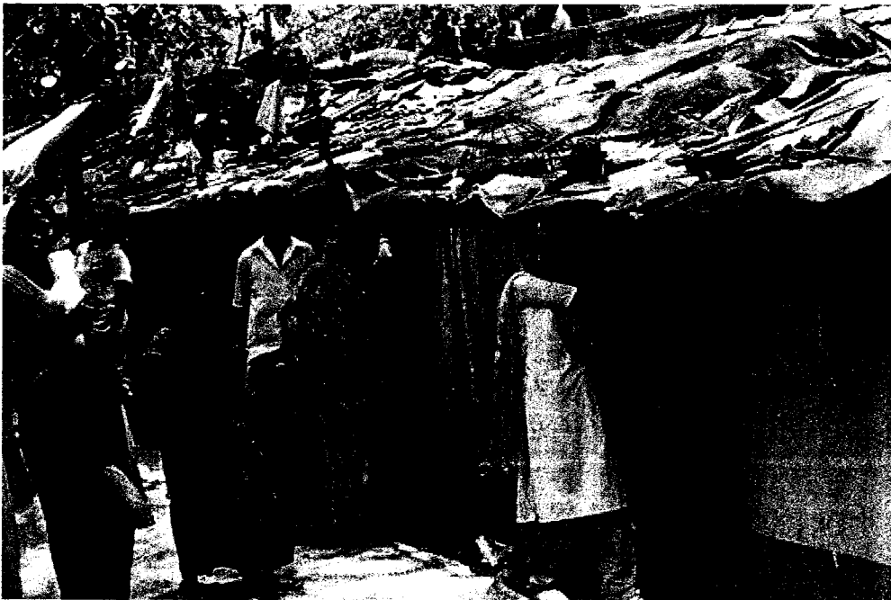
Kuttcha Dwellings in CP (October 2007).

The Mexican poet, Octavio Paz once wrote that India was a “place that overwhelms the senses, before sense can be made of it” (Paz 1995: 13). The task of