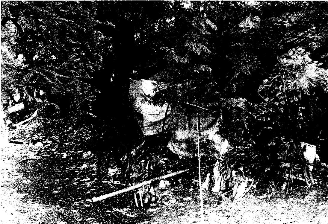
Rajdanga Para - Canal-side

Sheltered by foliage on one side, and a line of new concrete apartments on the other, Rajdanga Para- the name of this particular block of shanties – felt on that morning, like a convection oven. The languid movements of the men and women – slow yet deliberate – gave evidence to the stifling torpor that pervaded that city during the sweltering summer months.