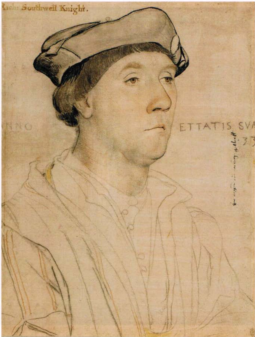
Figure 1. Hans Holbein the Younger, Sir Richard Southwell , 1536.