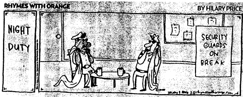
Figure 6: Rhymes with Orange Carton