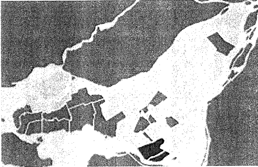
Figure1: Location of the borough of LaSalle within the city of Montreal.

(Wikipedia.org: http://en.wikipedia.org/wiki/LaSalle,_Quebec ).