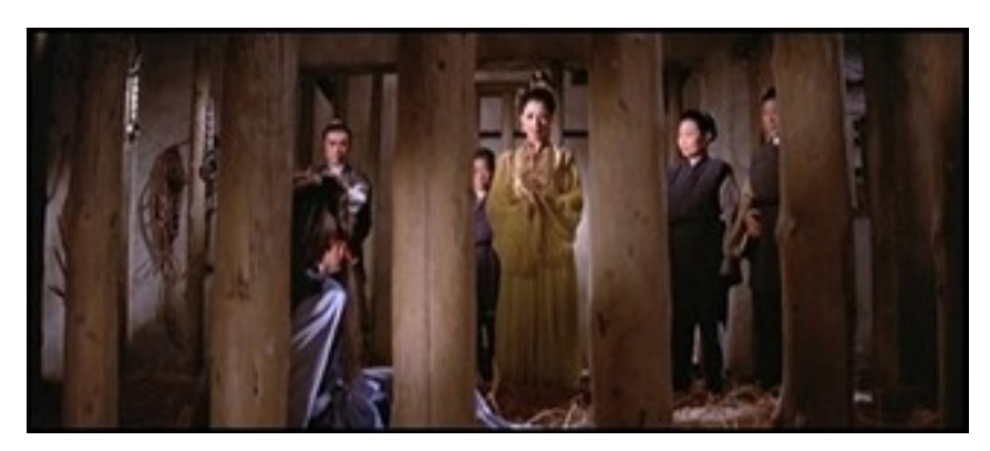
Figure 5: Framing used to reinforce entrapment in Intimate Confessions of a Chinese Courtesan (1972)

symbolic meaning of his films. This disregard for realism permeates both form and content. Thematically and stylistically, Chor Yuen privileges ethereality over viscerality, sentiment over pragmatism, and aesthetic composition over the illusion of space. Narratively, this evanescent reality can take the form of the bizarre, often whiplash-inducing plot twists and revelations that destabilize conventional storytelling in almost all of his films. Chor features recurrent scenarios of entrapment, entanglement, and enclosure (fig.5) that echo his characters' tendencies to become trapped or lost navigating the vagaries of both their world and the plot. Gothic deceptions are also frequent subjects, incorporating elements of the supernatural that disrupt our relationship to what is real or fantasy within the genre, and deny any the certainty of meaning (fig.6).