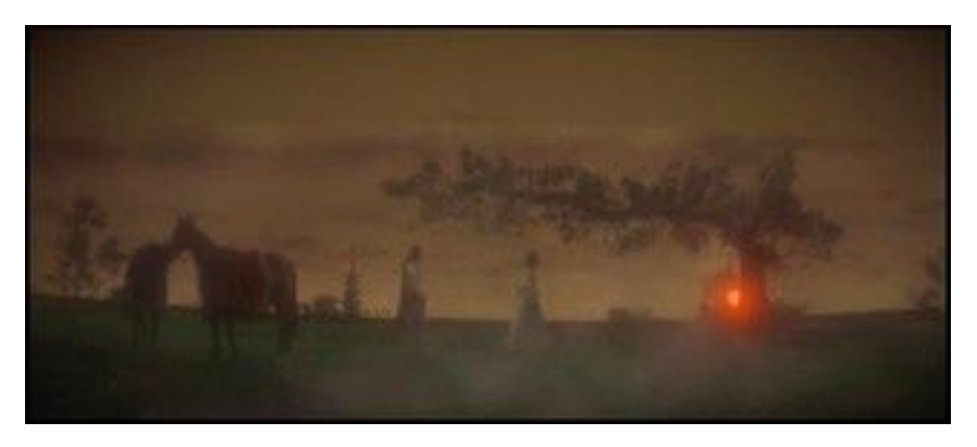
Figure 30: Heaven Sword and Dragon Sabre Part 2 (1978)

Of course, these compositional devices may not always serve a connotative semiotic value. A sprig of autumnal foliage may not always be a sign for the natural world; a flower is not always a signification of pure love. As purely formal constructs, these shapes play to a more expressionistic interest, one that unseats reality in pursuit of affective abstraction. By the same token, the contrivance and inherent artificiality of these objects cannot be wholly discounted. Chor Yuen rarely makes use of non-diegetic images of nature for us to meditate upon. Indeed, his natural objects are themselves always ersatz; too colourful, too picturesque, and too specialized in their shapes to truly impress any sense of naturalism upon the spectator. Rodriguez was careful to add a caveat to his conceptual question of 'Chinese aesthetics', noting how easily such generalized conversations can lead back to an essentialism that "eternalizes the national culture by treating it as an ahistorical, unitary reality reducible to a few distinctive and pervasive traits" (Rodriguez 74). This seems to be of little concern to Chor Yuen; indeed, it is precisely his use of such hyperbolized and essentialized iconography that unlocks the affective orientalist appeal of these culturalist symbols, and lends them their seductive and uncanny air. His