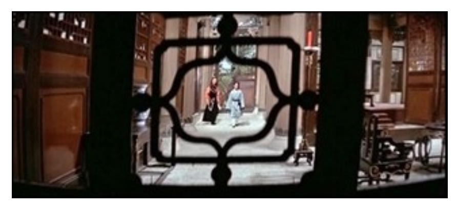
Figure 13: Décor as framing. Clans of Intrigue (1977)