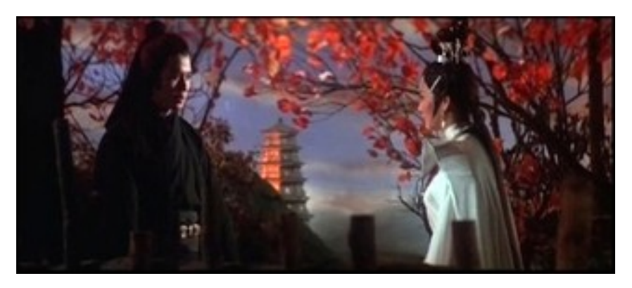
Figure 23: Perpetual 'golden hour' in Death Duel (1977)