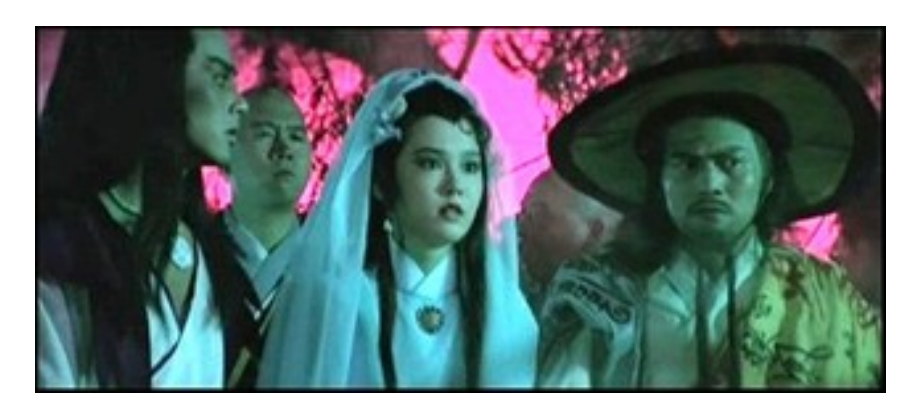
Figure 24: Something wicked this way comes. Expressionistic colour use in The Enchantress (1983).

In addition to his frequent use of coloured lights, Chor also treats colour as a compositional tool through in-camera means, by using his lenses to blur the lines between abstract colour and form. By the outset of the 1970s, the variable focus zoom lens was already a cherished and oft-employed item in the Shaw technical toolbox. Many directors, notably Chang Cheh, "bombarded the sets with quick zooms that violated the integrity of the space" (Ho 2003, 120). While Chor Yuen was certainly was not above using the notorious Hong Kong quick-zoom to punctuate dramatic moments with sudden expressive motion, on the whole his use of the zoom was more about its power to create distortions in the image. In the realist mode of the filmmaking, the play of depth, of subject and foreground, creates a sense of spatiality. Instead, a favourite tactic used by Chor was to compress the planar fields of figure and foreground together to produce an effect that differs from conventional juxtapositions of recognizable subjects.