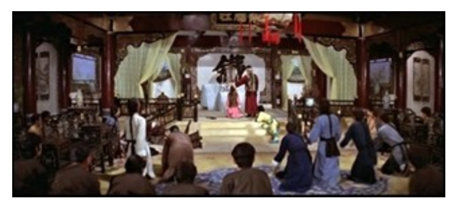
Figure 7: from The Emperor and his Brother . The patriarch kills his young son. The onlookers freeze in tableau...