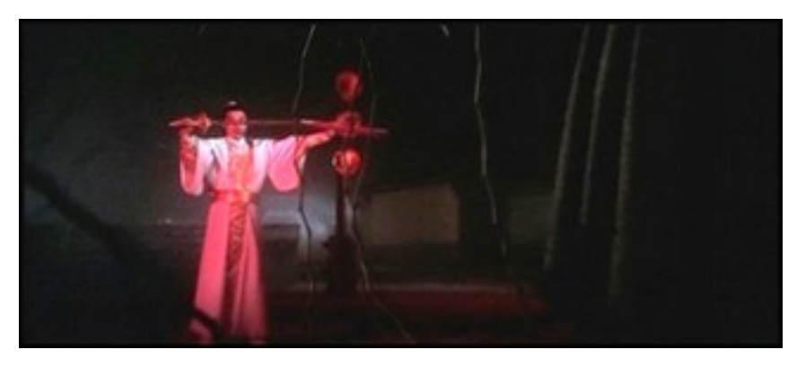
Figure 38: Expressionistic lighting prompted by violence in Magic Blade (1976)

of these elements not only emphasize the imaginary, mythical qualities of the story, but also serve to recall the tropes of the old Cantonese wuxia films.