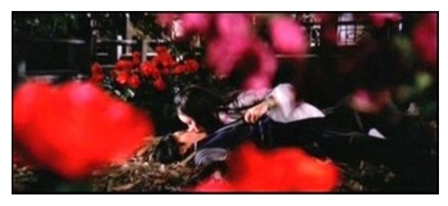
Figure 15: Encroaching flowers in The Bastard (1973)