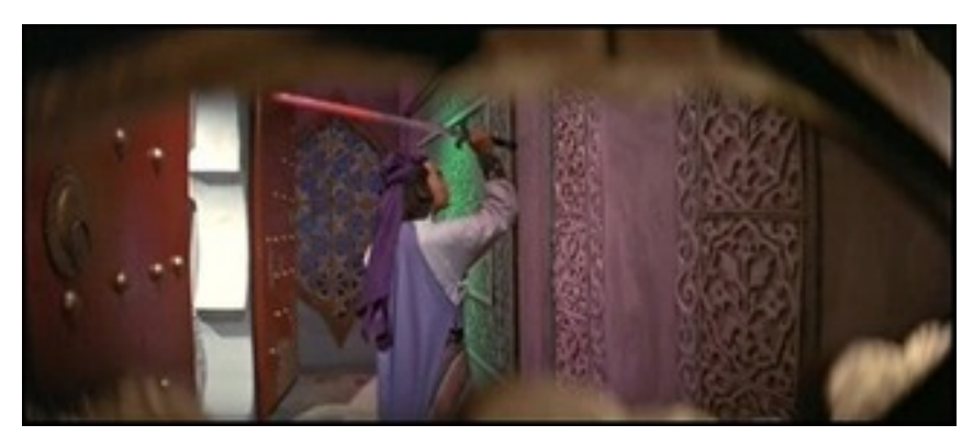
Figure 19: A non-POV shot composed through a decorative eyelet. The Roving Swordsman (1983)