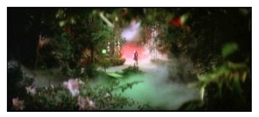
Figure 2: The 'magical' fox-world in Full Moon Scimitar (1979)

However, Chor frequently de-emphasized the sense of depth in these images by composing them in layers of fog and flora that accentuate their unreal qualities, or by using zoom lenses to press foreground elements into blurred hazes that flatten the image into more painterly abstractions (fig.3). On other occasions, his large interior sets are interrupted by a complicated arrangement of barriers; in these environments, Chor's lateral tracking shots capture characters