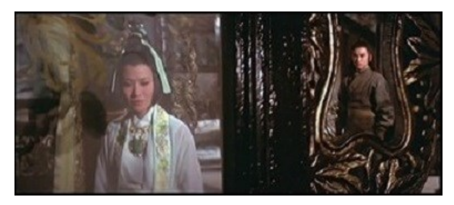
Figure 20: Peering at the world through sheer screens and decorative framing. The Sentimental Swordsman (1977)

These types of framing devices create a self-conscious aestheticization, wherein each shot can become individualized by its contrivance; representing a discrete, 'autonomous' composition that often defies the requirements of spatial realism or continuity. If the decorative legs of an antique table jut into frame to enclose dueling swordsmen, or if a fringe of flowers intrudes to bracket the face of a hero, these objects may have no readily apparent corresponding referents in a wider establishing shot. These formal 'cheats' rarely carry any true relationship to the concrete spatiality of objects in the diegetic world. Instead they function as covertly ephemeral devices that rearrange themselves to suit the decorative needs of Chor's image on a shot-by-shot basis. Cheating space to create an autonomously appealing image is nothing new in cinema. Stephen Heath observed that "the fiction film disrespects space in order to construct a unity that will bind spectator and film in its fiction" (Heath 101). In Chor's case, it is the unity that disrespects reality; the cumulative effect of his treatment of the image binds the spectator into his dreamlike film world, while also pointing to its fiction.