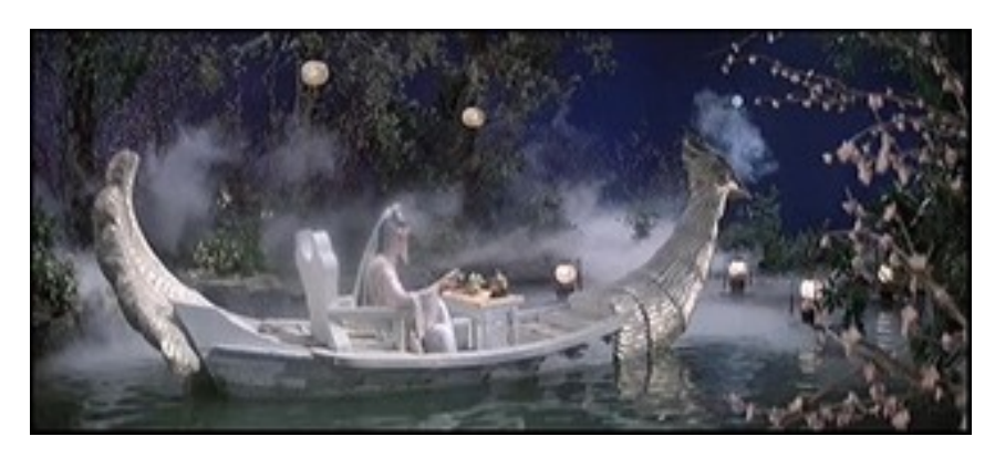
Figure 31: Descendant of the Sun (1983)

cinematic world is one that cannot, in the eyes of the spectator, loosen itself from the armatures of formal artistic caprice, or exist outside the confines of the frame. Nature, in verisimilar terms, cannot exist here; instead there is only the simulacrum, the aestheticized caricature of Chinese art, expressing an imitation of its own stylized artifice.