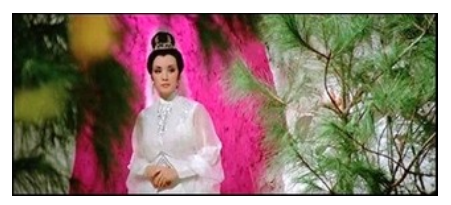
Figure 21: Clans of Intrigue (1977)

Chor Yuen frequently employs a heightened degree of colour to denote the chimerical qualities of the diegetic environment. Reflexively, extreme use of colour can be used to flatten the image plane or "to call attention to the artificiality of filmic colour" (Stam 256). Like everything in Chor's mise-en-scene, colour is defined by its excessive nature, either in its profusion (fig.21), or in its stark contrast when used as an accent (fig.22). In his garden-like sets, naturalistic colours become accentuated and intensified, pushed to melodramatic extremes in order to evoke the maximal sentimentality of an erotic daydream, or an autumnal nostalgia (fig.23). The deployment of unreal or excessive colour, even while wringing a surface affect out of the audience, also inevitably reminds viewers of the incongruities between 'real' colour and 'screen' colour, breaking the realist spell (ibid.). Typically, Chor achieves his most expressionistic colour effects through coloured lighting and filters, often (but not always) to indicate a heightened psychological state or an encounter with the supernatural.