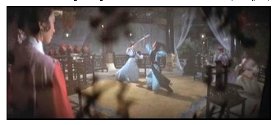
Figure 18: A fight scene from the other side of a calligraphy screen. Clan of Amazons (1978)

These angles often seem to originate from the most unlikely positions, using shapes in the studio environment to create carefully composed graphical arrangements. Rather than the notion of an invisible observer's viewpoint that sutures us into the space of the film, it could be argued that this represents the 'artist's eye' which provides a view that does not necessarily facilitate the primacy of plot, or serve naturalism. Rather, this subjugates the view of the filmic world to an increasingly abstracted compositional sense that flattens, obscures, and reframes spaces and characters within various squares, vertical slots, diagonals, and keyholes (fig.19). Rather than treating these formations as fully abstract geometric forms and voids, Chor Yuen will often retain a sense of his world's florid decorative texture in his framing devices. As putative components of the diegetic world – even if they only serve in many cases to mark the boundaries of the 'fourth wall' – they are often thick with the surface of Chineseness. Adorned with gilt devices, elegant blossoms, jeweled beads, or poetic calligraphy, these forms serve to overstate Chor's presentation of a 'dream of China' to a both sentimentalizing and alienating degree. The overwhelming effect becomes one of peering into the film, and enjoying this colourful, artificial world as one might approach a cabinet of curiosities.