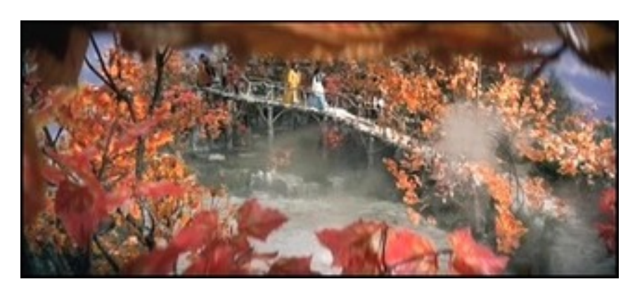
Figure 1: Heaven Sword and Dragon Sabre (1978)

with backlot and location shooting. Scenes were often constructed in open courtyards, cavernous interior spaces, and bustling open-air city streets, granting the benefits of deep space. In the films of Chor Yuen, there is rarely such an ambience of a larger world. Instead, his densely-packed settings are framed and reframed by decorative devices, creating beautiful but cluttered compositions that frequently eschew spatial continuities between camera positions. This is not to say that Chor did not also compose images in depth; the fantastical domains he depicts in films like Heaven Sword and Dragon Sabre (fig.1) and Full Moon Scimitar (fig.2) rely on truly immense interior sets that stretch into the distance.