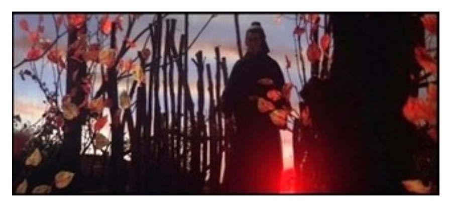
Figure 41: Death Duel (1977)

privilege self-consciously beautiful or abstracted compositions is observable throughout Chor's wuxia films, but in these sequences in Death Duel, it becomes especially pronounced. Throughout the fast-paced and briskly edited final fight sequence, the combatants are constantly under threat of becoming obscured or overwhelmed by their environment. Thick mists may cover them, or clusters of coppery thickets may loom in front of the camera, yielding fleeting or obstructed views of the deadly combat. Canopies of leaves seem to press down upon them, almost closing them off from the spectator's view. Other times, Chor makes these men and their battle seem small by using extremely long shots and foreground intrusions to place them into distant or enclosed portions of the frame (fig.42), and leave them dwarfed by the counterfeit natural beauty of the luxuriant sets (fig.43). The overall effect is one that both enthralls and alienates the spectator in equal measures. By emphasizing the artistic excesses of the constructed and mythical environment, the performers become lost in this dreamlike space, turning them into just another formal element of the aestheticized frame.