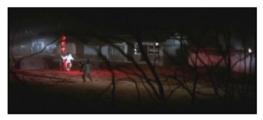
Figure 34: Dead brush encircles a tiny, off-centre battle for supreme swordsmanship. Magic Blade (1976)

they are alone, Chiu removes her blue dress to reveal a golden yellow robe underneath, and then begins to undress behind a gauzy calligraphic screen that creates a voyeuristic frame around her. The scene ends with the implication that Fu and Chiu consummate their love, but we discover later that this was in fact a ruse. Facing the true Master Yu in battle, Fu produces the golden robe and wraps it around himself. The secret of Chiu's golden Peacock Robe is explained; it is the only thing in the martial world that can protect someone against the power of the fearsome Peacock Dart. Suddenly Fu and Chiu's tryst is cast in a new light, revealing the act of sexual transgression itself to be yet another deception, one played against both Master Yu and the spectator.