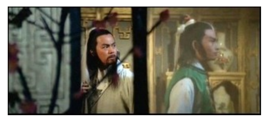
Figure 12: Overlapping screens break the frame into multiple frames in Perils of the Sentimental Swordsman (1982)