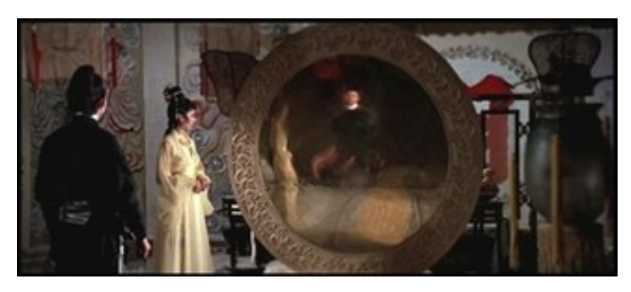
Figure 39: The golden mirror (Magic Blade (1976)

Ming offers Fu her own carnal body, the regal palace, boundless wealth, and the very identity of 'Yu' the master of the martial world, but Fu simply turns to leave. Here, through the symbol of the mirror, and the excoriation of the 'self' from 'name', the deconstruction of the genre becomes almost complete. The temptations that Fu overcomes – money, sex, fame, and power – are in fact those things that a traditional knight errant is expected to eschew. Fu's demonstration of his xia virtue is both complicated and exemplified by his final renunciation of the xia lifestyle. His answer to Ming is simple and emphatic "I want to live. I take no interest in money and power."