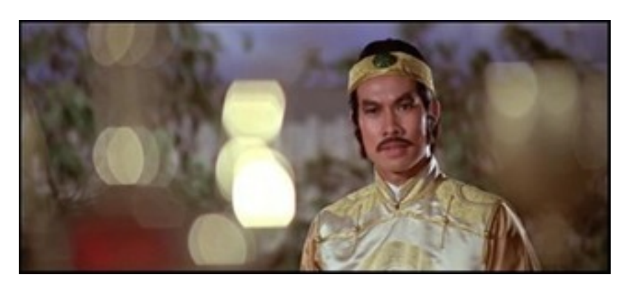
Figure 3: Long lenses used to create abstract forms in The Emperor and his Brother (1981)

as they step in and out of series of openings and sub-frames created by the space (fig.4) Chor Yuen preferred to shoot in the studio; for him, the constraints of the studio setting imposed fewer limits on his style, and allowed him to exert a complete control over the profilmic world, refashioning it to suit the needs of his personal aesthetic vision. From his early stylized melodramas to his reimagined New Style wuxia pian at Shaw, the pursuit of realism was never Chor Yuen's goal.