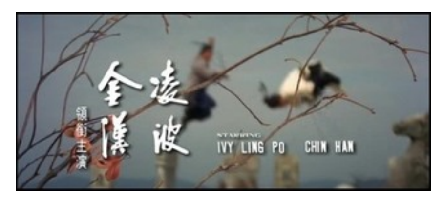
Figure 32: The opening flash-forward credit sequence in Duel for Gold (1971)