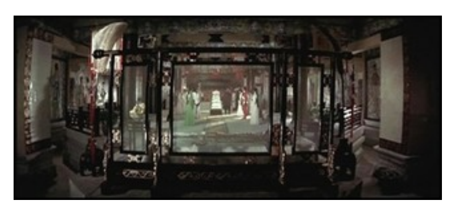
Figure 37: A moving painting. Magic Blade (1976)

Where Fu as the central hero is largely colourless in his simple black attire and grey poncho, Chor deploys colour through Magic Blade in either quick moody accents, or occasionally in bursts of splashy opulence. In the opening duel, when Yen draws his sword, he becomes drenched in an unnaturalistic and mystical red light (fig.38), expressing the semiotic linkages between the sword (the sign of the xia ) and the cycle of violence represented by this lifestyle. In other instances, yellow flowers and women in yellow dresses recur through the film to signal Fu's tragic-romantic past, and his regret for decisions made long ago. In the Peacock Mansion segment, the interiors feature elaborate, decorations flooded by stylized purple and green lighting. Chor's penchant for orientalist excess in this particular environment mixes with the unreal colour palette, highlighting the sense of fantasy. Peacock castle is also a space of mechanical traps, secret doors, and supernatural weaponry, including the Peacock Dart itself. This strange weapon consists of a fan of gilded, bejewelled peacock features, which when thrown can slay multiple enemies through magical explosions of coloured light and smoke. All