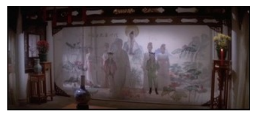
Figure 11: Images drawn with light on a screen within a screen in Murder Plot (1979)

graphically obstructing or intersecting forms into the picture plane is an observable technique used throughout his career, but it is perhaps especially notable in his swordplay films at Shaw in the late 1970s. <sup>82</sup> I would loosely classify these compositional devices along four interrelated categories: (1) the arrangement of diegetic elements within the frame to create structuring partitions, usually around characters, (2) the placement of elements around the boundaries of the screen space in order to create an 'inner frame' that encloses the onscreen space; (3) physical objects and obstructions placed in shallow space to create implicit barriers between the audience and the 'interior' space of the film, often obscuring the view of onscreen action; (4) the use of variable focus zoom lenses to push objects in the extreme foreground into blurred forms that eat up the image space, or super-impose themselves transparently over characters in the middle ground, creating a flattening or abstracting effect.