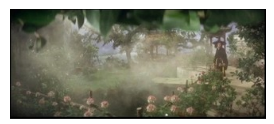
Figure 10: A compositional border on top and bottom encloses a xia in Perils of the Sentimental Swordsman (1982)

Some of this, of course, is part of the distinct conventional language that is so specific to the wuxia pian , and its array of quasi-magical skills. Even without constructive, elliptical editing, the weightless abilities of the xia create a new spatial anatomy of movement, via the convention of the wire-assisted or reverse-motion leaping escape. When a character leaves the space of the cinematic frame vertically in this way, they are simply gone, and generally no further attempts are made to pursue them. Few other generic forms allow characters, as a matter of course, to simply exit, stage up . Many of Chor's films will make almost egregious use of this convention in order to quickly move along their manic, fishtailing plots, twist-by-twist. In a film like The Murder Plot (1979), characters sometimes feel as if they are human yo-yos, due to the frequency with which they are literally dropped into and lifted out of the stage space. Characters who leave the frame, who travel off-stage, do not so much move through space, but effectively cease to exist, disrupting any illusion of a profilmic reality that extends beyond the bounds of the frame. Similarly, when characters travel between spaces and locations, they often seem to simply jump 'between stages' in the theatrical sense. Time is contained not only within the discrete unit of the