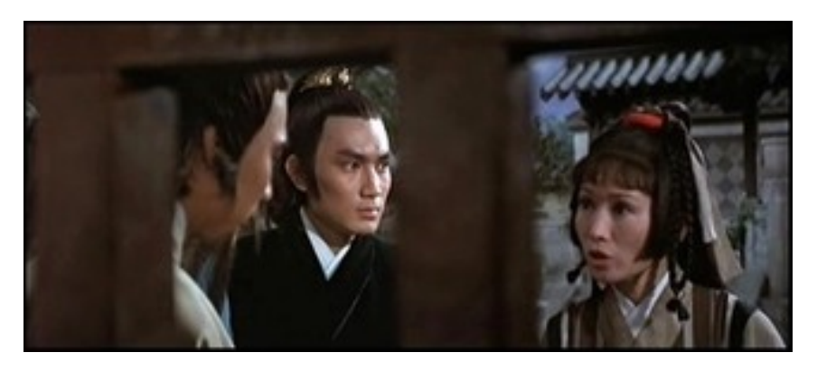
Figure 16: Geometric lattice structure to create apertures in the frame. Clan of Amazons (1978)

Another aspect of these compositions is the way in which they can disrupt the expected angles and perspectives of the shot-countershot editing pattern. While Chor relies mostly on the 180 degree system to construct dialogue scenes between his actors, departures from that convention can surprise the audience, reminding us that we are not in control of what we see, but are subject to the director's artistic whimsy. In these cases, it often seems as if Chor's camera eye lurks on the outside of conversations or action scenes, locating itself behind bushes, beneath chairs (fig.17) or gazing through painted screens (fig.18). The effect that this conveys is one of a peculiar voyeurism, as if the spectator is spying on the goings-on of the swordplay world from some hidden or removed location. This produces a brief rupture in the sense of suture, and a sense of uncertain subjectivity. We might well ask whose point-of-view we are experiencing.