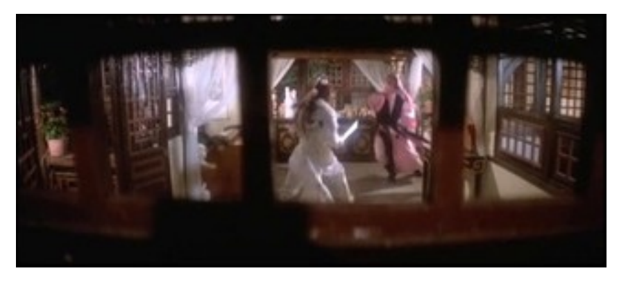
Figure 4: The camera tracks swordsmen through a series of geometric frames in Murder Plot (1979)

It is in the swordplay genre – invested as it is with both the stuff of a romantic cultural history and of shifting Chinese identity – that Chor Yuen's affinity for theatricality and formal self-reflexivity resonates most pointedly. Naturalism held little appeal for Chor's cinematic eye; instead he embraced the stage-bound necessities of the Shaw sets and costumes, and pushed the artificiality of this profilmic world forward in ways that unlock the emotional affect and