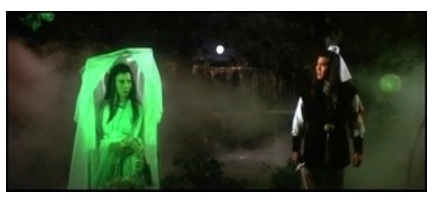
Figure 22: Colour contrast in Full Moon Scimitar (1979)