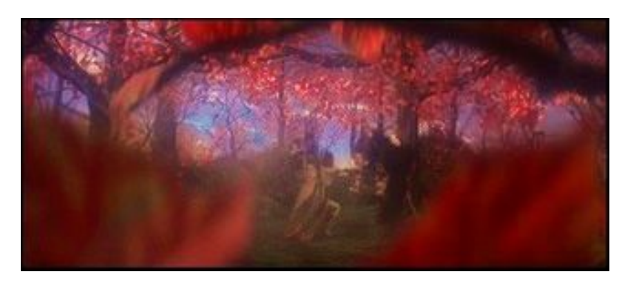
Figure 41: A swordfight caught between two immense maple leaves. Death Duel (1977)

well, but in the face of life's pragmatic concerns, acts of kindness by ordinary people are emphasized. When Ah Chi is found suffering on the streets with nothing to eat, it is another poor person who takes him in. Ah Chi later learns that this is also the home of the prostitute Hsiao, who uses her brothel money to sustain her family. There is no judgment within this unconventional family unit. Such transgressions against tradition are instead treated as quiet necessities in the real world, and 'love' is valued above propriety. Ah Chi asserts that he does not look down upon her either; "Poor people and the rich all have dignity." These scenes of simple emotional acceptance alternate with scenes of the jianghu society, which is drenched in opulence, yet obsessed with power and status, and engaged in deadly squabbles for dominance. Chivalry and honour, like the picturesque mirage of the film's wulin , is simply a lie the xia reflect back upon themselves.