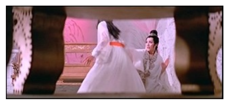
Figure 17: Slotted framing lurking from under a decorative stool. Clans of Intrigue (1977)