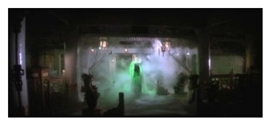
Figure 6: Supernatural colours and mysterious mists in Full Moon Scimitar (1979)

In his mise-en-scene, Chor liked to employ obscuring hazes of dry ice, stage-like presentations, and graphical interventions into the picture plane, all of which help to break down the world presented in his films into heightened self-reflexive or symbolic dimensions. In