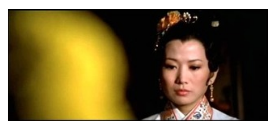
Figure 27: Swordsman and Enchantress (1978)

décor – the very stuff of Chor Yuen's artfully orientalist world – the painterly flowers, verdant leaves, and ornamental fixtures – into floating forms or hazes of coloured light, liquefying them into a raw, psychic, non-representational space around his actors (fig.27). In some sense, it performs a similar semiotic function to the swirling dry-ice fogs and coloured light gels employed by Chor Yuen in his construction of a fantastical, plastic, and inherently counterfeit environment. It underscores the dreamlike mutability of the world as a hallucinogenic token of Chineseness, inauthentic and therefore pliable to the needs of the viewer.