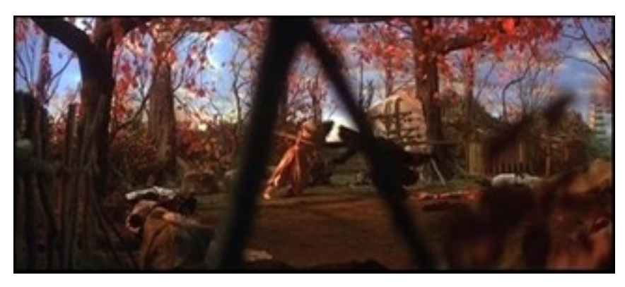
Figure 40: A triangular partition fragments the final battle in Death Duel (1977)