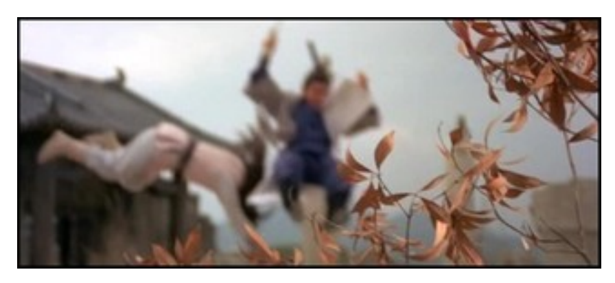
Figure 33: Shallow focus on foreground elements while a slow motion battle rages behind. Duel for Gold (1971)

Structurally, the very beginning of Duel for Gold is also the film's ending. Here Chor takes a page from his Cantonese productions like The Mad Woman, The Natural Son and The Joys and Sorrows of Youth , in which a narrator appears (typically Chor Yuen himself) to introduce the audience to the story about to be recounted onscreen. Here, the narrator is off-camera and speaks Mandarin, but the effect is the same. Surveying the aftermath of the battle half-shown during the opening sequence, the storyteller explains that the story has already finished, but that he would be happy to recount it to the viewers. While this device offsets the initial disorientation caused by the flashback structure and eases the audience into the narrative, it also performs a more subtle, subversive function. Through the reflexive presence of the storyteller, the fiction of the film itself is made all the more apparent, dethroning the sense of an authoritative voice and giving question to the presumption of historicity.