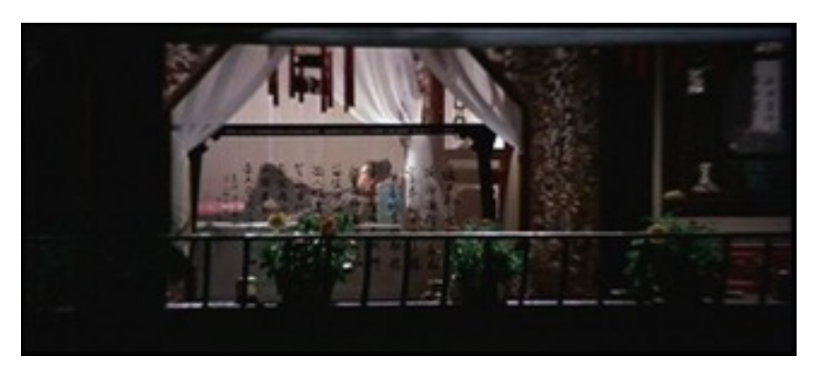
Figure 36: Mise-en-abyme framing through screens in Magic Blade (1976)