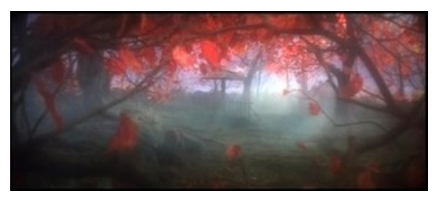
Figure 40: The misty world of the wulin in Death Duel ( 1977)

Structurally, the film is bookended by two duelling sequences that both occur in a fanciful grove, laden with boughs of scarlet leaves, and with hazy vistas of pagodas against pastel skies that are visible beyond the trees. This is a place where the accounts of the jianghu are settled, and where lavishly-attired swordsmen seem to appear and disappear at will like figures out of a fairy tale. This recurrent setting becomes a reification of the abstract concept of the wulin – the 'martial forest' – as an autumnal time-lost orchard, locked into a perpetual sunset ambience (fig.41), a place with "no seasons, no nationality, and no concrete history." This evokes a reverie that is more fantasy than memory, a beautiful orientalist hallucination of a Chinese cultural past in saturated and unchanging terms. The intense artificiality of this space forms a binary opposition with the muted tones and relative banality of the 'real' world Ah Chi inhabits while living among the common people. The wulin instead seems to exist just beyond the veil of quotidian life. While its world is alluring and sensual, it is also a patently false construction, where romantic beauty only conceals treachery, spite, and false ideals that drive men to empty glory.