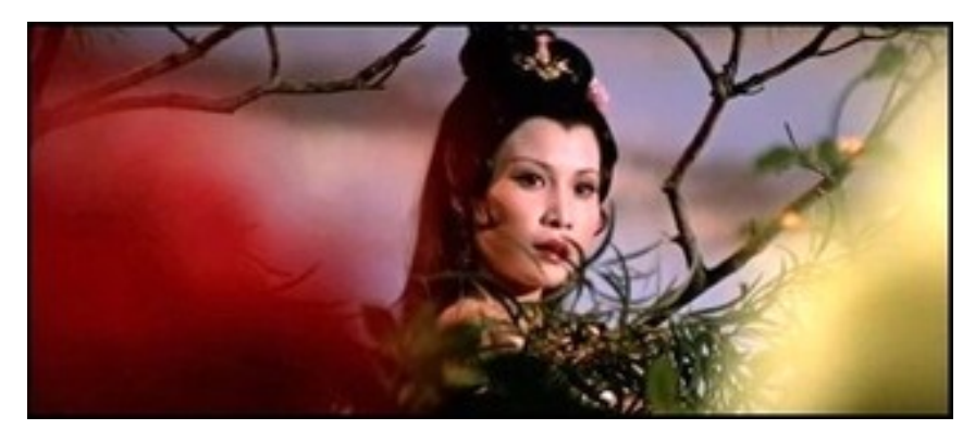
Figure 25: Abstract colour fields in Swordsman and Enchantress (1978)