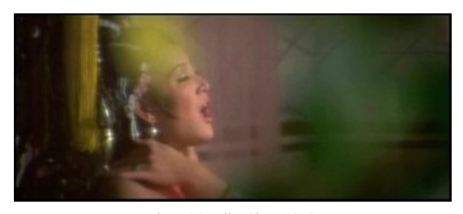
Figure 26: Killer Clans (1976)

Not quite satisfied with simply using décor to intrude into the picture plane, Chor Yuen often pushed the rack-focus shot beyond its logical limit, casting foreground objects (often colourful items such as flowers) against close-ups of his actors with such a shallow depth of field, that the resulting distortion and blurring of the foreground reached an ultimate and abstract diffusion. The result of this technique transforms objects into colour fields that occupy frame space (fig.25). Alternately, it can be used to create a semi-translucent colour effect that seems to rest on top of the image, flattening depth and tinting his subjects (fig.26). This leads to a compositional restructuring of the frame, forcing Chor's actors into the abstract psychological spaces defined by these colourful 'auras'. Like the mise-en-abyme discussed above, this amorphous colour aura can intensify our attention towards the actors in the shot, while also adding an additional degree of compositional dynamism to an otherwise conventional close-up shot. I suggest that, in keeping with Chor's self-reflexive style, this creates a formal void, or another 'screen', which can flatten space, obscure faces, or interrupt the naturalist reading of the screen space with the play of expressionist colour. This technique effectively turns material