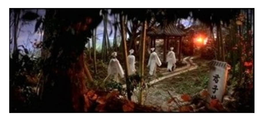
Figure 28: Swordsman and Enchantress (1978)

Chor Yuen frequently constructs his frames in terms of visual obstructions, relying upon natural, ornamental, or architectural forms that speak of a sensuous, opulent Orient, a 'land of many perfumes'. Rosalind Galt observed that, "the Orient, like the feminine, is associated with an excess of pleasure in material things, particularly decorative, sensual, pretty things" (Galt 145). Our view is often occluded by those objects that are seen to be most reminiscent of a mythical or historical China. In one sense, this suggests a primacy of Chinese cultural sentiment, an injection of 'oriental flavour' into his images. At the same time, the reflexive qualities of Chor Yuen's style, and the environs he constructs, perform a self-conscious act of modernist interruption. One cannot insert themselves into the filmic world, because the way is always blocked, reinforcing the barrier between reality and fantasy. The culturalist dream-as-landscape contains and constricts the characters and the narrative, and reinforces their value as signs.