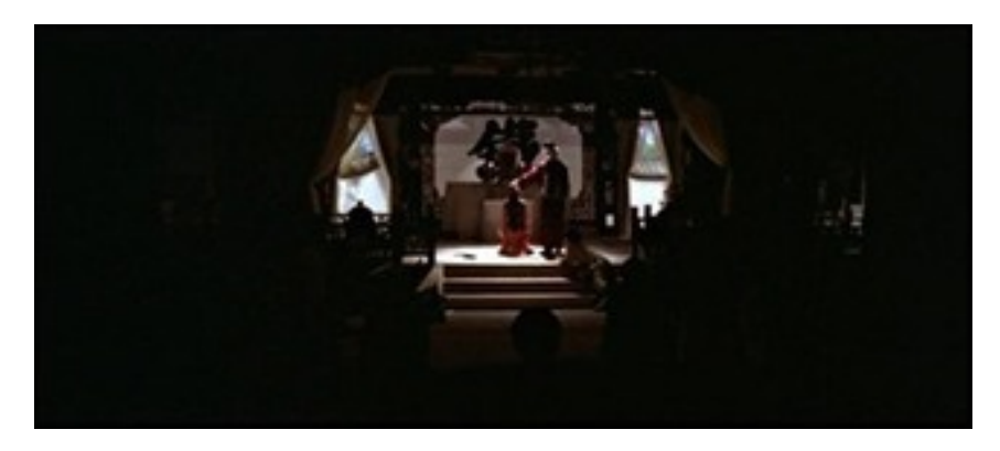
Figure 8: ... the house lights go down, and the moment of violence is illuminated in a theatrical spotlight.

Play-acted scenarios – performances within performances – may also intrude into Chor's diegetic worlds, often in jarring or discordant ways that lay bare the contrivances of the film. Heroes Shed No Tears (1980) features a scene wherein a famed beauty gives a prolonged dance performance at a jianghu gathering, featuring spotlights, dry ice, and discotheque-like colours that create a dissonance between the conceit of the presentation and the historical setting (fig.9). Another variation of the stage-managed performance theme occurs in Full Moon Scimitar (1979), when the hero Ding finds a sultry woman in an unlikely forest location, complete with her own performance space; a lush, fully furnished pavilion. After being seduced, he awakes to find not only that the girl has gone, but that the entire pavilion has been stripped bare, leaving him alone on an empty stage-like platform. Other times, these performances take the form of performative ruses the spectator is not made aware of until later in the film. In another example from Full Moon Scimitar , Ching Ching, the 'magical fox-wife of Ding, initiates an extensive subplot by tricking Ding's enemy into believing his house is haunted. The charade is seemingly disrupted by the appearance of another fox-woman (Ching Ching's vengeful sister), who helps the man