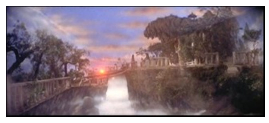
Figure 29: Heroes Shed No Tears (1980)