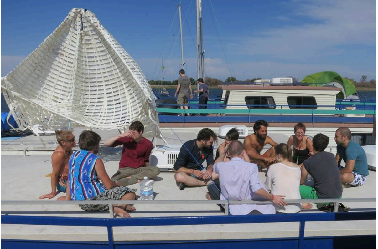
Figure 11.