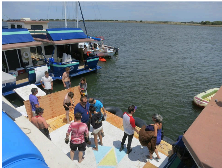
Figure 12.