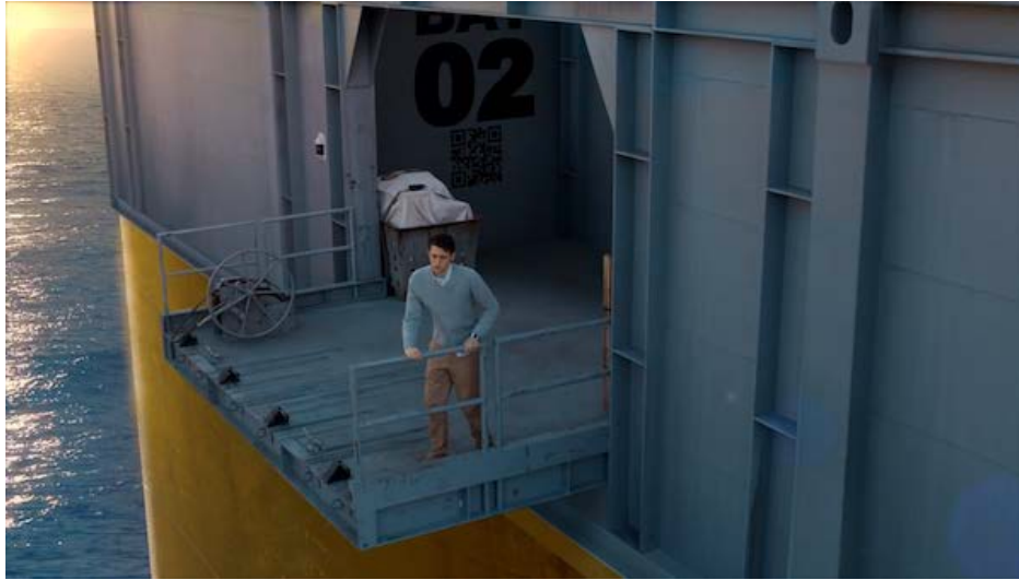
Figure 4. A character from the television series Silicon Valley (2014) castaway on a seastead.

Atkinson and Blandy suggest that the possibility to purchase a lifestyle without being weighed down with property and responsibility “exemplifies a new dimension of mobility which is accompanied by a different and complex relationship to the control of territory” (p.104). The pitch line of The World is “Travel the world without leaving home.” For those who transcend political borders and financial regulations, there is less a need to own a particular fixed place since their home has become the globalized world. It is the ability to create or extract value from the world that bestows upon them a sense of ownership or of entitlement. This is illustrated in a passage in Atlas Shrugged where Dagny Taggart, the main protagonist, reflects on Hank Rearden, a successful businessman and her lover: