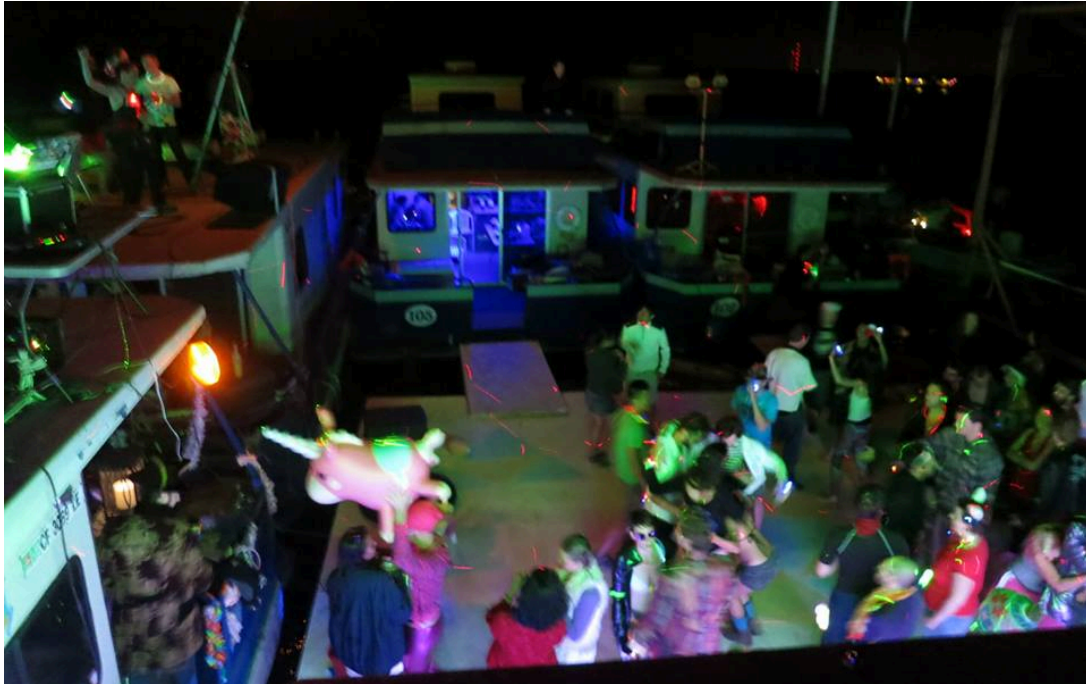
Figure 9.