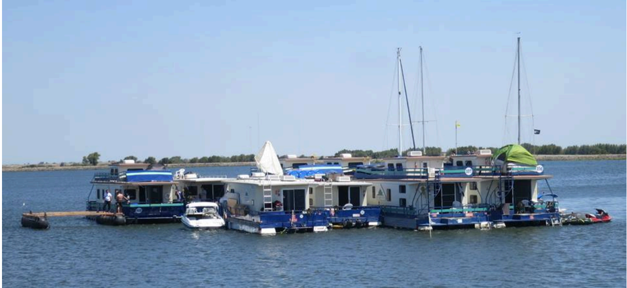
Figure 5. Arrival at Titan Island.

reading, a culinary contest, and a meditation platform, one of the most popular art work that year. Like at Burning Man, Ephemerisle participants create impressive art work.