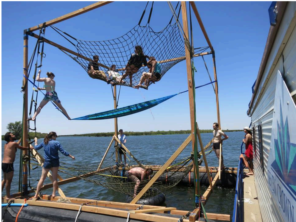
Figure 6. The cube ship, built and dismantled on site.