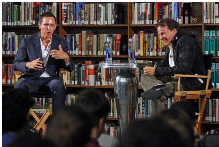
Figure 1. Peter Thiel and David Graeber debating technology and the future