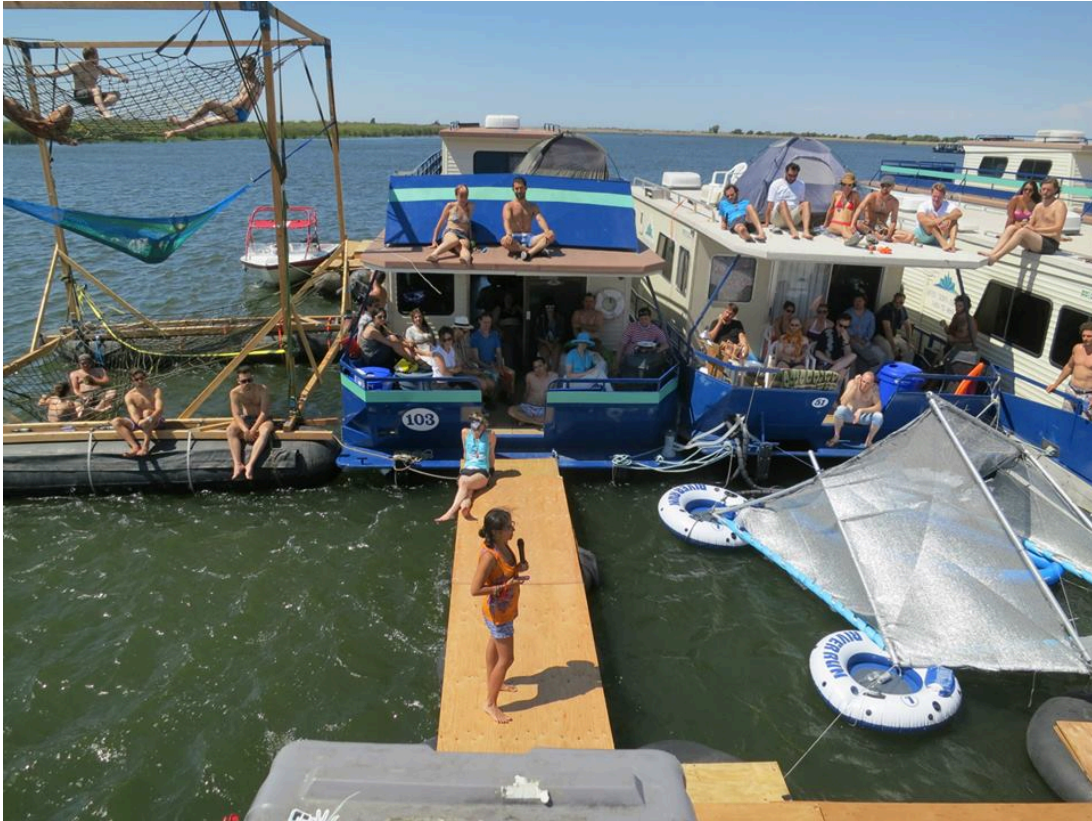
Figure 7. Memocracy speaker and audience.