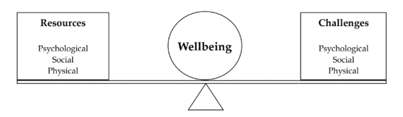
Figure 1 Definition of well-being (Dodge et al., 2002, p.230).