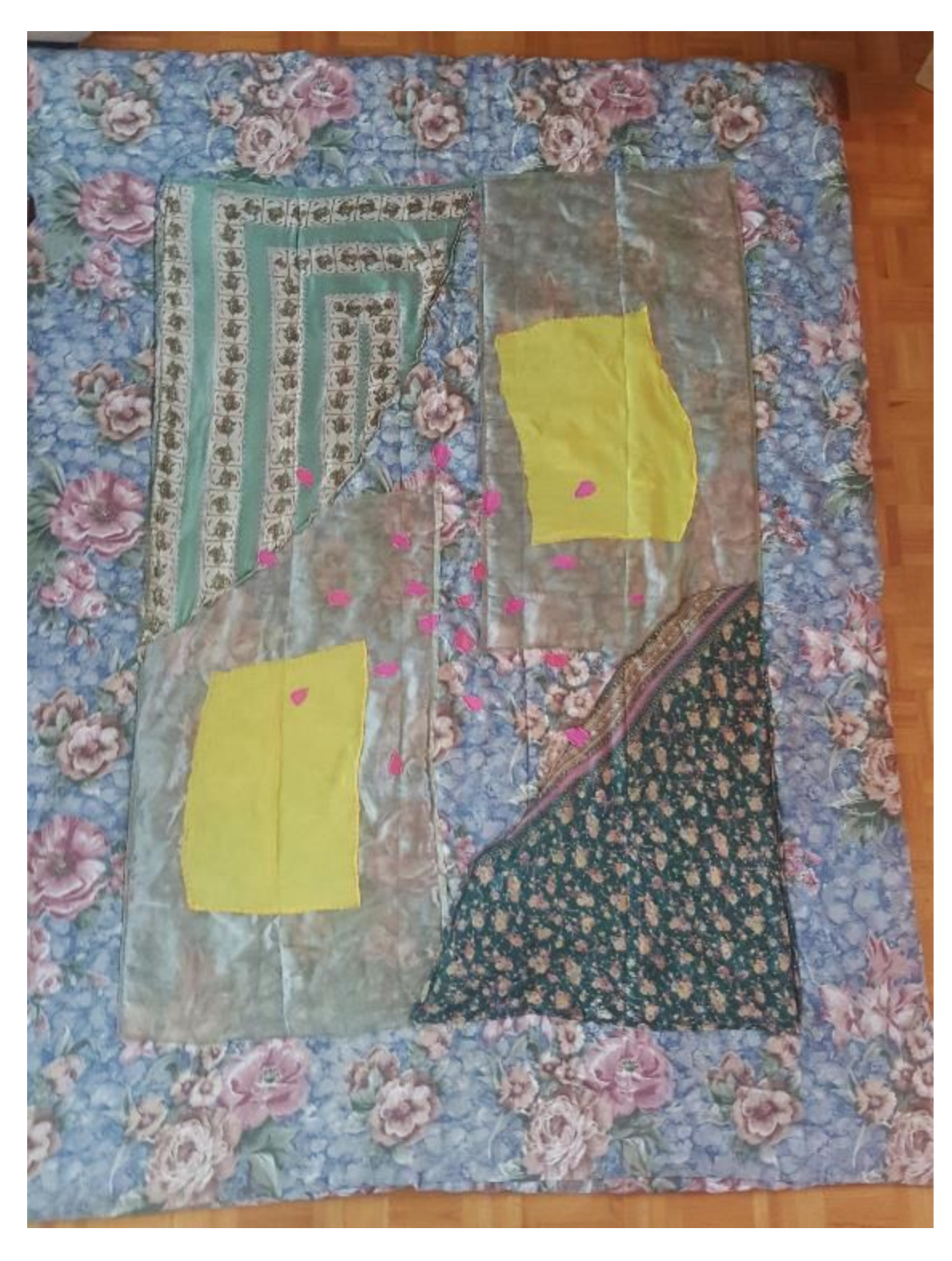
Figure 2. Untitled, 2016. Quilt produced as arts-based inquiry.