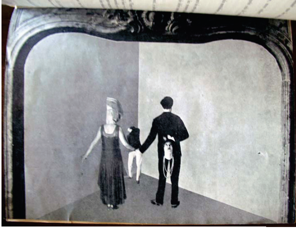
Fig 2. Alfred Jarry Theatre photomontage from Eli Lotar; “Le Theatre Alfred Jarry de l’Hostilite Publique”; Graphic Arts ; Princeton University Library; 12 April 2017, http://blogs.princeton.edu/graphicarts/2010/07/le_theatre_alfred_jarry_de_lho.html

He wrote that this play represented an ideal with the capacity to reveal “a certain truth that inhabits the deepest strata of the mind” (Sontag 163). Here they clarified that the theatrical reality they wished to present lay halfway between life and dreams as opposed to competing with life (Sontag 163). They relied on real properties, as well as vocal and lighting effects, with the “function of a new spiritual order given to the