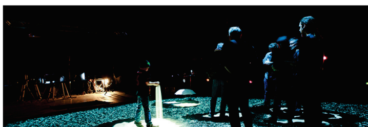
Fig. 5. “Einstein’s Dream” 2010-2013; Topological Media Lab ; Concordia University Montreal; 12 April 2017. http://topologicalmedialab.net/research/movement-and-gesture/media-choreography/einsteins-dream/