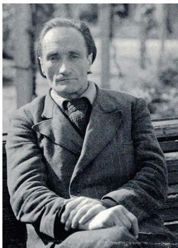
Fig. 6. Antonin Artaud at the Rodez asylum; "Antonin Artaud: The asylums and after"; Jacket 2 ; 12 April 2017, http://jacket2.org/commentary/antonin-artaud-asylums-and-after

Sass contends that the schizoid personality epitomizes what was distinctive about cultural movements in Modernism. If we consider the trajectory of its Postmodernism offspring as upon that continuum, where an intense hyper-reflexive focus upon the self is both subject and the object of experience, is the symptomology of schizophrenia also emblematic of our times (Sass 29, 90)? In fact, in as early as 1968 Grotowski declared: "Civilisation is sick with schizophrenia, which is a rupture between intelligence and feeling, body and soul" (Grotowski 63). Franco