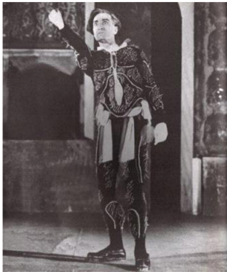
Fig. 4. Antonin Artaud in "Les Cenci", 1935; "Artaud ce Môme"; VEF Blog ; 12 April 2017, http://artaud.vefblog.net/10.html

The first and only opportunity the artist had to attempt his theatre of cruelty was in the