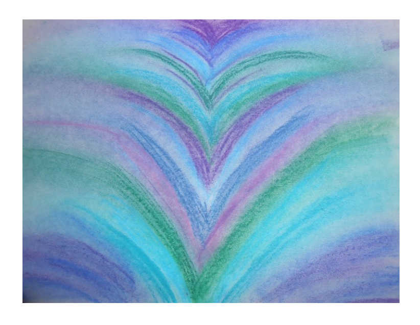
Trust . Feb, 2017