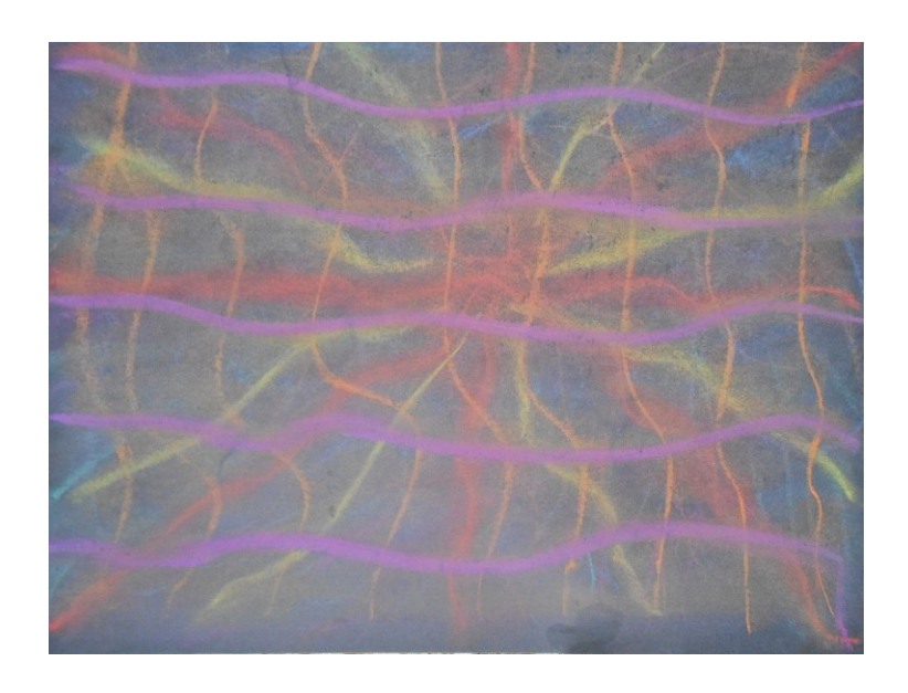
Confusion. Feb, 2017