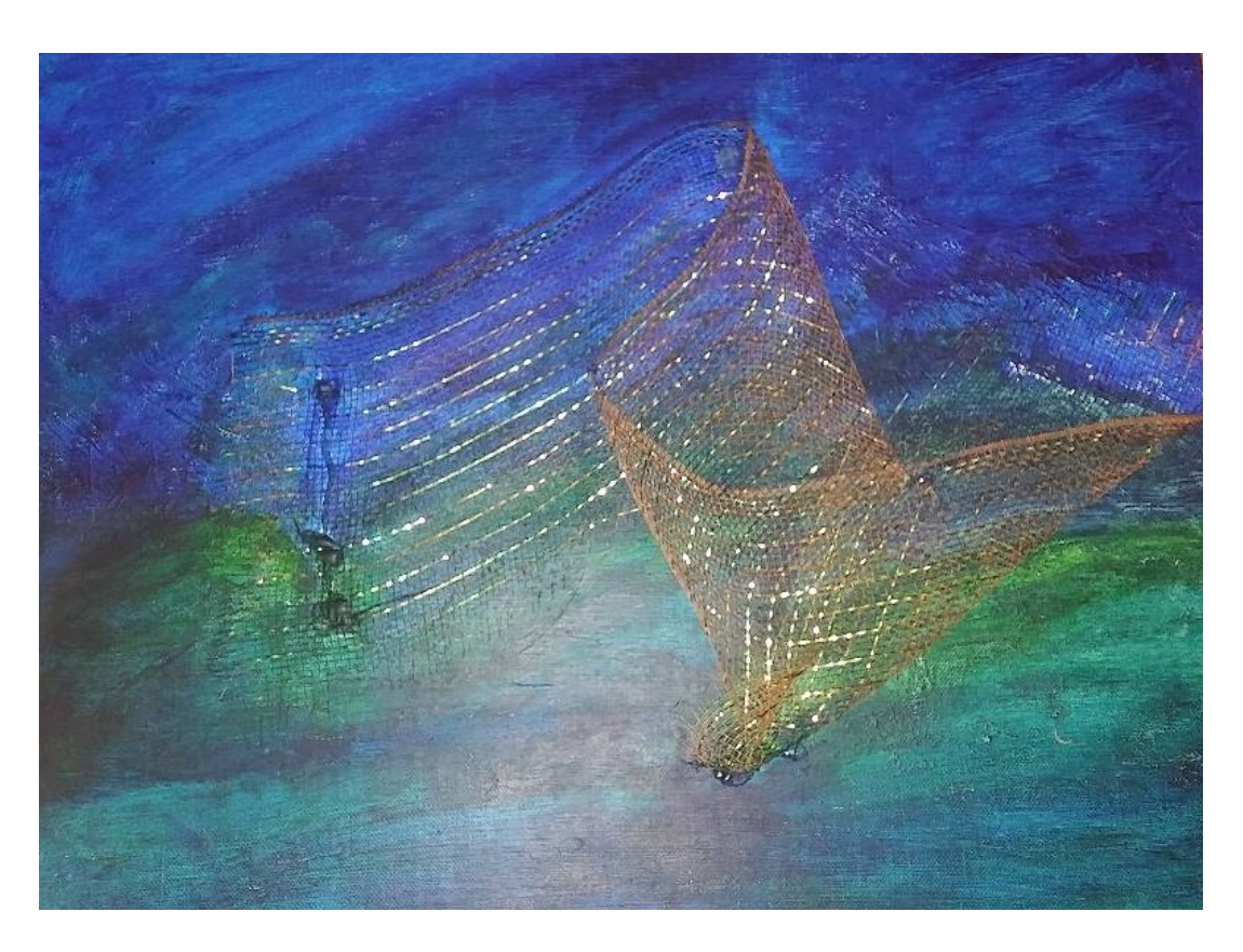
Vulnerability. Dec, 2016