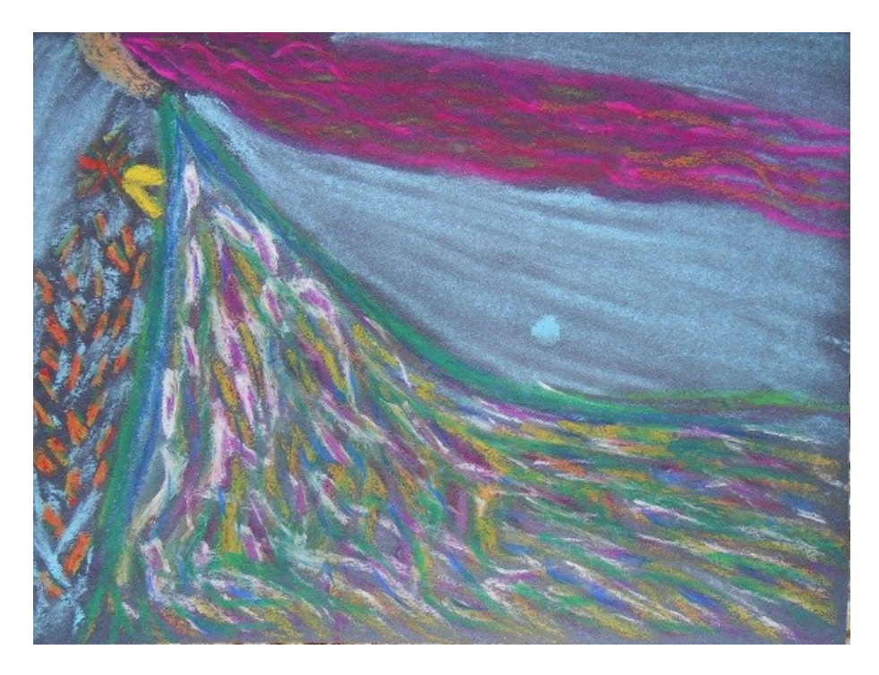
- Everything will be fine. April, 2017