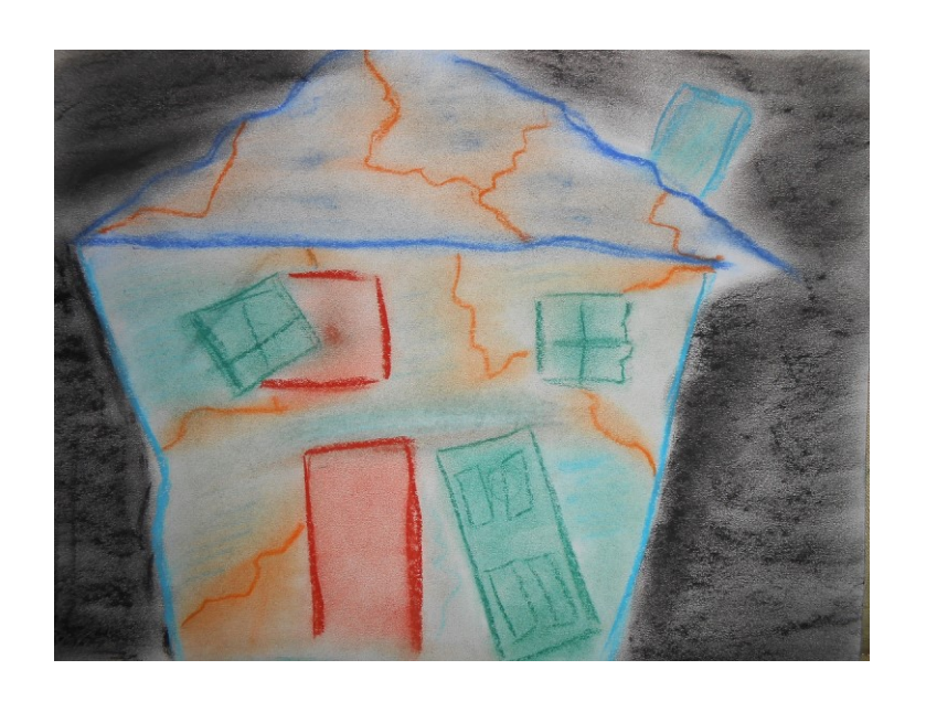
Fear. Feb, 2017