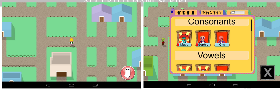
Figure 2 – Navigation and ‘Ghostbook’ Design

2a: The player can identify characters through the map and click on them to access individual mini games