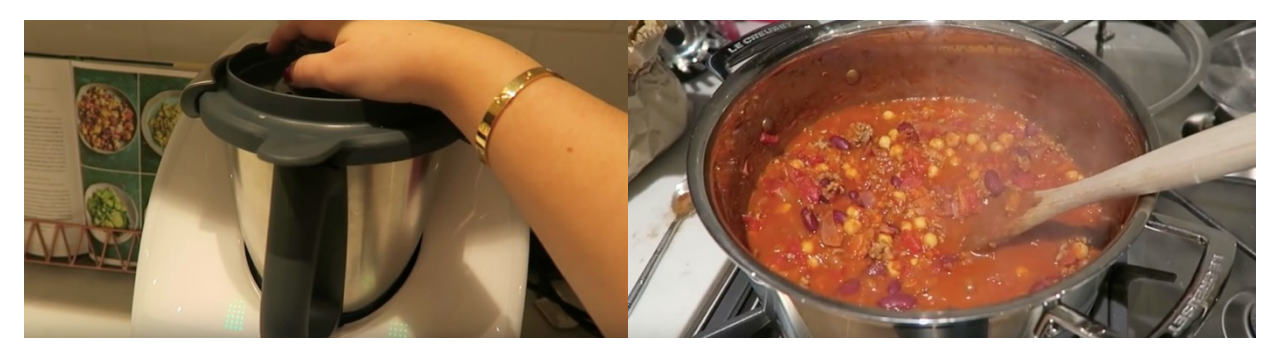
FIGURE 5: Screenshot: Cooking dinner for husband Tanya Burr, March 22, 2017, https://www.youtube.com/watch?v=3bvU7iESE7o&t=2s

Tolson (2010) notes that there are many qualities in YouTubers' video presentations that make them ordinary, these are the setting where the video is filmed (often home), the way they talk, spontaneity in speech, how they describe themselves to the public and not trying to hide flaws in presentation but rather explaining to followers why there is a flaw. These elements are very present in my data as well, ("[...] slap that bitch on and you'll be good to go [...]" Jaclyn Hill