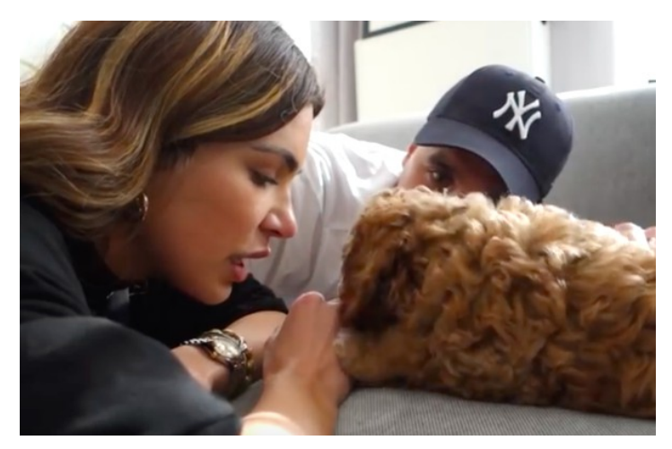
FIGURE 4: Screenshot: Hanging out with dog and family Negin Mirsalehi, May 12, 2017, https://www.youtube.com/watch?v= fouZYrrhR8

According to Kowalczyk and Pounders study (2016), celebrities sharing everyday situations makes them seem more relatable and authentic. This is a very normal element in vlogging as many of the vloggers do daily or weekly vlogs where they go about their normal lives, filming their normal activities (for instance hanging out with dog and family, Negin Mirsalehi May 12, 2017; cooking dinner for husband, Tanya Burr, March 22, 2017)