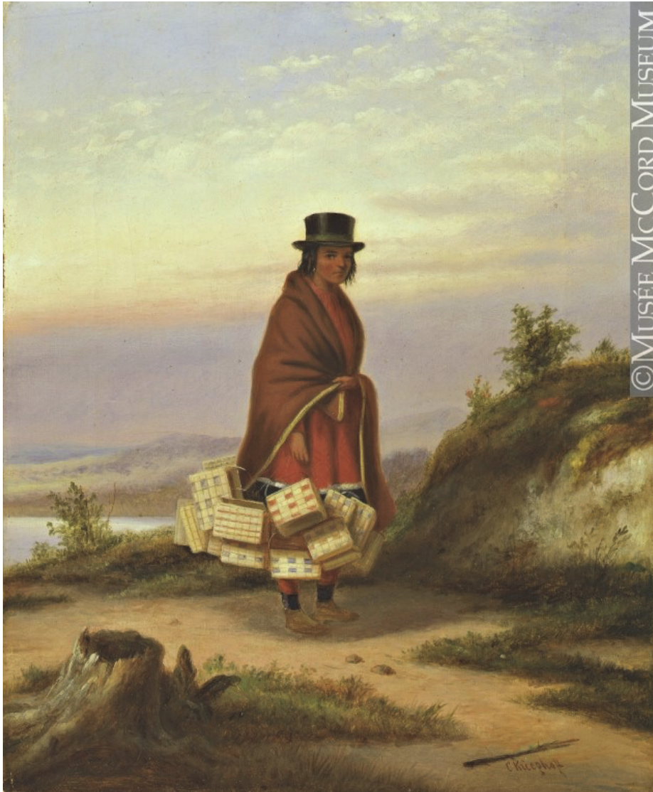
Figure 4: Cornelius Krieghoff, Iroquois Woman from Kahnawà:ke , 1847-1852, Oil on canvas, 28 x 23.1 cm, McCord Museum.