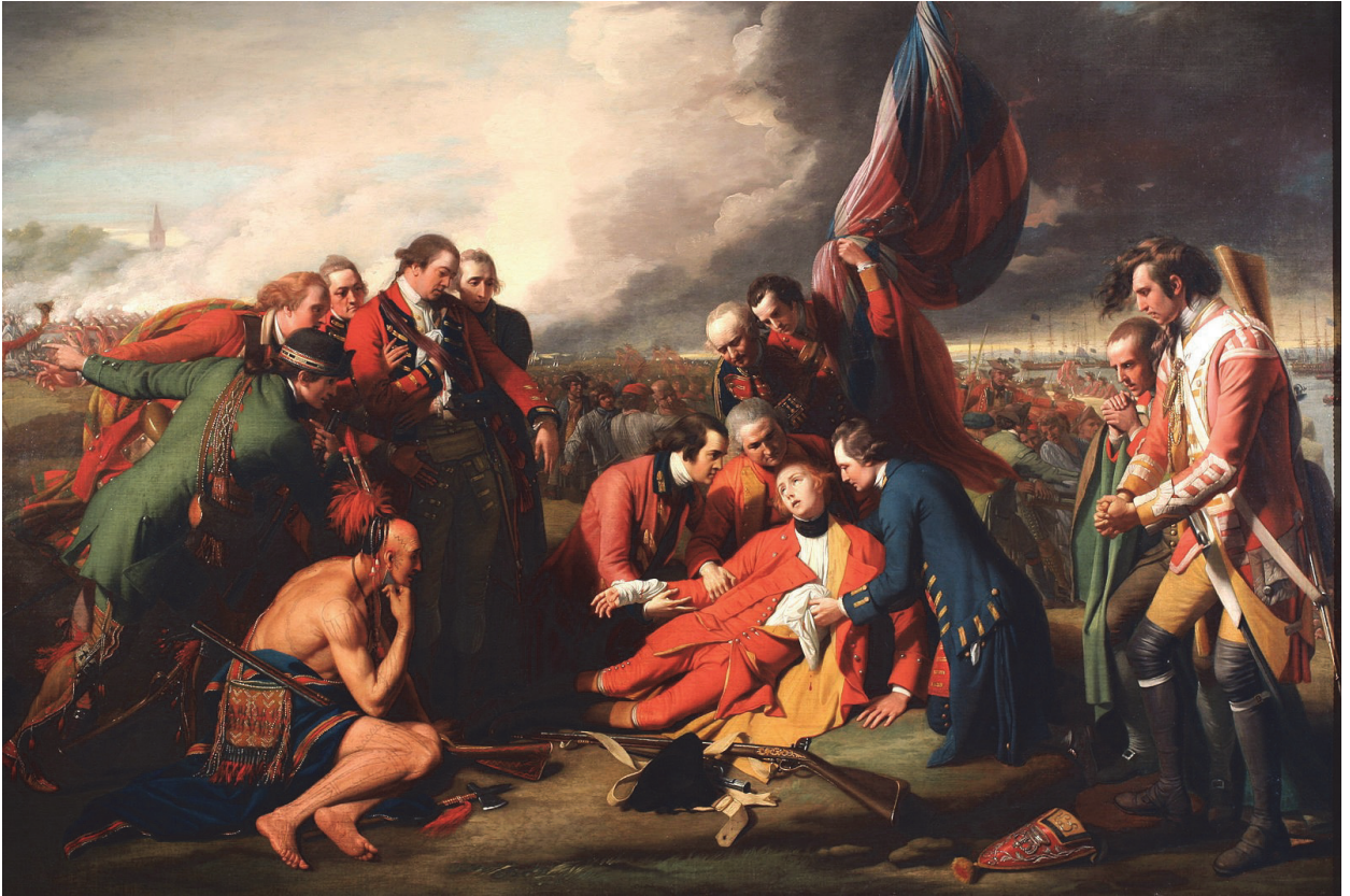
Figure 5: Benjamin West, The Death of General Wolfe , 1770, Oil on canvas, 151 x 213 cm, National Gallery of Canada.