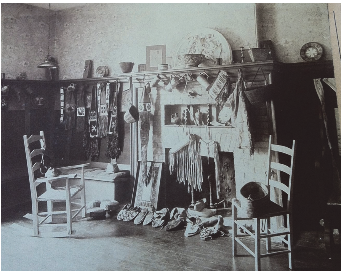
Figure 2: “Indian Work at the Women’s Art Association Exhibition in Montreal. 4 Phillips Square, Remembrance Court, 1902. A photograph showing fringed leather jackets, beaded purses, regalia and sashes... the interesting exhibit of work carried out by Indian squaws in remote parts of the Dominion.”

Archives of the Canadian Guild of Crafts, C4 D1 001 1902, “Indian Work at the Women’s Art Association Exhibition in Montreal,” The Studio , October 1902. Above quote taken from newspaper clipping attached to back of photograph.