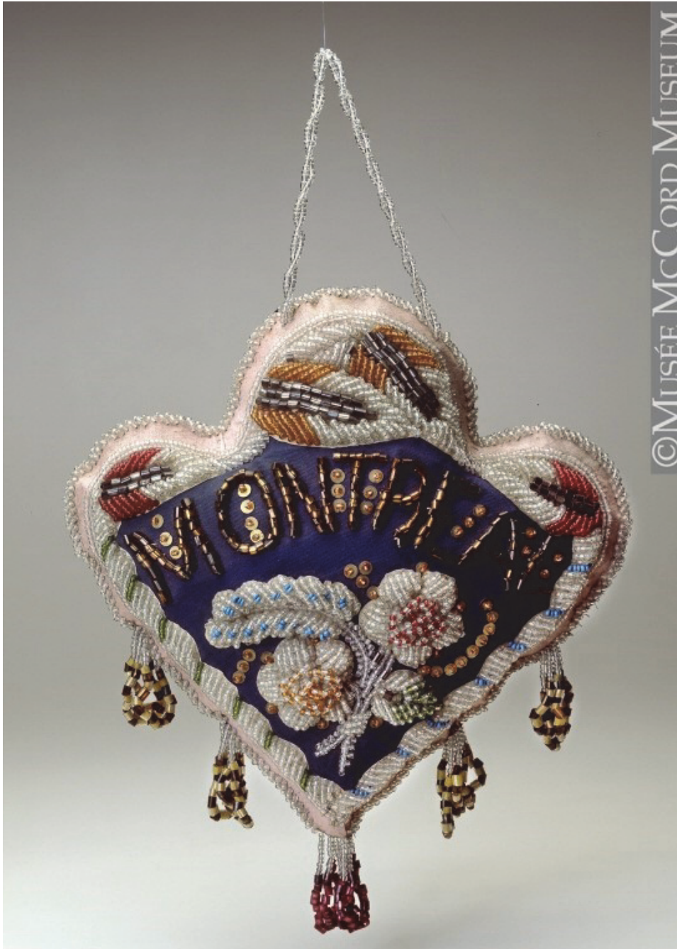
Figure 3: Anonymous artist, Pincushion.

McCord Museum, Eastern Woodlands Aboriginal: Iroquois, Mohawk, 1865-1900, nineteenth century, Cotton cloth, glazed cotton cloth, glass beads, paper, metal sequins, wood (sawdust), cotton thread, 27 x 30.5 cm.