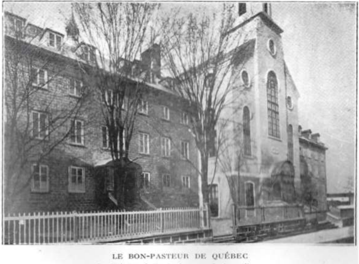
tel qu'édifié par la Fondatrice — rue Lachevrotière — (1855) le monastère — (1866) l'église — (1876) le refuge sainte-madeleine