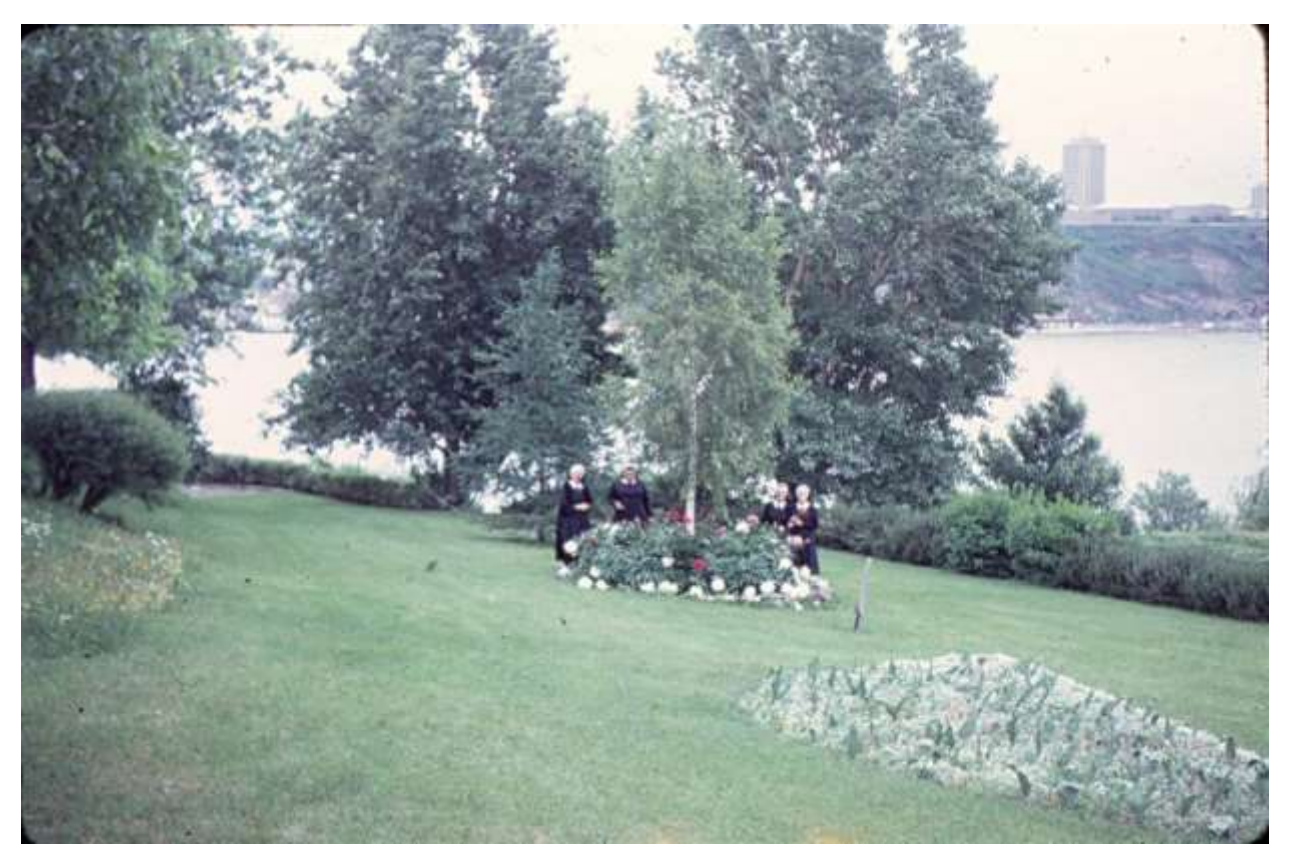
Figure 9. Oblates of Mary in the garden between 1978 and 1983. From: "Groupe d'Oblates dans le grand jardin de l'ancien monastère du Précieux-Sang de Lévis- Entre 1978 et 1983," in Sisters of the Good Shepherd of Quebec, "Les vies cachées de la Maison Béthanie, " Musée virtuel du Bon-Pasteur : Histoire de chez nous. Web.