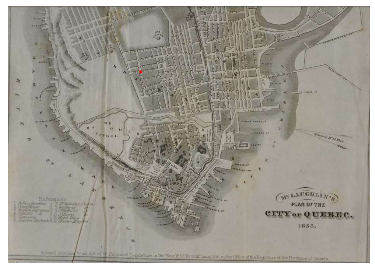
Figure 1. Map of Quebec, 1855. The red dot (added by the author) indicates corner La Chevrotière and Sainte-Amable in Saint-Louis district. From: S. McLaughlin, "McLaughlin's Plan of the City of Quebec. 1855," in McLaughlin's Quebec Directory , (Quebec: Bureau & Marcotte, 1855), n.p.