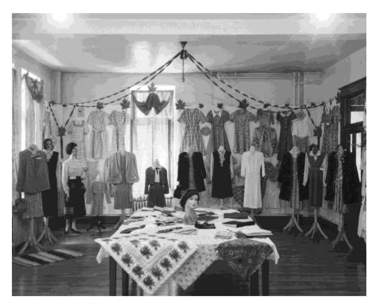
Figure 7. Art exhibition in Maison Sainte-Madeleine in 1949. From: Neuville Bazin, Exposition d'art domestique à la Maison Sainte-Madeleine les 17 et 18 juin 1949. Quebec: Neuville Bazin, 1949. BAnQ.