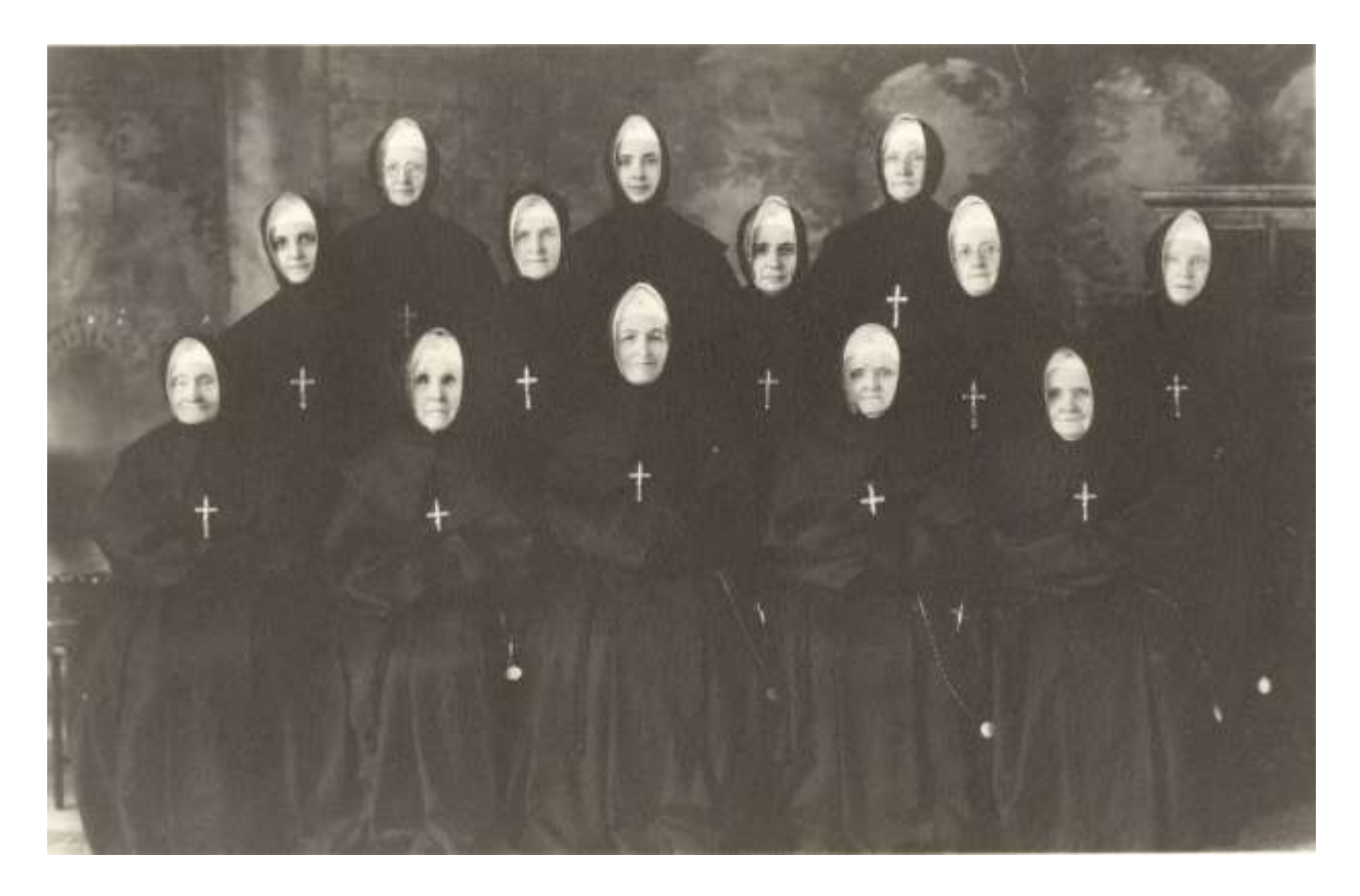
Figure 2. The first Magdalens in Maison de Bethanie. From: "Premières recluses de la Maison Béthanie, s.d.," in Musée du Bon-Pasteur, "Les vies cachées de la Maison Béthanie, " Musée virtuel du Bon-Pasteur : Histoire de chez nous . Web.