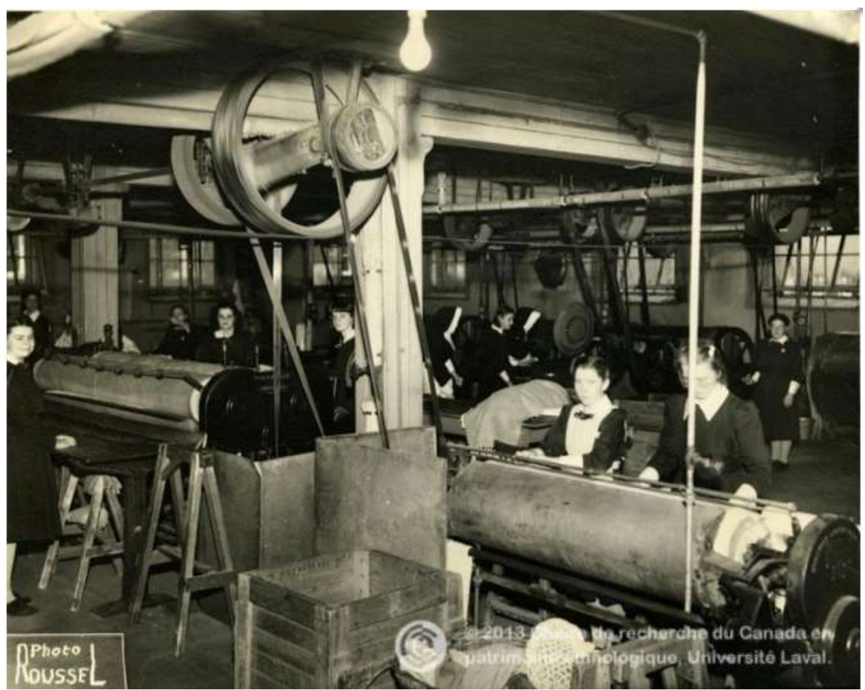
Figure 8. Buanderie Saint-Joseph in the mid-twentieth century. "Repasserie de la Buanderie Saint-Joseph,", s.d. from "Buanderie," in Sœur Sainte-Henriette, Centenaire au Bon-Pasteur , n.p. Reproduced in "L'œuvre auprès des jeunes délinquantes à la Maison Marie-Fitzbach," In Le patrimoine immatériel religieux du Québec . Web.