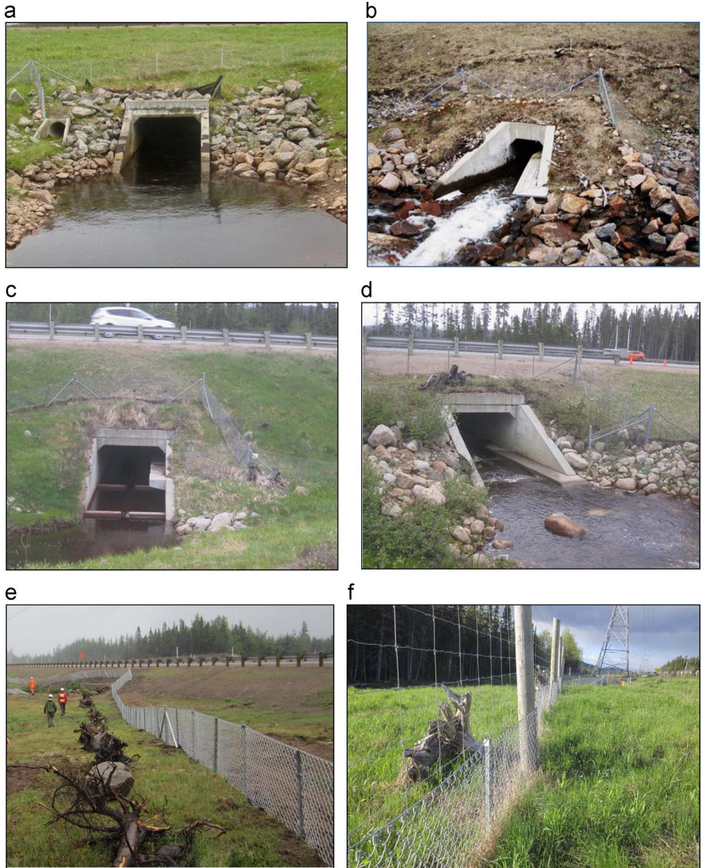
Fig. 2. The four types of wildlife underpasses designed for small and medium-sized mammals and the two types of fences along Highway 175: (a) pipe culvert or round concrete culvert (on the left next to the water culvert; n = 6 ), (b) box culvert with a wooden ledge ( n = 4 ), (c) box culvert with a concrete ledge ( n = 7 ), (d) box culvert with a concrete walkway ( n = 1 ), (e) fence for medium-sized mammals, and (f) combined fencing for large mammals (upper half) and medium-sized mammals (lower half).