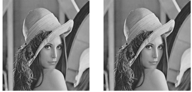
Figure 3. (a) Original image and (b) Watermarked image.

chosen in the DCT matrix according to the locations of the most significant DCT coefficients of the original image signal and by adjusting the embedding strength according to the DC coefficient. The algorithm is computationally simple because it extracts the needed gray level characteristics directly from the DCT coefficients without extra processes. Simulation results have shown that the algorithm provides high visual quality and excellent robustness against lossy JPEG compression even at low quality factors. In addition to the high performance in these usually conflicting aspects, the computational simplicity of the algorithm makes it useful in real-time applications.