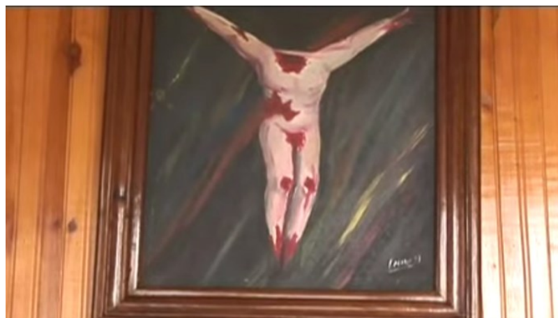
Figure 8. Tiberio Fernandez Torso, Oil painting. [Screenshot]. (Contravía TV, 2010)