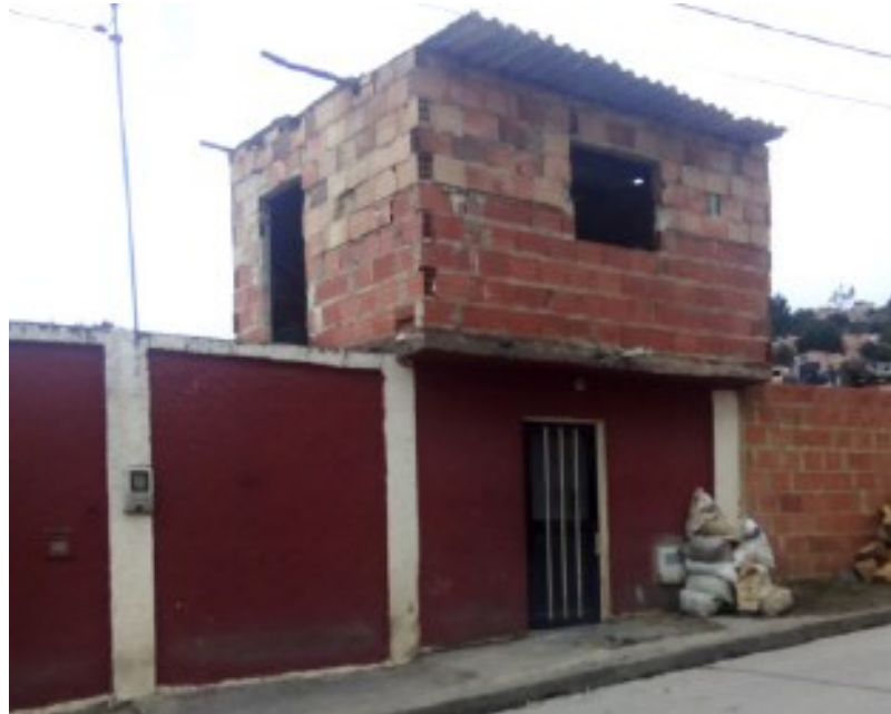
Figure 11. House in “San Isidro – Patios” Bogotá. [Screenshot]. (Rosas, 2018)