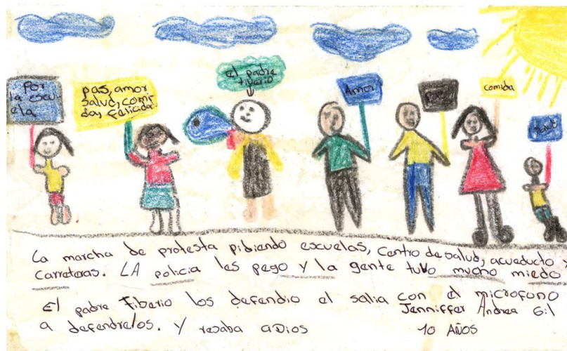
Figure 7. “Tiberio Vive Hoy” Book’s Drawing. [Screenshot]. Citizens of Trujillo (2003)

The Trujillo Memorial Park is a vital space of identity, where the community meets to create emotional bonds by holding parties, trips, pilgrimages, workshops, meetings or simply having daily conversations; a place where art and creativity are central tools to help the survivors in processing their pain and thus, in continuing with their arduous denouncing process (Garzón, 2019).