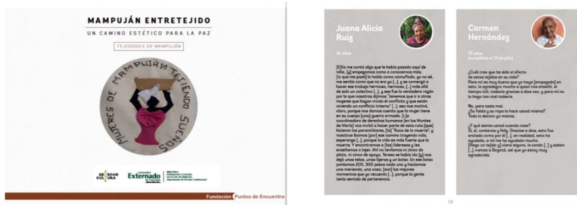
Figure 13. “Mampujan Entretejido” Catalog of Mampujan Weavers Exhibit at the Externado University Pages 1 and 59. (Universidad Externado de Colombia, 2016)

I want to draw attention to the power of the exhibition of the Weavers of Mampuján at the Externado University of Colombia and the pedagogic material captured within it. The catalog of this exhibition (Universidad Externado de Colombia, 2016) impressed me with its ability to collect evidence of the impact that this exhibit had on the visitors (Figures 13 & 14).