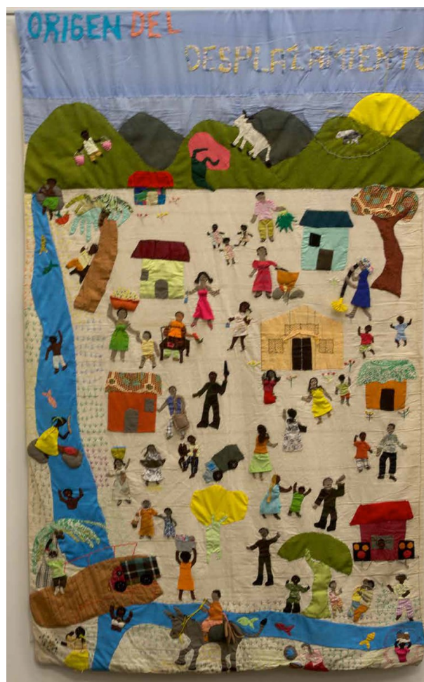
Figure 1. Mampujan’s Tapestry. [Screenshot]. Universidad Externado de Colombia (2016)

Weary of the situation, women of Mampuján got together to talk and think about ways to overcome their circumstances and work towards peace; they decided to ask for help from local religious organizations for their psychosocial recovery (Ruiz, 2017). The Mennonites who happened to work in this region, contacted Teresa Geiser, a psychologist who had recently been serving in similar circumstances in El Salvador (Universidad Externado de Colombia, 2016; Shepard, 2019). Between 2002 and 2004, Geiser taught the women of Mampuján, strategies to overcome trauma and increase resilience through quilting (Ruiz, 2017; Shepard, 2019).