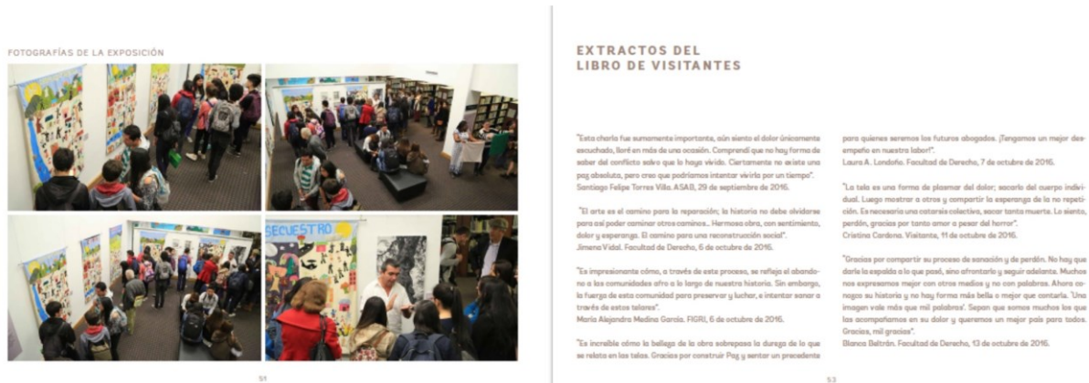
Figure 14. “Mampujan Entretejido” Catalog of Mampujan Weavers Exhibit at the Externado University, Pages 51 and 53. (Universidad Externado de Colombia, 2016)

I would risk to say that artistic mediation in museum spaces, helps to close the cycle of reconstruction of the social fabric at a macro level by enhancing the impact of the artwork on people through education. Strategies such as talks and exhibit catalogs allow the wealthy visitors in the capital of the country to empathetically connect with the women from the countryside of the north coast of Colombia.