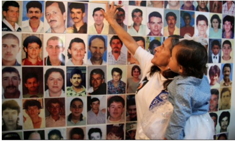
Figure 9. “Salón del nunca más”. [Screenshot]. (Vásquez, 2017)