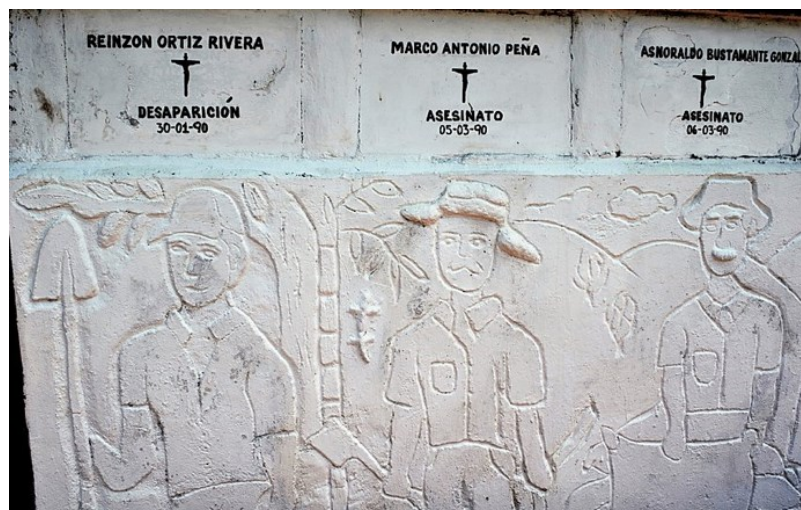
Figure 5. Ossuaries with carving. [Screenshot].