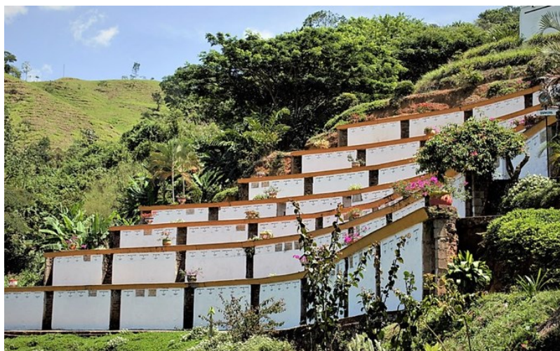
Figure 4. Trujillo Park Ossuaries. [Screenshot]. (Rubiano, C., 2017)

These ossuaries were made in collaboration with a plastic artist, who proposed to make carving sculptures (Figure 5) that represented symbolically the life of the victims who died in the massacre (Garzón, 2019). These burial area is particularly attractive because, for Garzón (2019), it: (a) Allows family members, who lack the physical body of their loved ones, to use the symbols in the monument as cathartic and liberating referents for a proper grieving process; and (b) The exercise of re-presenting their loved ones, allows family members to restore their dignity since they were killed based on false versions of their lives, which were used by the perpetrators to justify their actions (Garzón, 2019).