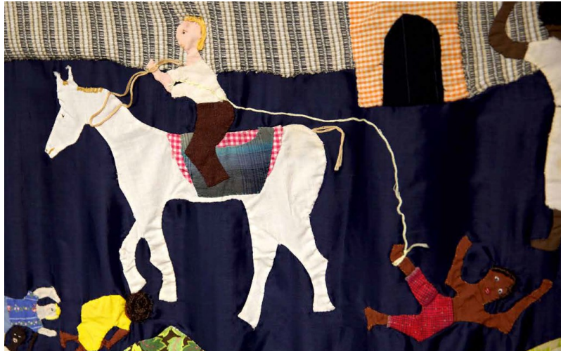
Figure 2. Tapestry Detail. [Screenshot]. Universidad Externado de Colombia (2016)

and publicize their works by exhibiting their art in many different countries (Universidad Externado de Colombia, 2016). This result was particularly timely because of the warnings they were receiving to keep their work quiet if they didn't want to become a military target (Universidad Externado de Colombia, 2016).