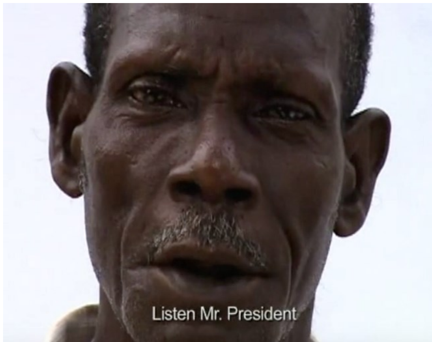
Figure 3. Mouths of Ash. [Screenshot]. Echavarría (2011)

Colombia. “Bocas de Ceniza” [Mouths of Ash], is a video art installation of the same artist, that is part of the Latin American collection of the Museum of Modern Art in New York (MoMa) (Museum of Modern Art, 2020), whose title refers to the geographical point of junction of the Magdalena River and the Colombian Sea (Rubiano, 2019). This video gathers a capella testimonial chants of victims of different Colombian massacres, along with close-ups of their faces over a white background (Figure 3). With this format, Echavarría manages to exhibit these difficult and diverse Colombian realities in museum halls and galleries, such as the MoMa, delivering their message to more people than their authors could ever imagine. Echavarría, who has as his purpose to break the walls of his art studio, encountered this cultural expression through a displaced person from the Bojayá massacre he met in Barú in 2003, and who affected him for his ability to transform “his deep pain into a song” (De Nanteuil, 2011, p.8). In the words of Rubiano (2019), “Bocas de Ceniza” is an example of the change that Colombian art has undergone, from metaphor to reality.