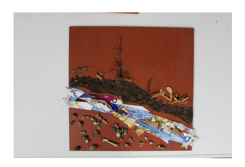
Geological Cross-section I Post-consumer debris, cardboard, Stryofoam, cardboard, tin foil, dirt, plants, rocks on tile 12 x 12" 2019 (left: detail)