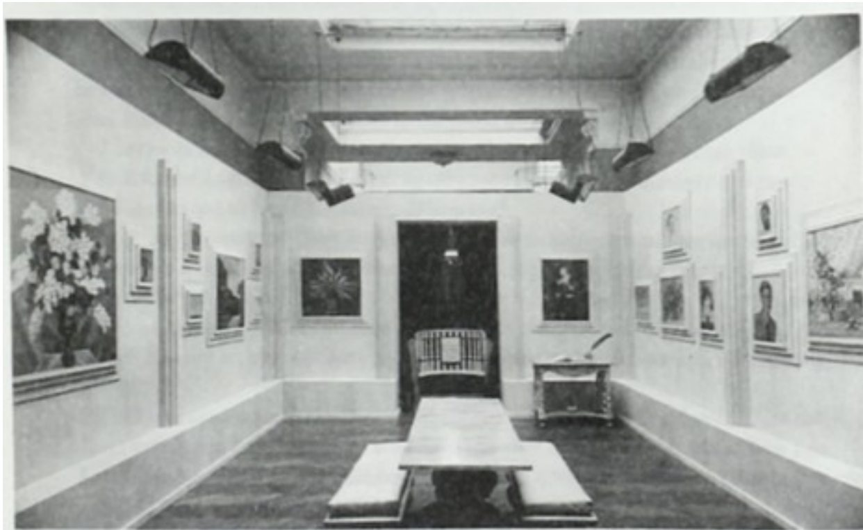
Figure 13. Gluck Room at the Fine Art Society, 1937. Diane Souhami, Gluck: Her Biography . London: Phoenix, 1988.