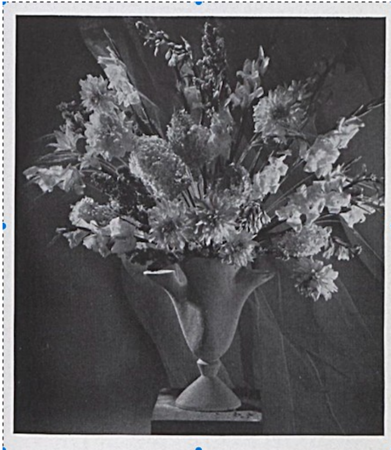
Figure 6. "An all-white arrangement of flowers is frequently more restful and effective than any combination of colours... Mrs. Spry has used a modern white vase and filled it with white dahlias, gladioli, hydrangea, Hyacinthus candicans, and white corn." Constance Spry, "Designs in Blossom," Vogue New York 84, issue 9 (Nov 1, 1934): 45.