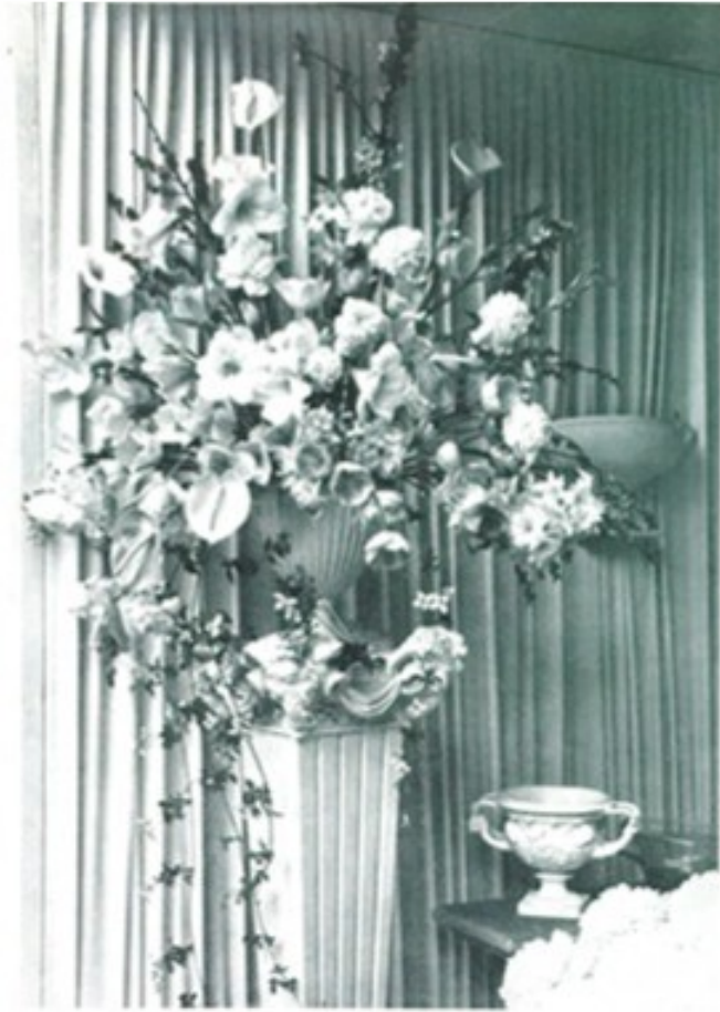
Figure 8. Wall vases, one with mixed bouquet including tulips, peonies, anthuriums, rhododendrons, and trails of clematis montana. Flowers in House and Garden (1937).