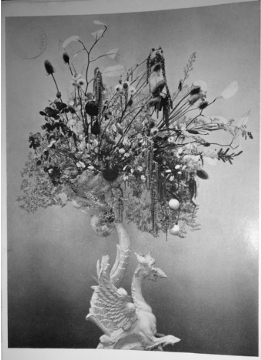
Figure 5. Constance Spry, "Griffin with dried mixture." A Constance Spry Anthology (London: J.M. Dent and Sons, 1953), 183.