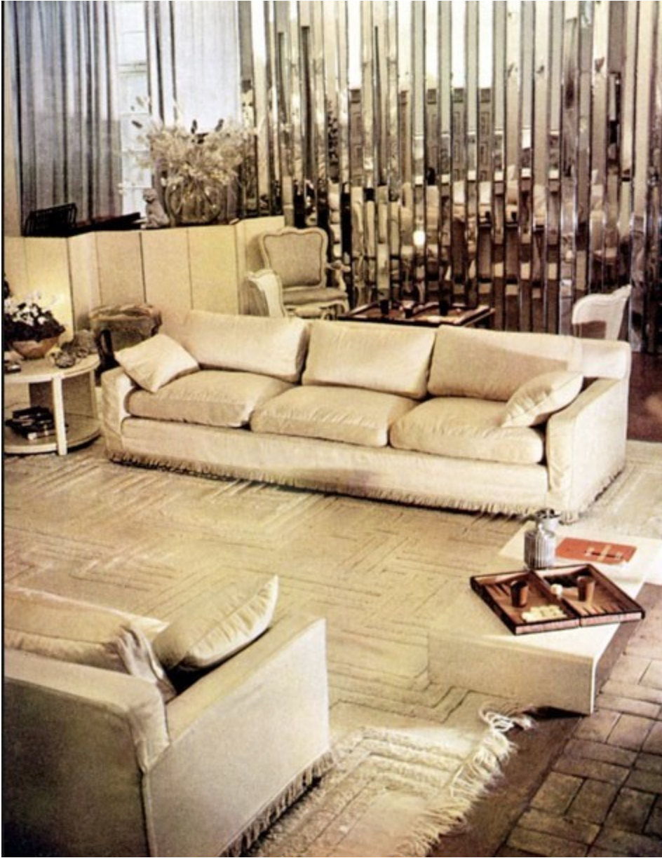
Figure 4. Syrie Maugham's all-white drawing room, for her home in King's Road, London, c. 1929-1930.