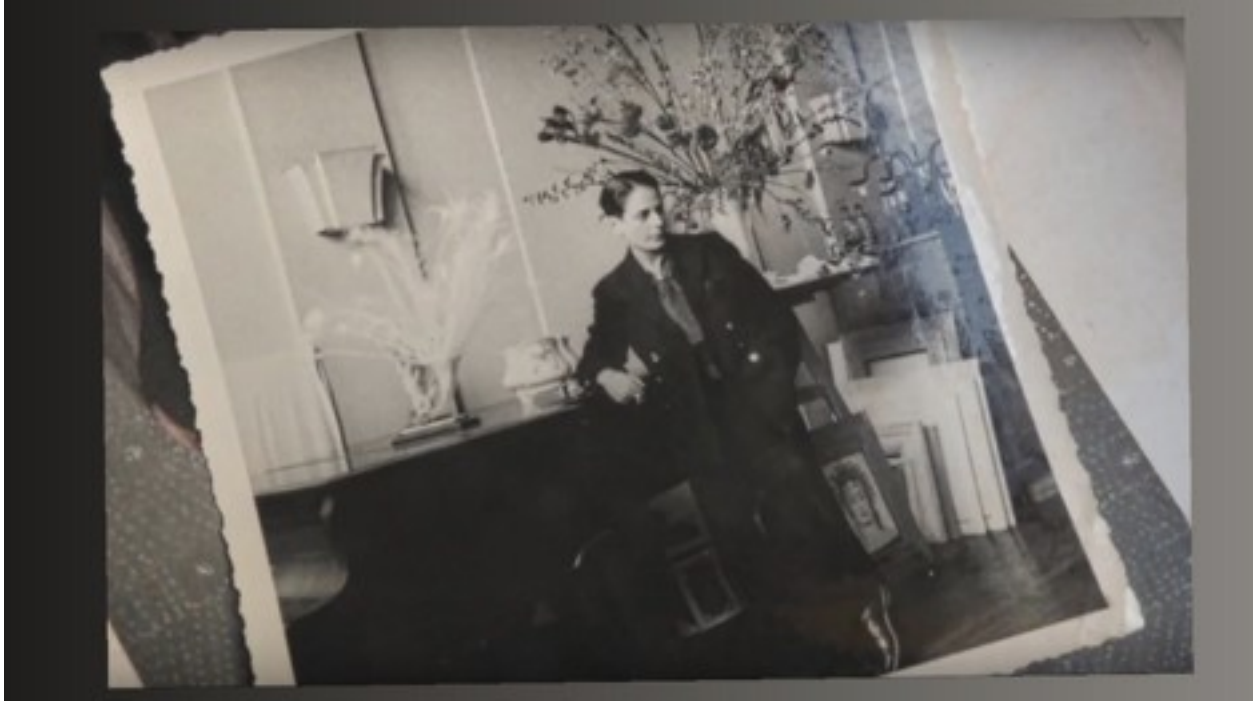
Figure 14. Gluck in the studio at Bolton House, c. 1937. Gluck: Who Did She Think He Was? , directed by Clare Beaven (UK: BBC Arts Production, 2017).