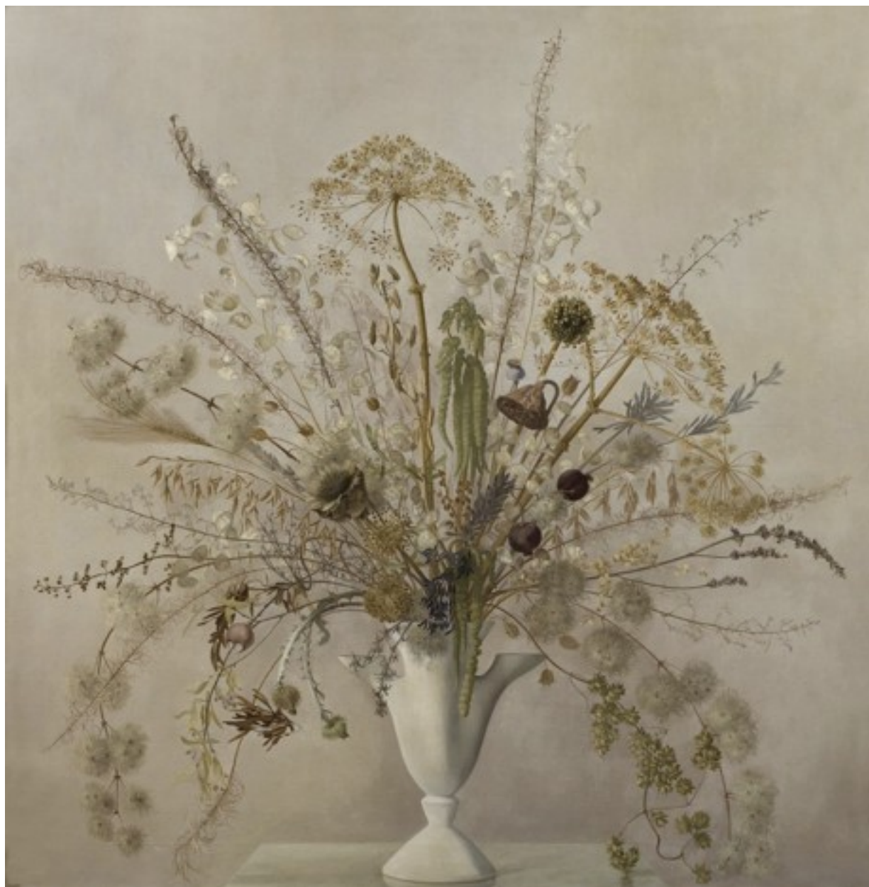
Figure 16. Gluck, Nature Morte , 1937. Oil on Canvas. 177 x 177 cm.