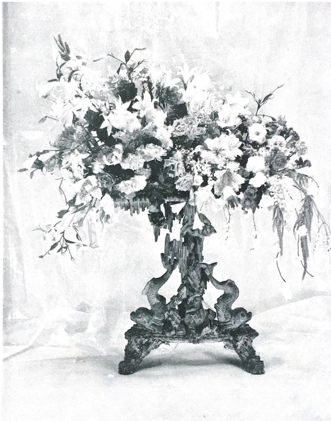
Figure 2. Constance Spry, "Mixed group of exotic flowers in old jardinière table." For Atkinson's, Old Bond street, London. Flowers in House and Garden (New York: J.P. Putnam's Sons, 1937).