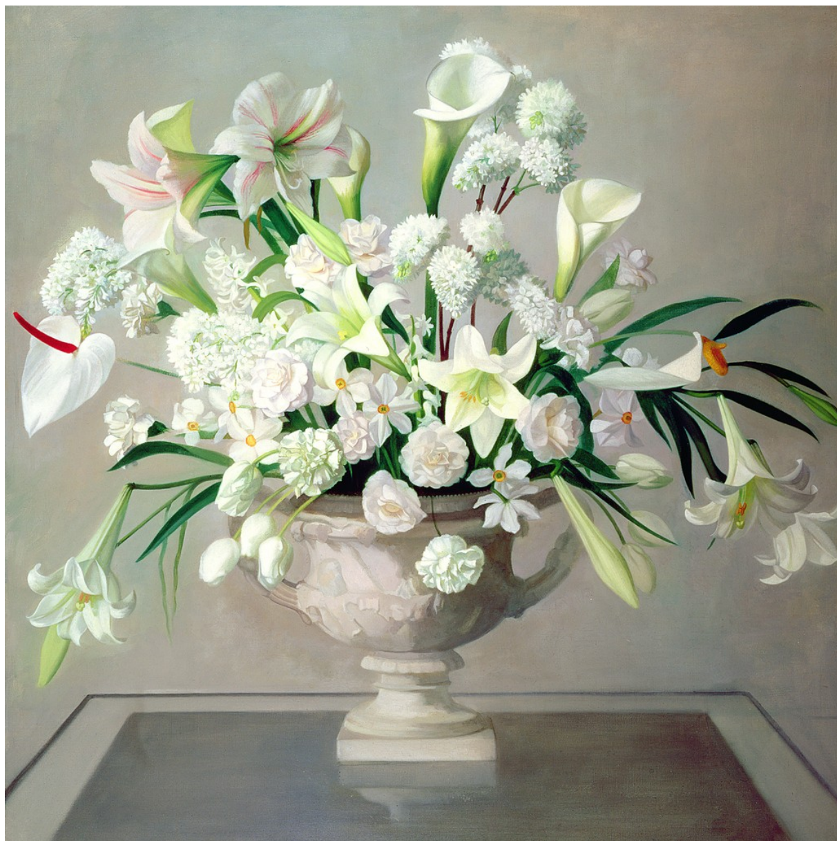
Figure 9. Gluck, Chromatic , 1932. Oil on canvas. 122 x 119 cm.