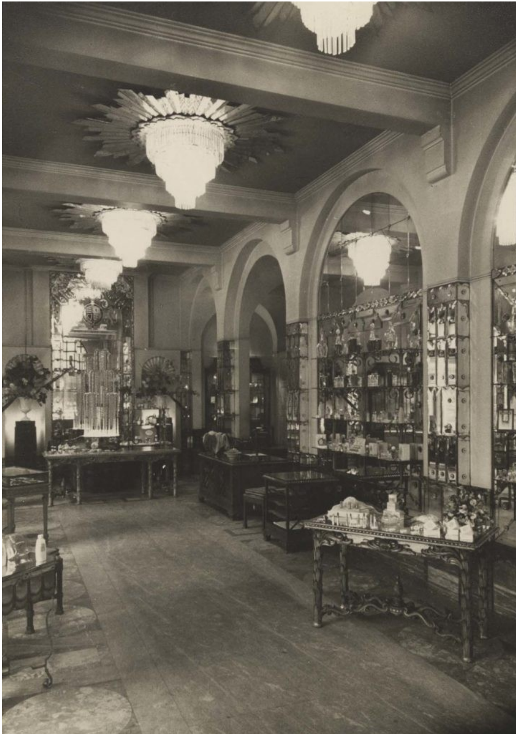
Figure 1. Atkinsons perfumery interior, designed by Norman Wilkinson and flowers by Constance Spry, 1929.