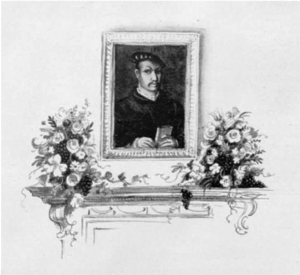
Figure 11. “Over the fireplace hangs a portrait of a man in a black coat. We wanted to make an arrangement of flowers which would stress the black note... we mixed white flowers with trails of black grapes.” Drawing by Rex Whistler. Constance Spry, “The Pleasure of Flowers,” Harper’s Bazaar (June 1935): 71.