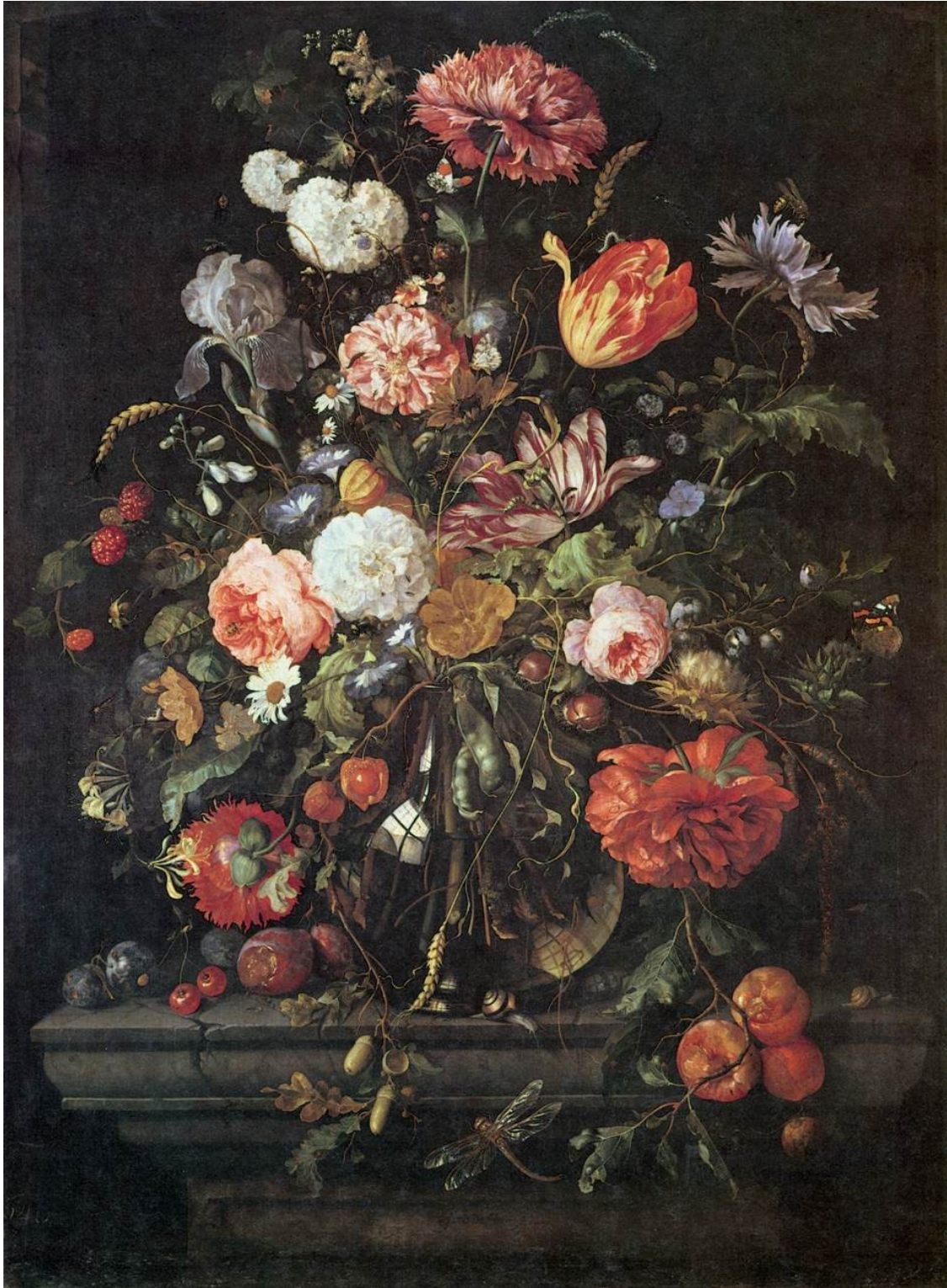
Figure 10. Jan Davidsz de Heem, Flowers in Glass and Fruit , 1651.