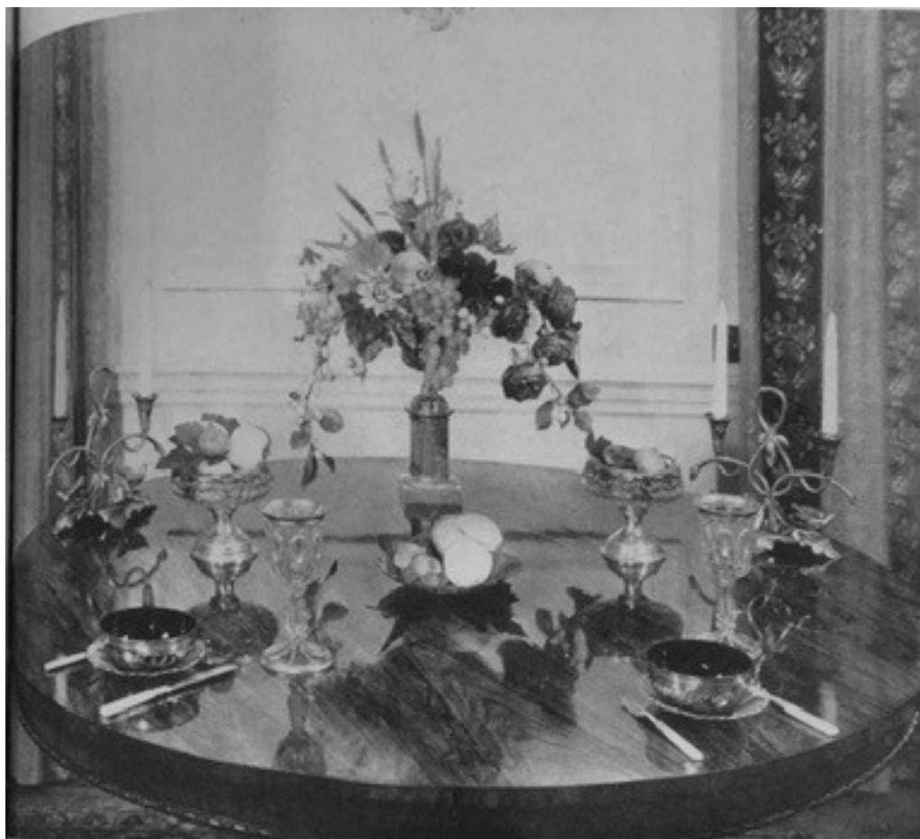
Figure 12. Constance Spry. A table arrangement with flowers and fruit. Garden Notebook (1940).