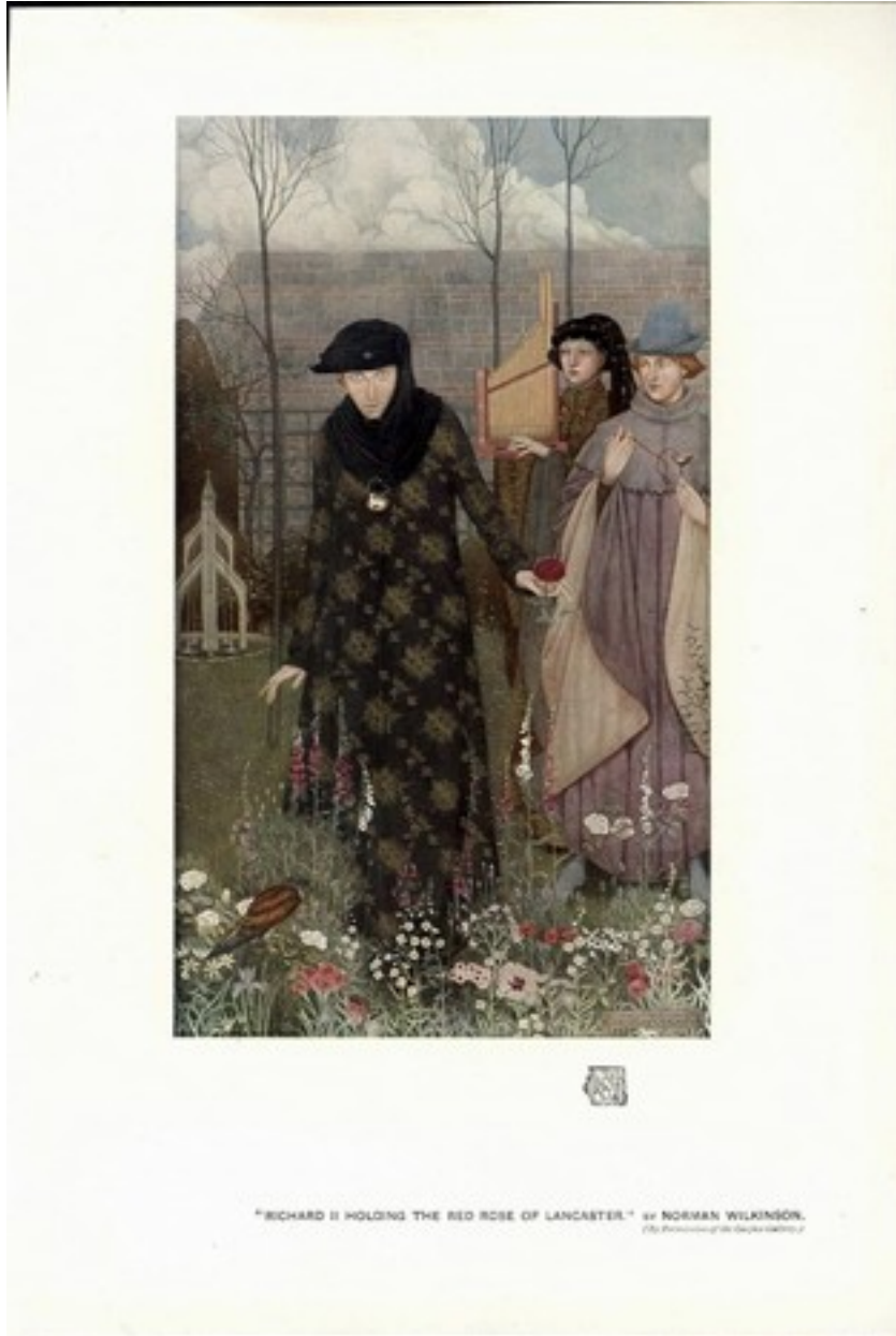
Figure 18. Norman Wilkinson, Richard II Holding the Red Rose of Lancaster , 1907. Print.