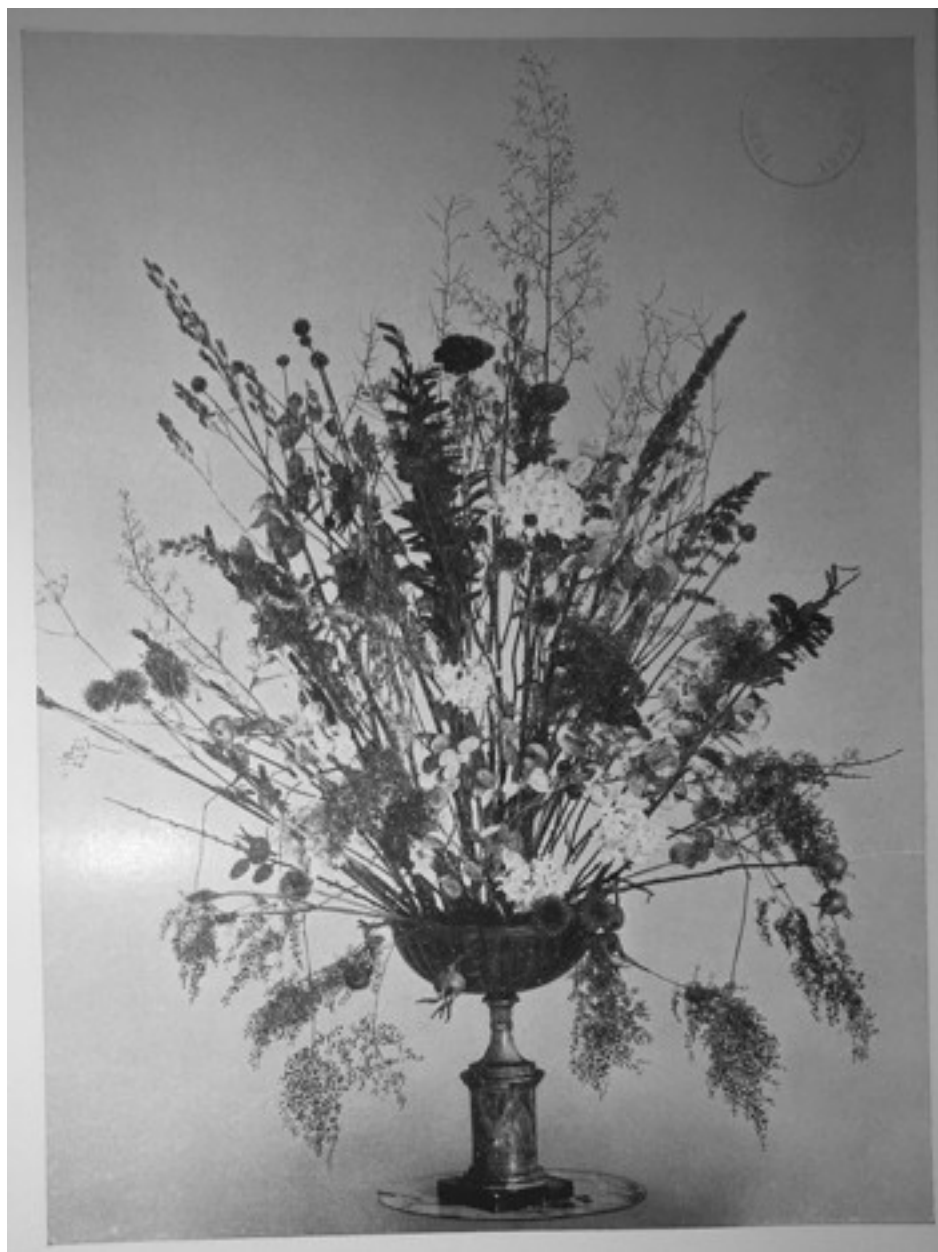
Figure 15. Constance Spry, "Dead Group in Black Marble Vase." Flower Decoration (1934), 143.