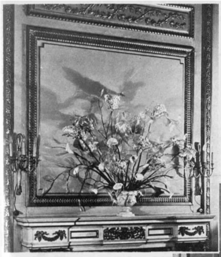
Figure 3. Constance Spry, Arrangement with white lilac, arum lilies, and cellophane. From Enid Corral, "New Ways with Flowers," Britannia and Eve , March 1, 1934, 63.