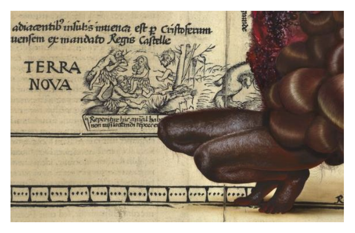
Figure 5.2 Firelei Báez, Untitled (Terra Nova) (2020) [Detail 2] oil and acrylic paint, laser print on canvas, 261.1. x 336.1 cm, Montreal, Quebec, Montreal Museum of Fine Arts.