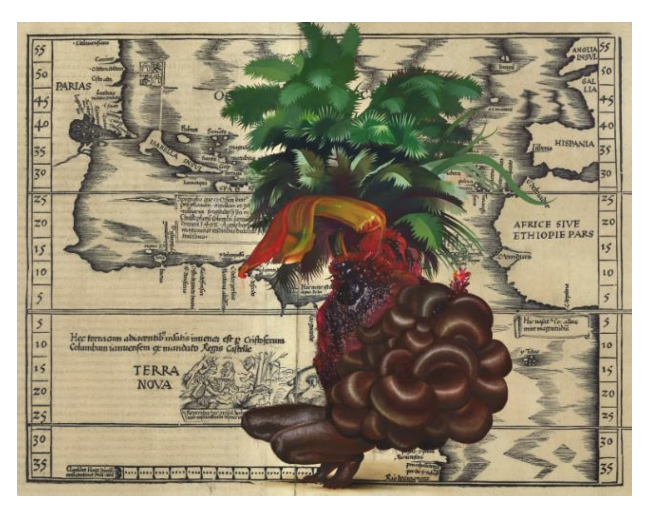
Figure 5. Firelei Báez, Untitled (Terra Nova) (2020) oil and acrylic paint, laser print on canvas, 261.1. x 336.1 cm, Montreal, Quebec, Montreal Museum of Fine Arts. Image source: <a href="https://www.mbam.gc.ca/en/collections/acquisitions/firelei-baez/">https://www.mbam.gc.ca/en/collections/acquisitions/firelei-baez/</a>.