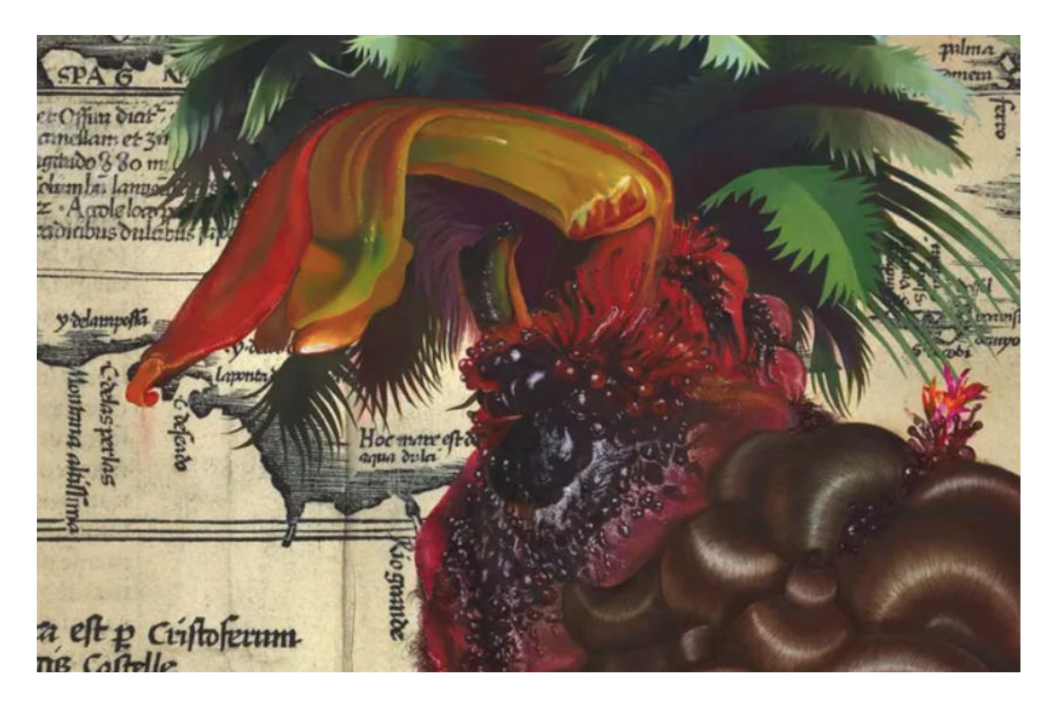
Figure 5.1 Firelei Báez, Untitled (Terra Nova) (2020) [Detail 1] oil and acrylic paint, laser print on canvas, 261.1. x 336.1 cm, Montreal, Quebec, Montreal Museum of Fine Arts.