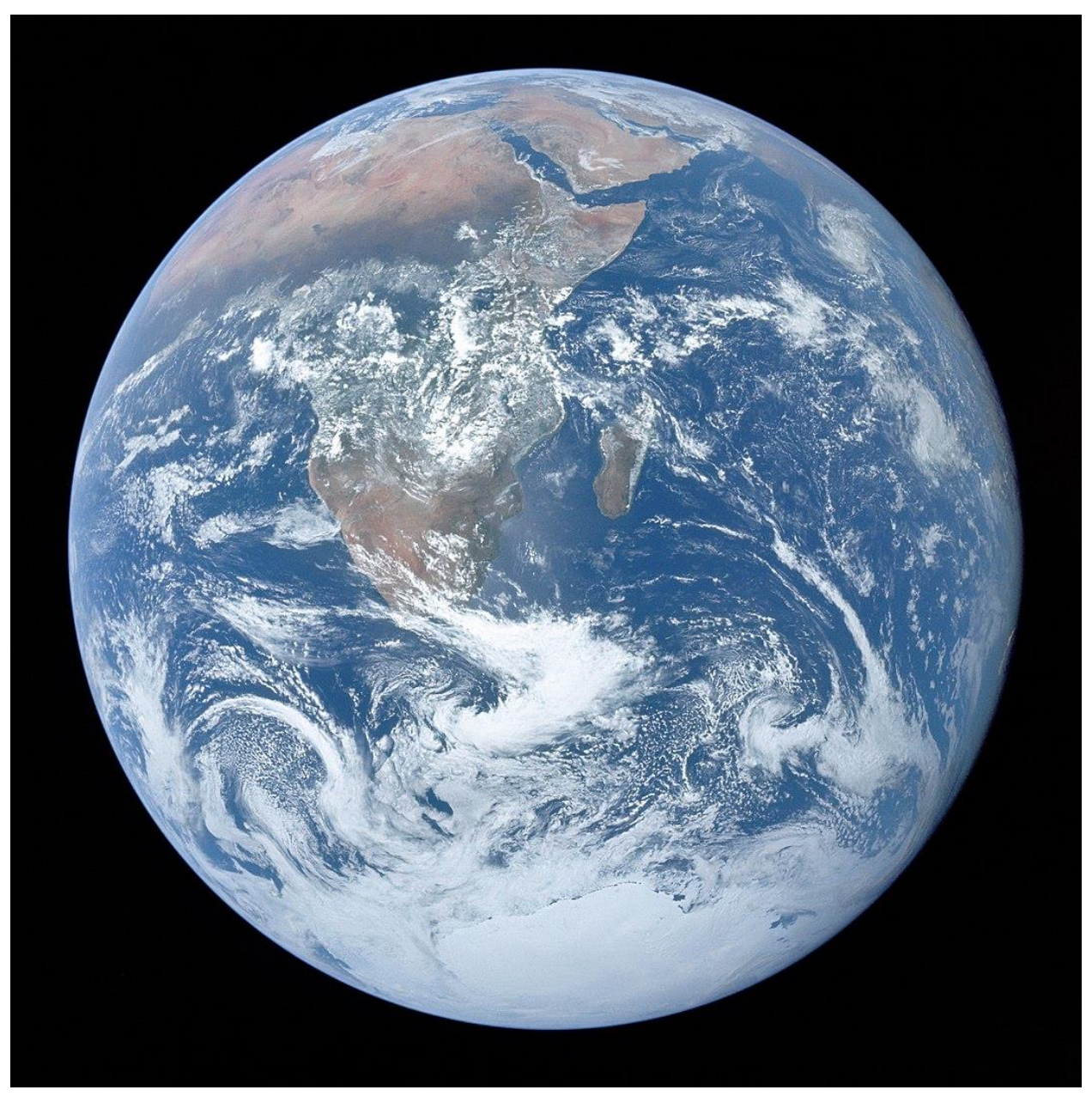
Figure 6. Harrison Schmitt and Ron Evans, The Blue Marble (1972) 70mm Hasselbald photograph, Washington DC, NASA Headquarters Archives. Image source: <a href="https://en.wikipedia.org/wiki/File:The_Earth_seen_from_Apollo_17.jpg">https://en.wikipedia.org/wiki/File:The_Earth_seen_from_Apollo_17.jpg</a>.