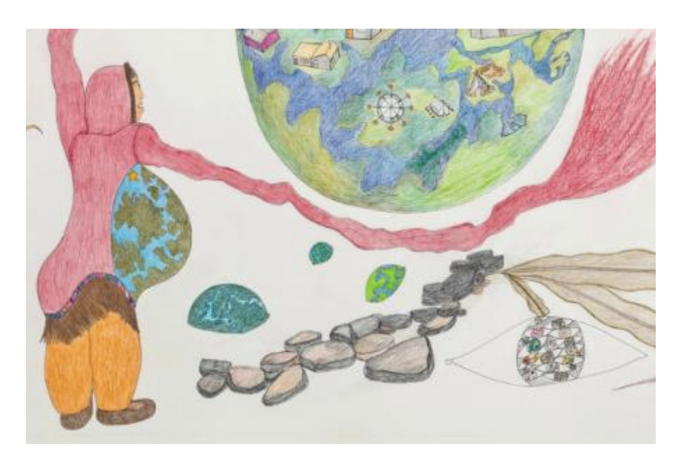
Figure 8.1. Shuvinai Ashoona, Untitled (woman giving birth to the world) (2010) [Detail] fine liner pen and coloured pencil on paper, 121.9 x 129.5 cm. Collection of John and Joyce Price. Image source: <a href="https://www.aci-iac.ca/online-exhibitions/shuvinai-ashoona-mapping-worlds/gallery/94662/">https://www.aci-iac.ca/online-exhibitions/shuvinai-ashoona-mapping-worlds/gallery/94662/</a>.