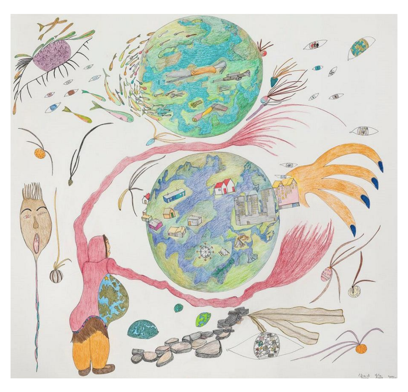
Figure 8. Shuvinai Ashoona, Untitled (woman giving birth to the world) (2010) fine liner pen and coloured pencil on paper, 121.9 x 129.5 cm. Collection of John and Joyce Price. Image source: <a href="https://www.aci-iac.ca/online-exhibitions/shuvinai-ashoona-mapping-worlds/gallery/94662/">https://www.aci-iac.ca/online-exhibitions/shuvinai-ashoona-mapping-worlds/gallery/94662/</a>.