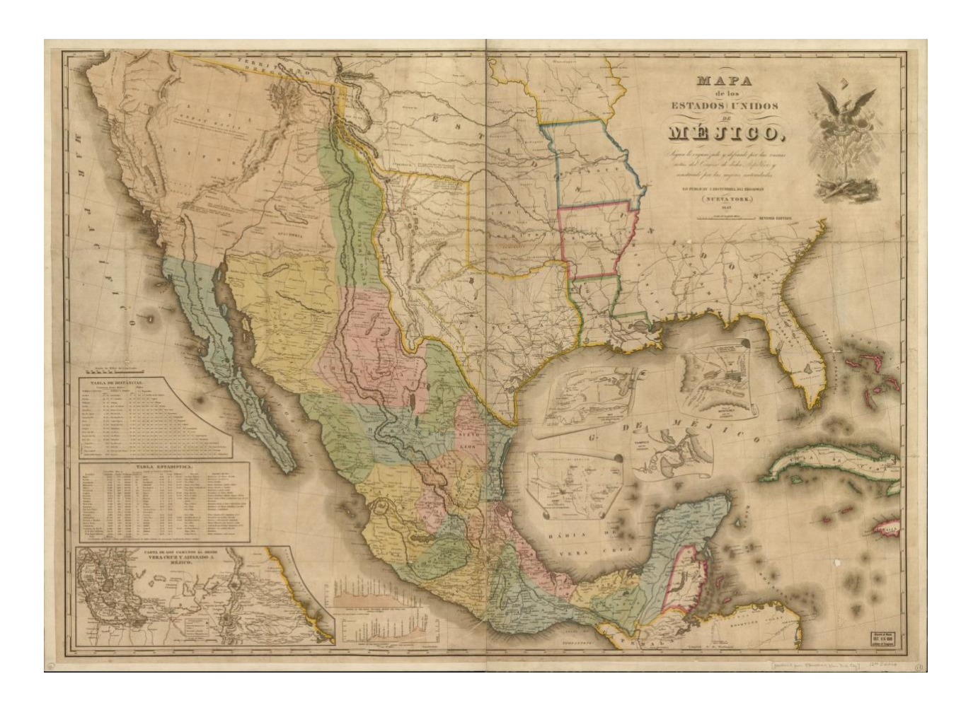
Figure 3. John Disturnell, Mapa de les Estados Unidos de Méjico (1847) print with hand coloured detailing, 75 x 104 cm, Washington, DC, Library of Congress Geography and Map Division. Image source: <a href="https://www.loc.gov/resource/g4410.ct000127/?r=-0.196,-0.01,1.491,0.796,0">https://www.loc.gov/resource/g4410.ct000127/?r=-0.196,-0.01,1.491,0.796,0</a>.