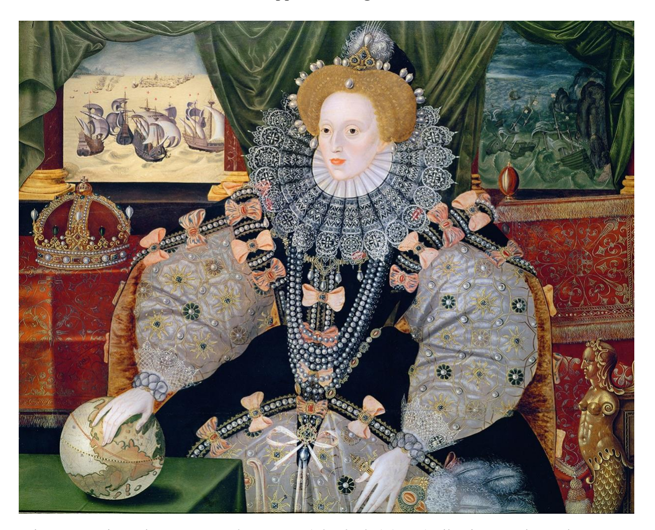
Figure 1. Artist Unknown, Armada Portrait (Elizabeth I) (1588) oil paint on oak panel, 112.5 x 127 cm, London, UK, National Maritime Museum.