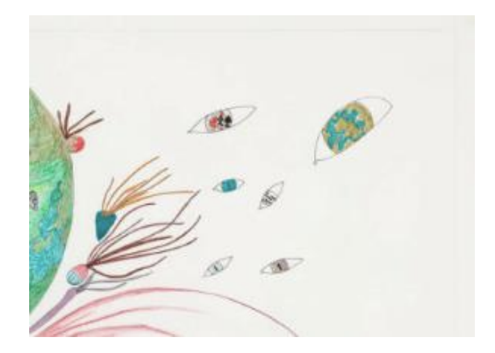
Figure 8.2. Shuvinai Ashoona, Untitled (woman giving birth to the world) (2010) [Detail] fine liner pen and coloured pencil on paper, 121.9 x 129.5 cm. Collection of John and Joyce Price.