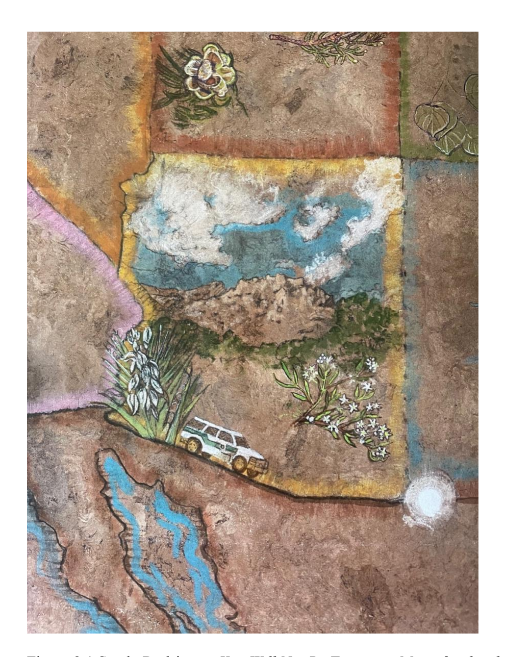
Figure 2.1 Sandy Rodriguez, You Will Not Be Forgotten Mapa for the children killed in custody of the US Customs and Border Protection (2019) [Detail] hand-processed watercolour and 23k gold on amate paper, 240 x 119.4 cm, Fort Worth, Texas, Amon Carter Museum of American Art.