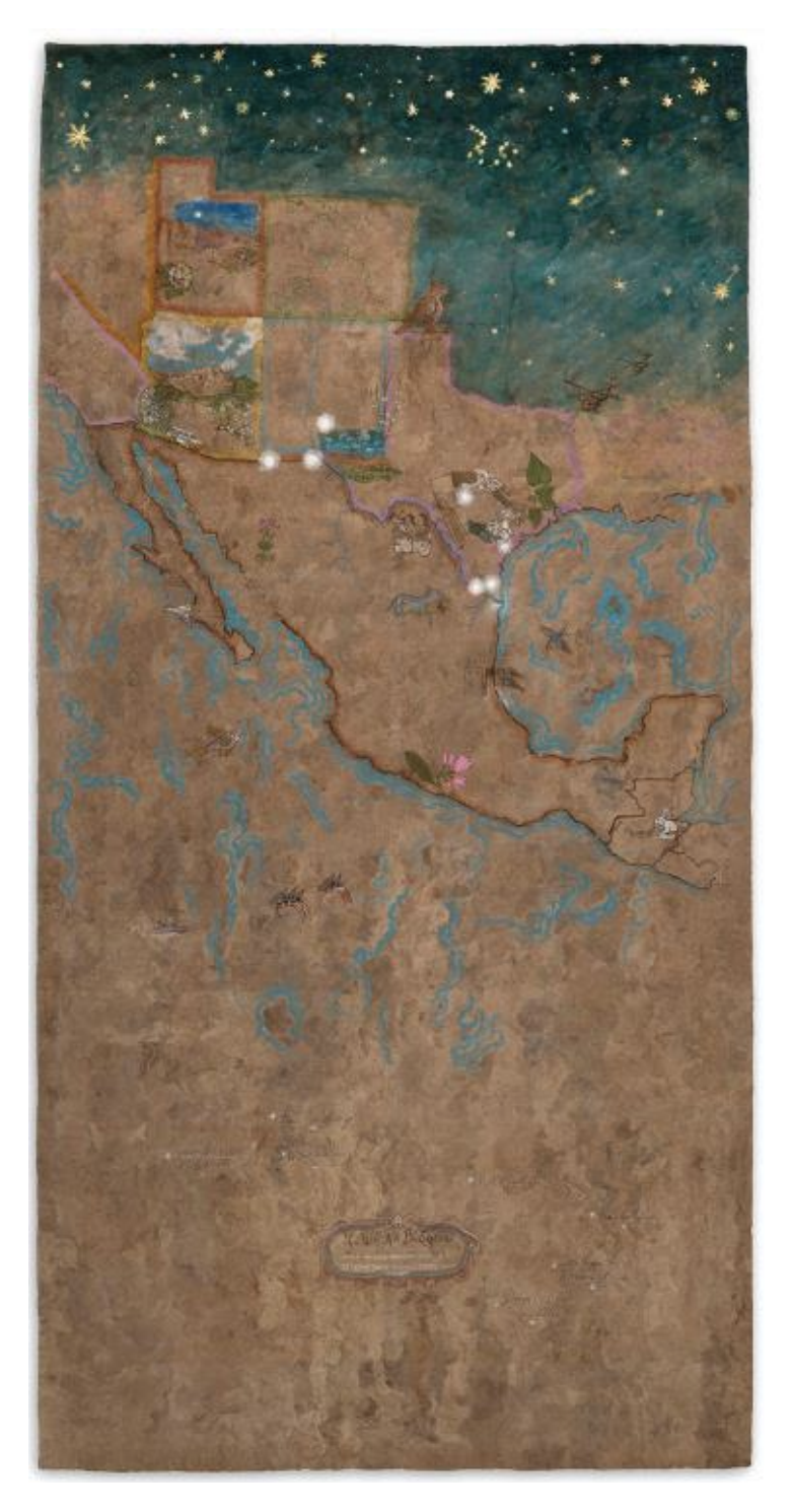
Figure 2. Sandy Rodriguez, You Will Not Be Forgotten Mapa for the children killed in custody of the US Customs and Border Protection (2019) hand-processed watercolour and 23k gold on amate paper, 240 x 119.4 cm, Fort Worth, Texas, Amon Carter Museum of American Art.